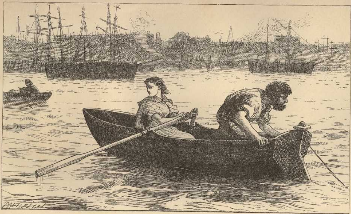
THE BIRD OF PREY.