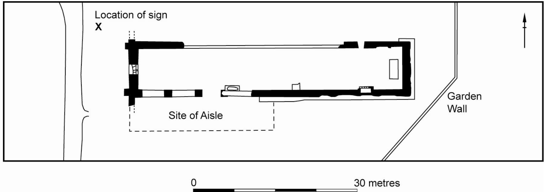
Fig. 1. Location of excavation at Armagh Friary, County Armagh.