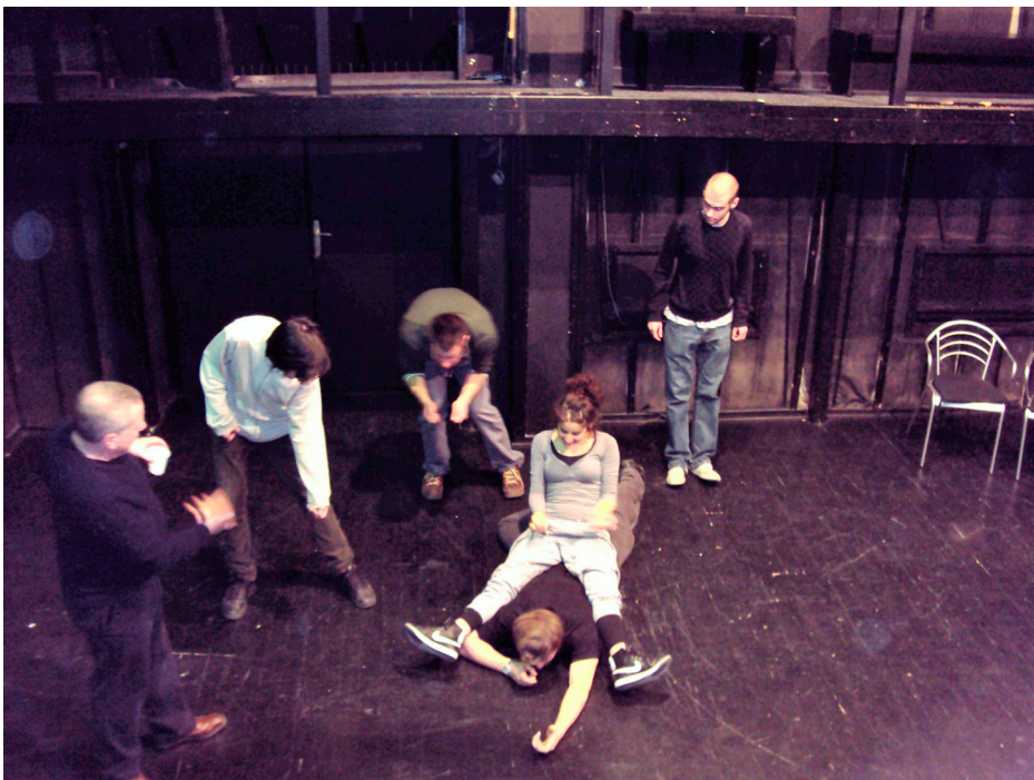
Figure 4. Acting students in Sarajevo create a 'sculpted' image of their city in 2009.

To give two examples, the image in Figures 4 created by local drama students in a workshop I facilitated in Sarajevo in 2010. The image in Figures 5 was created by drama students in Belfast in 2011. In each case the brief was to create an image of their own city. The stated intention of the Sarajevo students was to create an image of the Winter Olympics, which even after an intervening Civil War is the way they choose to present their city to the world. The stated intention of the Belfast students was to create an image of the Titanic, of which Belfast remains ironically proud ('It was alright when it left here!'). But when other members of each group were invited to interpret these images, several reported