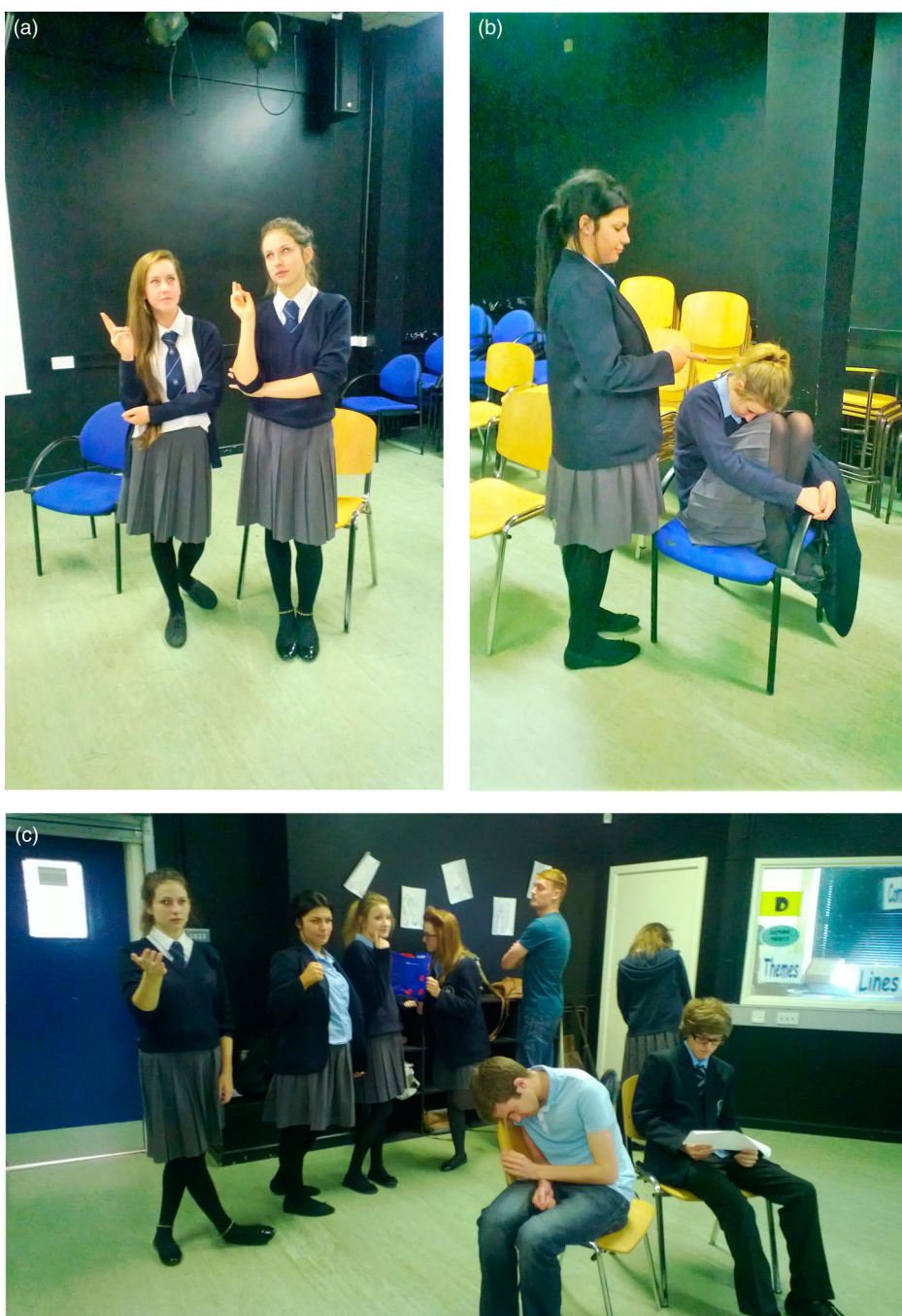
Figure 9. Secondary school students in Belfast demonstrate their embodied recall of characters from Mojo Mickybo by Owen McCafferty in 2013.

relate ambivalently and so are capable of producing a range of interpretations which do not exclude 'over-riding truths'. (email to author 20/3/2013)