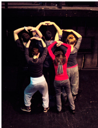
Figure 6. An image of Sarajevo created by local acting students in 2009.

That is to say, though the making of the image is clearly dependent on the initiative of its makers, and while they themselves will certainly have a sense of what it means from within the image, its full communicative function is only realised when it is viewed by other observers. The making of meaning, therefore, is a collaborative process. So while we began with an analysis of the image-making process, we now turn to a consideration of how this relates to the reception of the image by others.