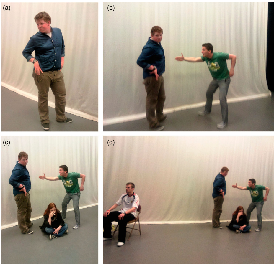
Figure 2. Drama students create an accumulative image of Belfast at Queen's University in 2012.

An analysis of this process based on the difference between body image and body schema allows a distinction to be drawn between those aspects of the image which derive from each participant's active awareness of how they position their own body, and those aspects which emerge from beneath their surface consciousness. Because of their conscious initiation, the former can be described as semiotic and meant ; the latter more subliminal elements of the image including the subtle nuances of gesture,