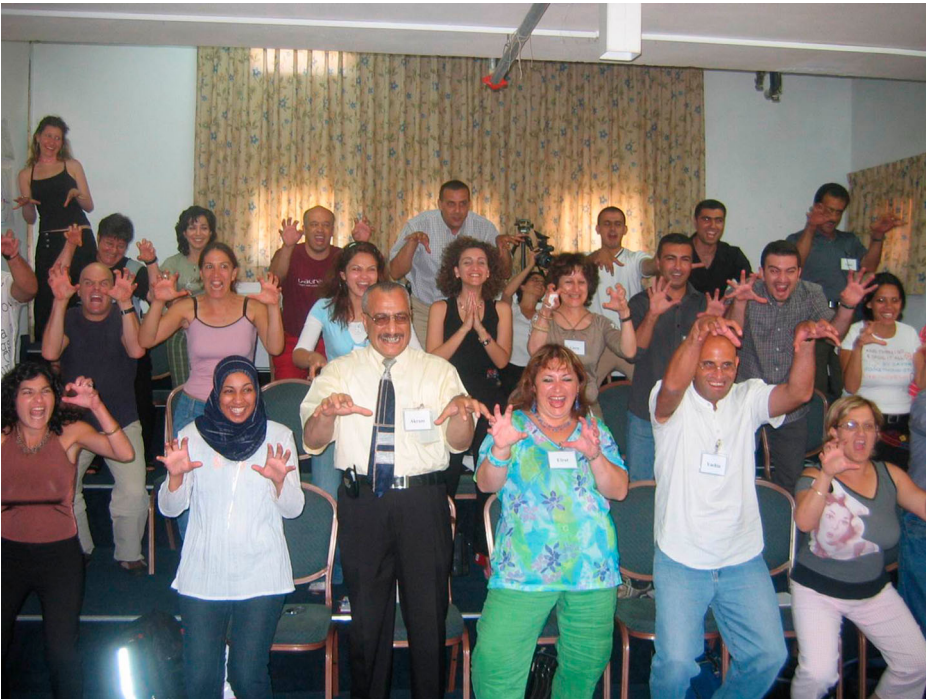
Figure 3. Israeli and Palestinian schoolteachers learning how to play 'Samson, Delilah and the Lion' in Jerusalem in 2008 (photo courtesy of the author).

audience members respond to images created by one of their number using four chairs (2002, 163). The image-maker is invited to make one chair more important than the others by moving one or more of them within the 'aesthetic space' which is TO's flexible platform. However simple an image may appear, there is usually some division of opinion within the audience about which has become the most important. Quite often, for instance, the image-maker will place one of the four chairs facing the other three, which some observers will interpret as a classroom, others as a tribunal. In the classroom version, the teacher standing alone at the front seems more important. In the tribunal, it is the chair of the tribunal (or of the interview committee) who has the dominant role. Through discussion of the exercise, the group can be encouraged to recognise that each interpretation has equal potential validity, and individuals in the group become more confident in their own subjective interpretation of the images they go on to create together. The readiness to accept the possibility of multiple coexisting meanings is vital for effective Image Theatre.