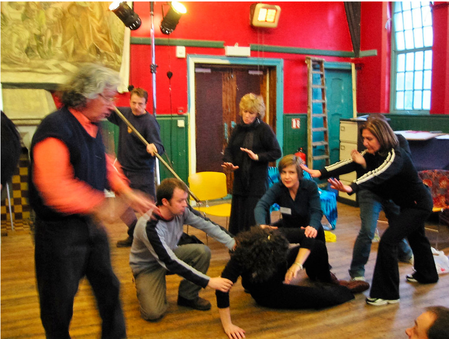
Figure 1. Augusto Boal leading an image theatre workshop for cardboard citizens, London, 2002.

This distinction, when illustrated with these simple examples seems straightforward enough, but once we try and apply it to the more complex dramaturgy of a full stage image it becomes more difficult to distinguish the symbolic from the sinaletic. Some elements of the image may seem closer to the ‘thumbs-up’ gesture in that we read them in a symbolic way, others we may understand more phenomenologically through an empathetic engagement with the feelings they express, while still more may combine both modes of expression. Psychologist, Shaun Gallagher’s work on the relationship between spoken language and physical gesture provides a helpful analogy in trying to unravel these differences. By establishing a direct link between thought and action, he may have provided the key to understanding how stage images appear sometimes to tap into our unspoken thoughts.