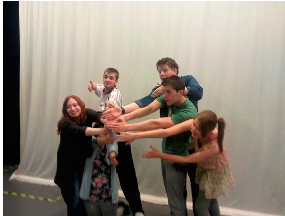
Figure 5. Drama students create a 'sculpted' image of Belfast at Queen's University in 2012.

seeing a sniper in the foreground of the first image; and in the second image hints of an unresolved peace process – many hands held out but none reciprocated with a handshake. Once presented with these alternative readings, most of the originators of each image were content to accept this as a legitimate parallel reading. What excites me most about the propensity of Image Theatre to generate thought-provoking alternative interpretations to those consciously intended by their creators is the possibility that these alternatives arise from a subliminal embodied thought process in their creators. If Merleau-Ponty is correct that language 'accomplishes' thought, and we accept Gallagher's argument that gesture is language, is it possible that Image Theatre can channel its makers' thoughts without recourse to words? Another image from my Sarajevo workshop may help amplify the point.