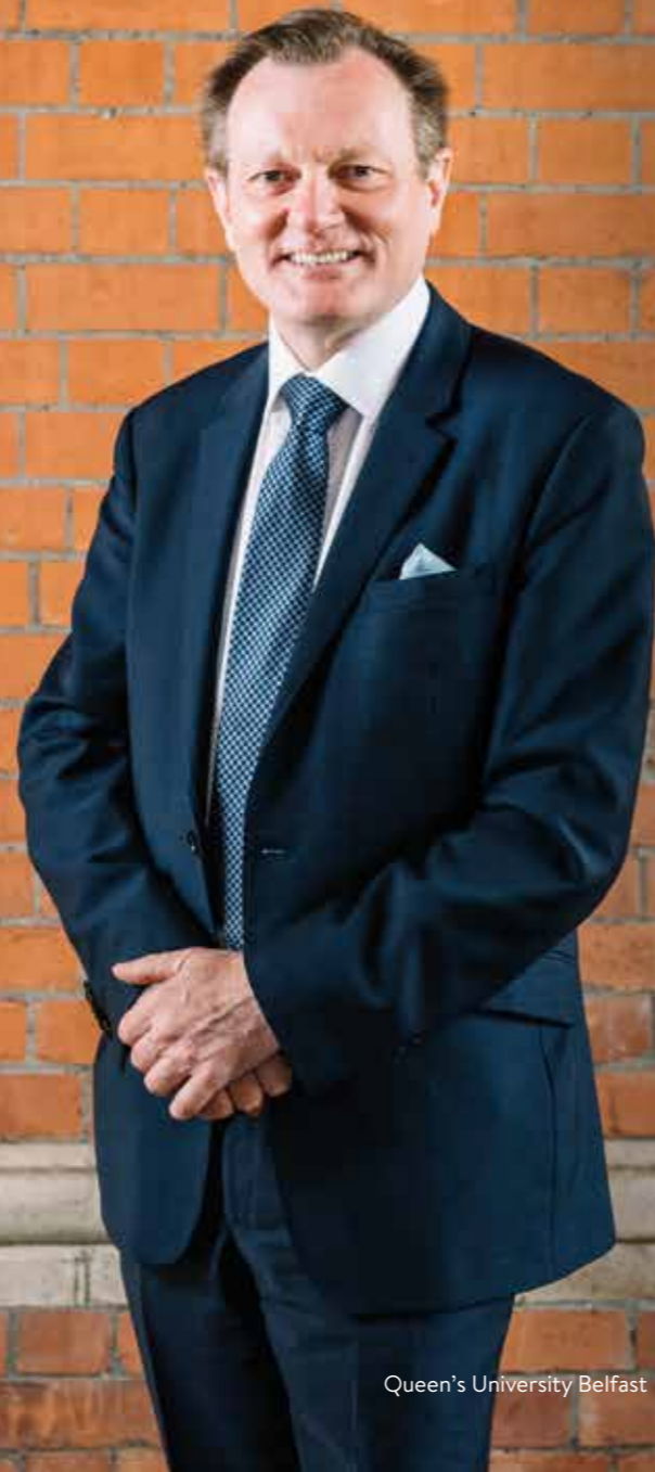
Queen's University Belfast