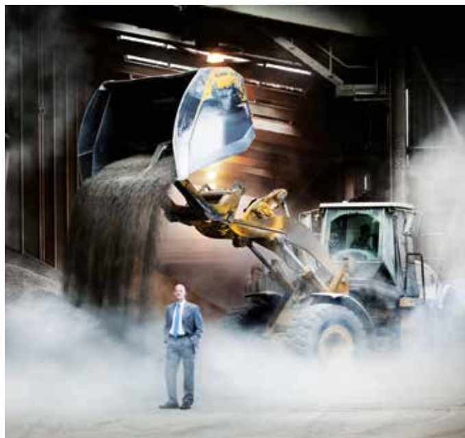
The Institute for Global Food Security, tackling one of the greatest global challenges – a safe and nutritious supply of food for the world's population.