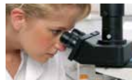
The Centre for Cancer Research and Cell Biology is developing cancer treatments and pioneering advances in patient care.

The Institute has three operational divisions: the Centre for Cancer Research and Cell Biology (CCRCB), the Centre for Public Health (CPH) and, the latest addition, the Wellcome-Wolfson Institute for Experimental Medicine (WWIEM). The state-of-the-art facilities developed at the Institute are part of an