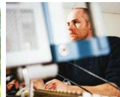
CWI - Developing truly disruptive, end-to-end physical layer wireless technologies and techniques.