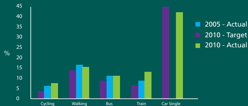
Figure 1: Usual Mode of Transportation on a Weekly Basis – Staff

Table 1 demonstrates that the University is performing well in the adoption of sustainable travel modes when compared with the most recent travel to work survey results for Northern Ireland as a whole. The University has at least 30% less car users than the Northern Ireland average, and correspondingly more staff travel to University by public transport, walking and cycling.