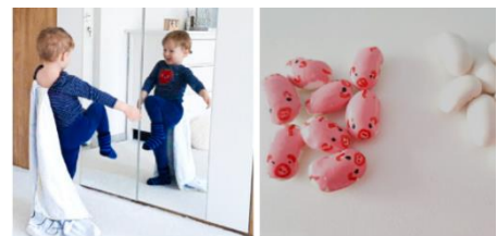
OUR 12 BEST ACTION SONGS TO SING WITH KIDS

https://toddlerinaction.com/category/toddler-activities/