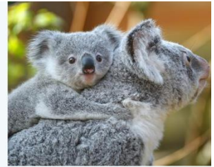
OUTBACK KOALA CAM