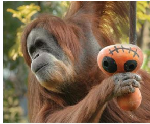
LOST FOREST - NEW BABY! APE CAM

https://www.dublinozoo.ie/animals/animal-webcams/