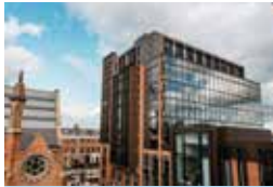
2 The Main Site Tower