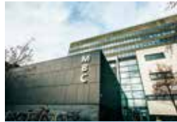
21 The MBC