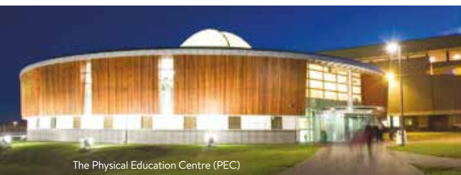
The Physical Education Centre (PEC)