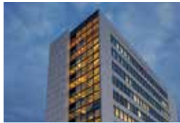
31 The Ashby Building