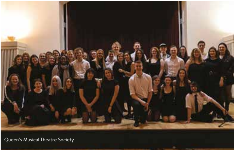
Queen's Musical Theatre Society