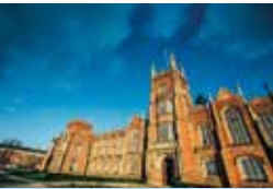
1 The Lanyon Building