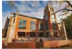
11 The McClay Library