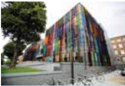
27 Computer Science

Jobshop Lanyon Building Library Main Site Tower McClay Research Centre Medical Biology Centre (MBC) Naughton Gallery Northern Ireland Technology Centre (NITC) Occupational Health One Elmwood Student Centre People and Culture Peter Froggatt Centre (PFC) Pharmacy Building Physical Education Centre (PEC) Physics Building (New) Physics Building (Old) Queen's Film Theatre (QFT) Registrar and Chief Operating Officer Research and Enterprise Riddel Hall Safety Services Seamus Heaney Centre Sonic Arts Research Centre (SARC) South Dining Hall Student and Campus Life Student Centre - One Elmwood University Health Centre Vice-Chancellor's Office Welcome Centre Whitla Hall Whitla Medical Building Wellcome-Wolfson Institute for Experimental Medicine