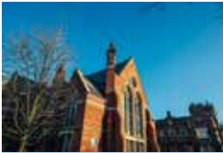
4 The Graduate School