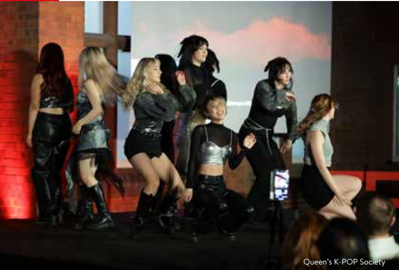
Queen's K-POP Society