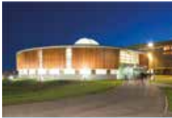
36 The PEC