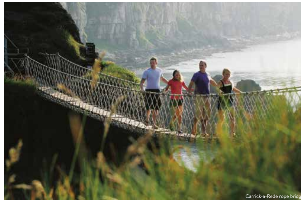
Carrick-a-Rede rope bridge