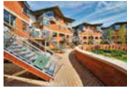
35 Willow Walk