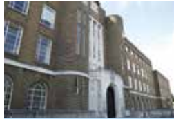
28 The David Keir Building