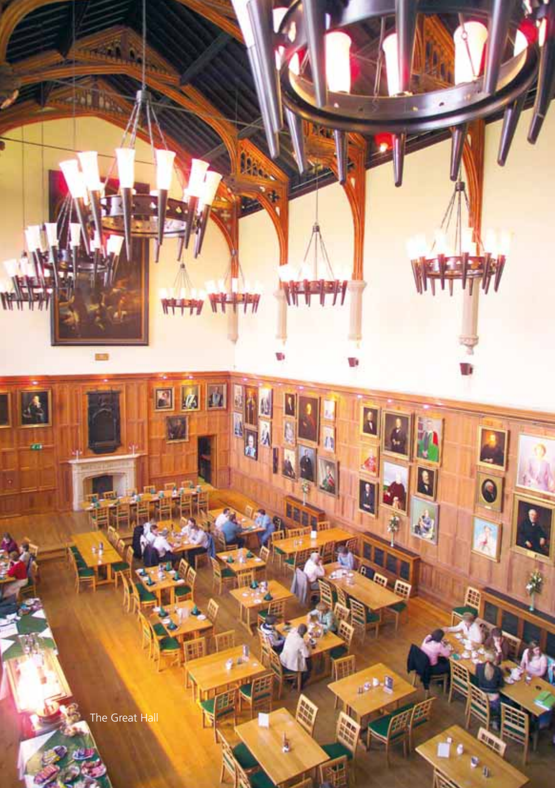
The Great Hall