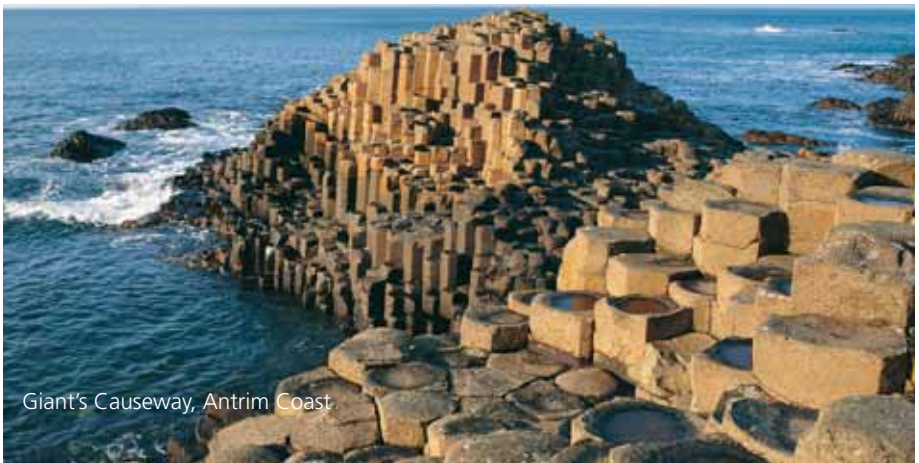
Giant's Causeway, Antrim Coast.

Other services include cloakroom, showers and bath facilities, TV rooms, snooker and darts room, and minibus hire.