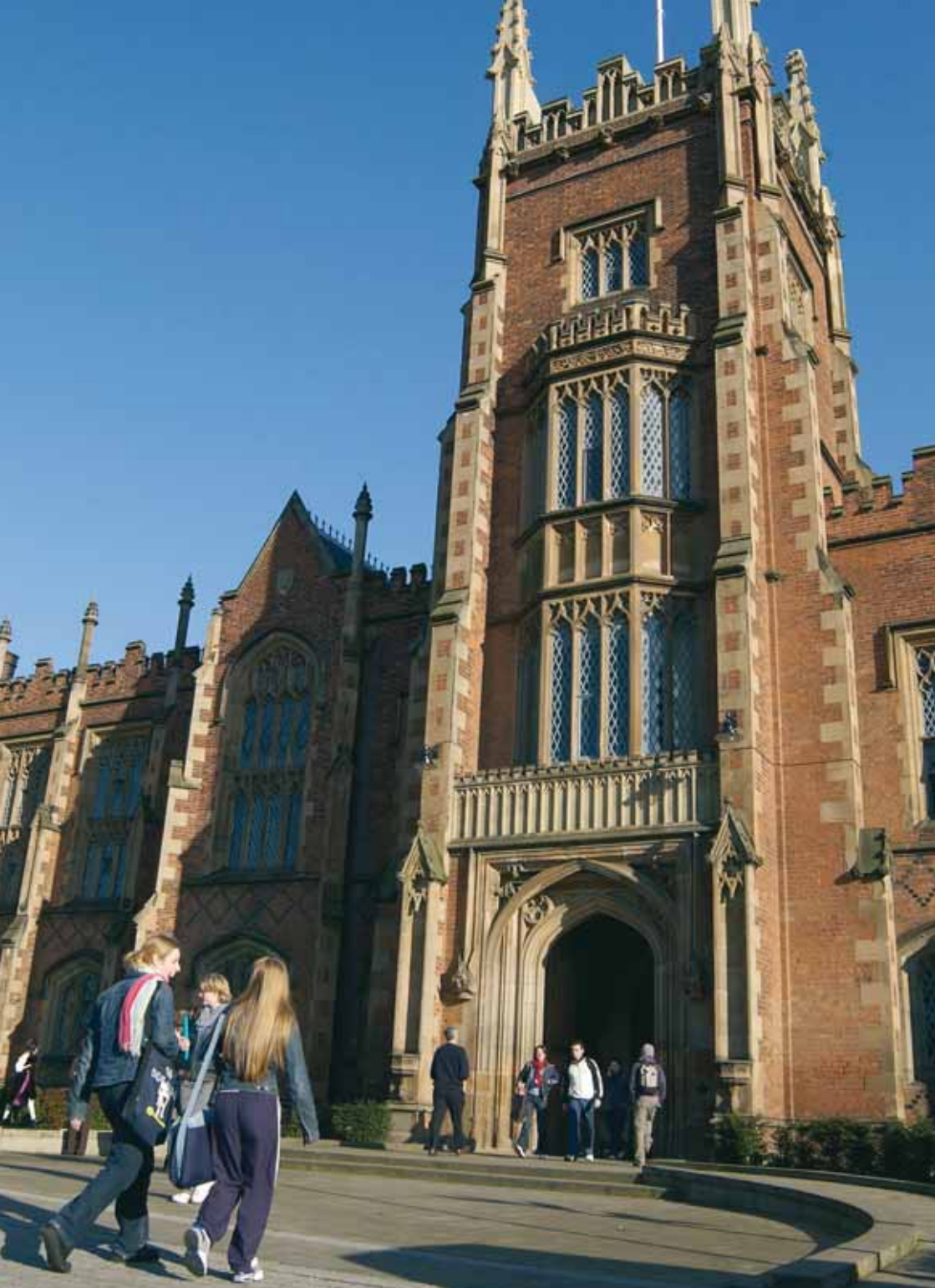
Main Entrance, Lanyon Building