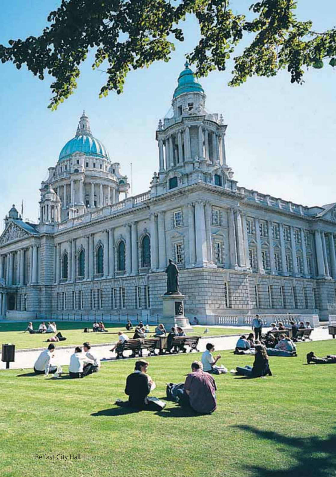
Belfast City Hall