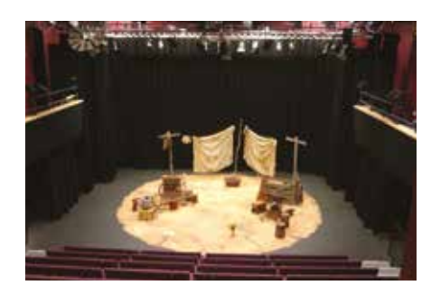
Superb 120 seat studio theatre, including rehearsal room, dressing rooms, green room and workshop.