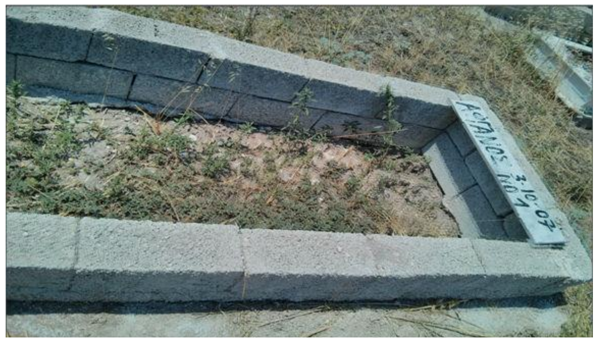
Figure 1 Photo of a grave of an unidentified migrant in the cemetery of Lesbos. The marker reads: 'Afghan, 3-10-07, No.1' (photo taken July 2013)

such as burials -- explains the absence of a concrete policy, which has dire effects on the management of migrant bodies and on their families.