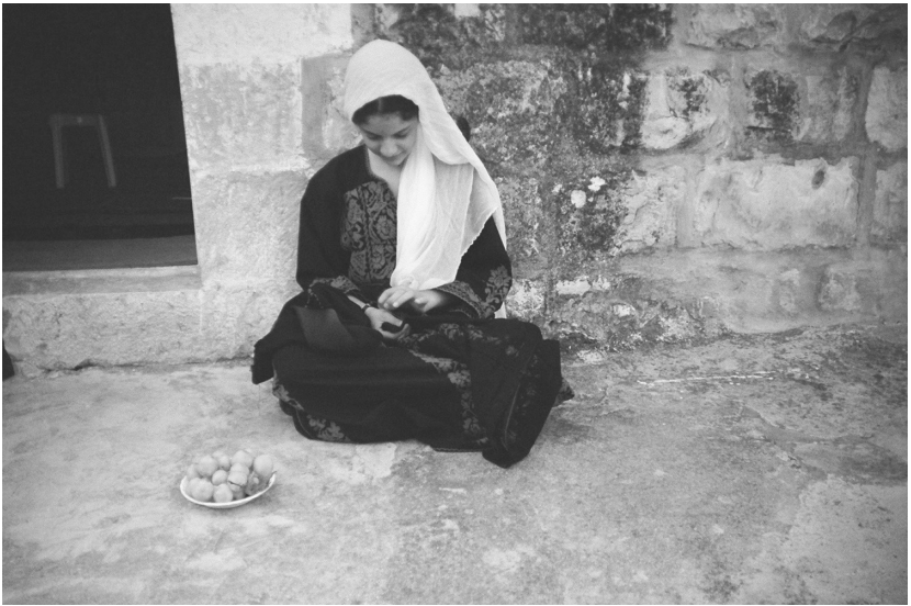
Figure 1. Woman in Traditional Dress. “This photo shows the traditional Palestinian dress. Its beautiful designs reflect people’s passion for culture and art.” Contrast Project, 2006.

First, the portrayal of positive aspects of life in Palestine often appeals to common values and contradicts the “other” identity. For example, photographs from the Contrast Project, a youth media project in the Bethlehem area, that reflect Palestinian culture (such as traditional crafts, architecture, and food) often defy commonly held conceptions of the barbaric other (see Figure 1).