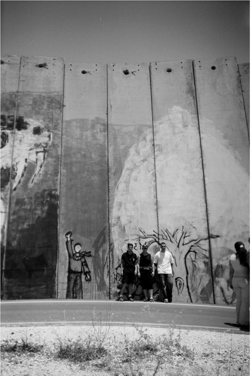
Figure 4. Separation Wall. “Just as a tree has many branches, this photo expresses how the Palestinian people belong to each other and how we are all together against the Occupation.” Contrast Project, 2006.