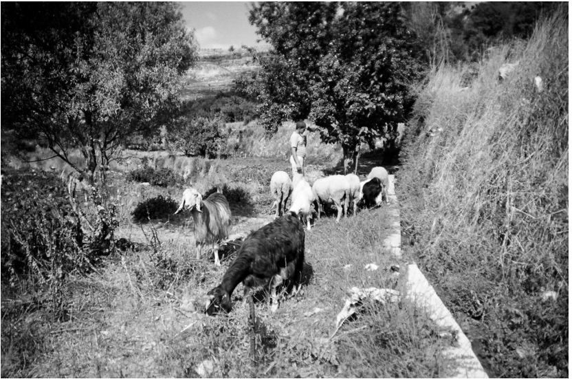
Figure 3. Man with Goats. Contrast Project, 2006.

for the amplification of voice at four levels, providing opportunities for both internal validation and enhanced understanding from the other: