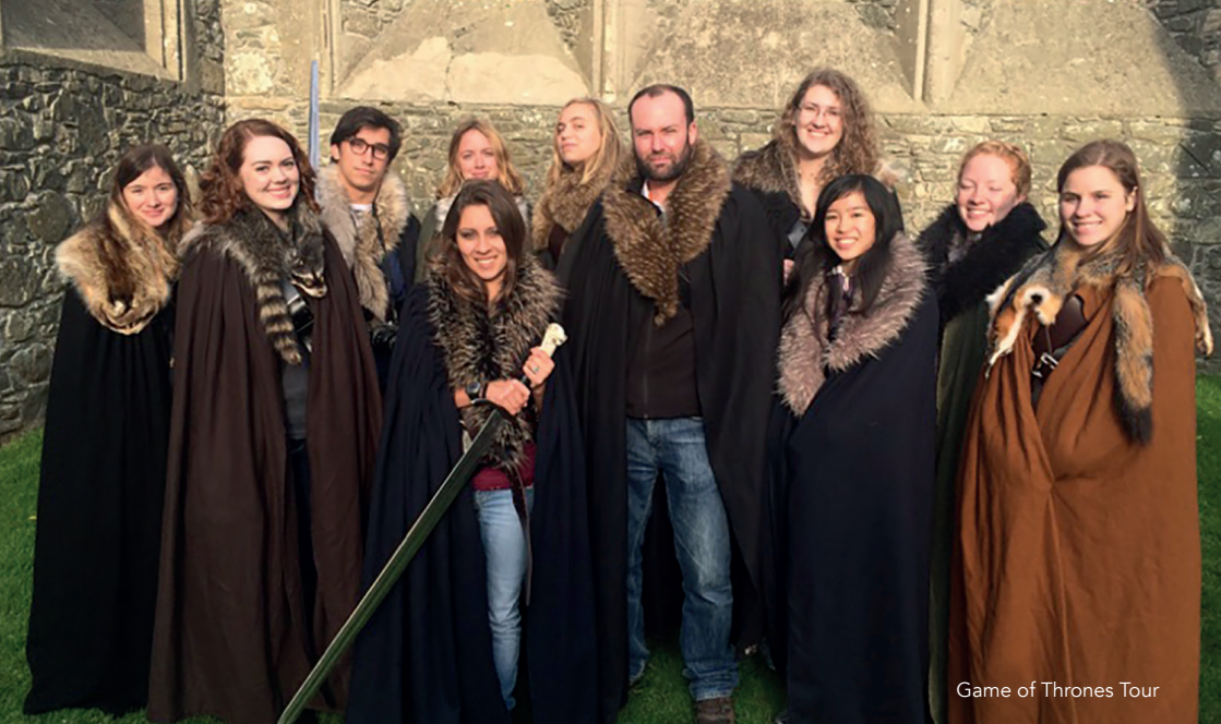
Game of Thrones Tour