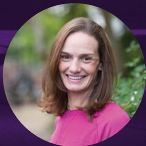
PROFESSOR DEBBIE LISLE

Teaching and research interests in contemporary French and Chinese literature and Migration Studies.