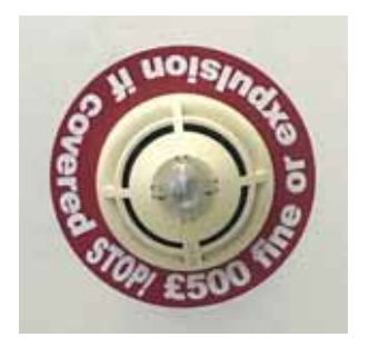
Fig. 2 smoke/heat detector in room