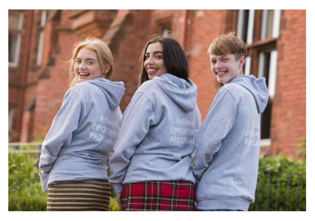
Pathway Opportunity Programme students

The easiest way to update an existing will is through a codicil document. A template codicil is inserted in the back sleeve of this brochure.