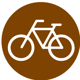
19 Bike storage