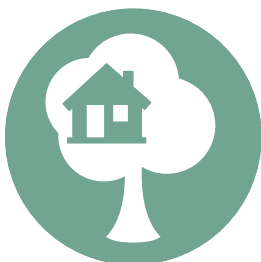
19 The Treehouse