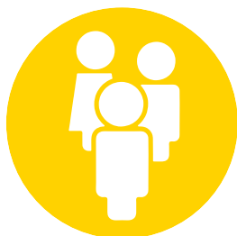
19 Common room