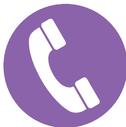
20 Essential contacts