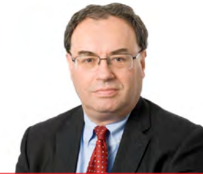
'An Audience with Andrew Bailey'

The Chief Executives' Club hosted the new Governor of the Bank of England for an online address and audience question and answer session.