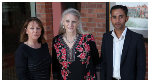
The Annual Mary McAleese Diversity Lecture - 'I've Done My Part: Why Gender Diversity Promotes Prosperity and Peace'