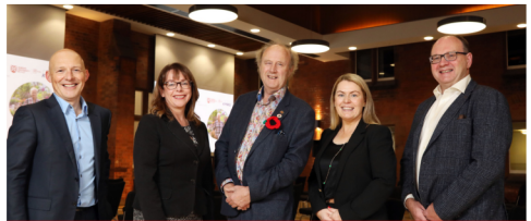
The Annual KPMG Lecture - 'Does Salvation from Climate Change Rely on the Moral Compass of the Corporate World?'