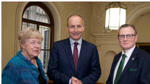
The Chief Executives' Club at Queen's Inaugural Dublin Lecture - Building a Shared Island