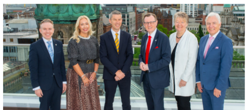
The Annual Chief Executives' Club Breakfast hosted by PwC Belfast