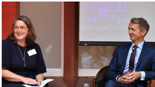
Levelling Up, What, Why, How? - Andy Haldane