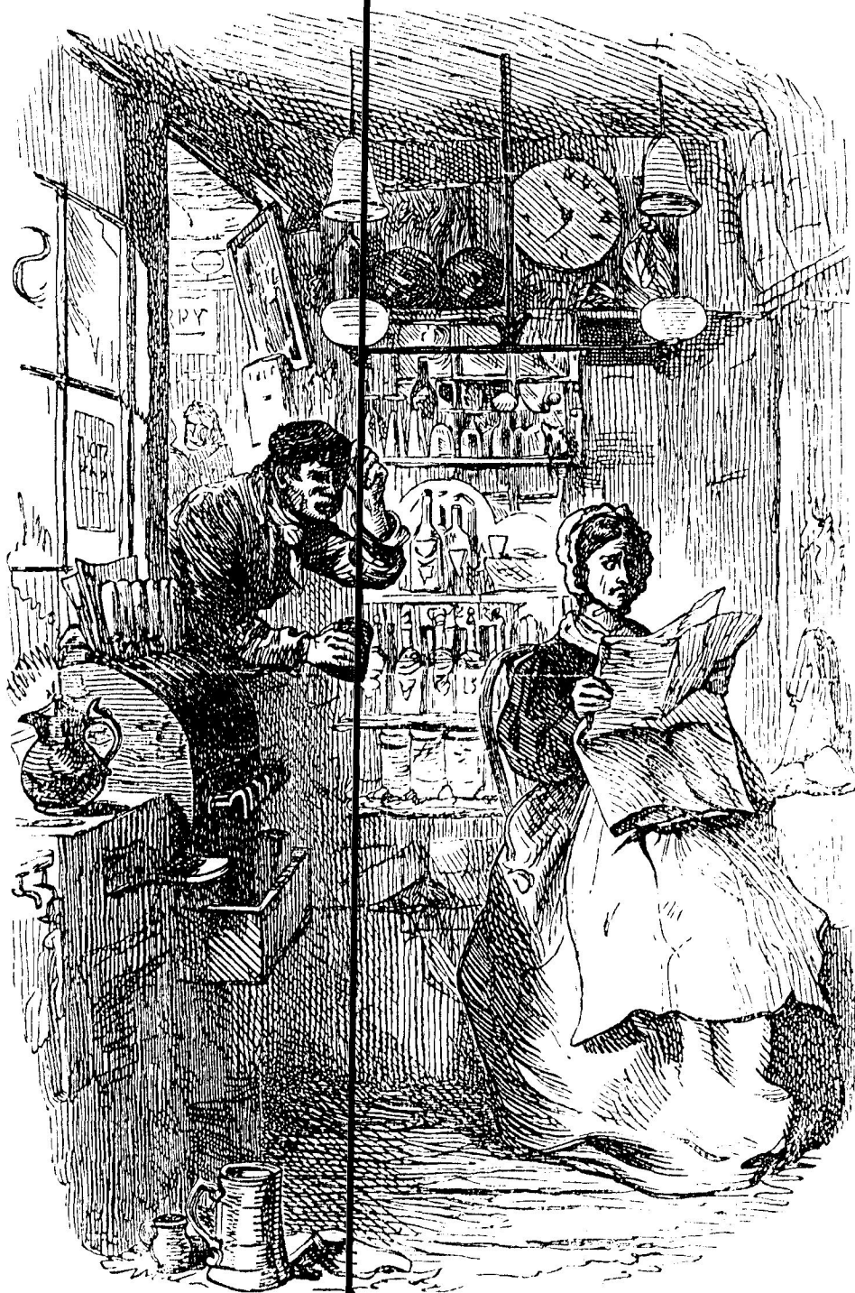
AT THE BAR.—[SEE CHAPTER VI.]