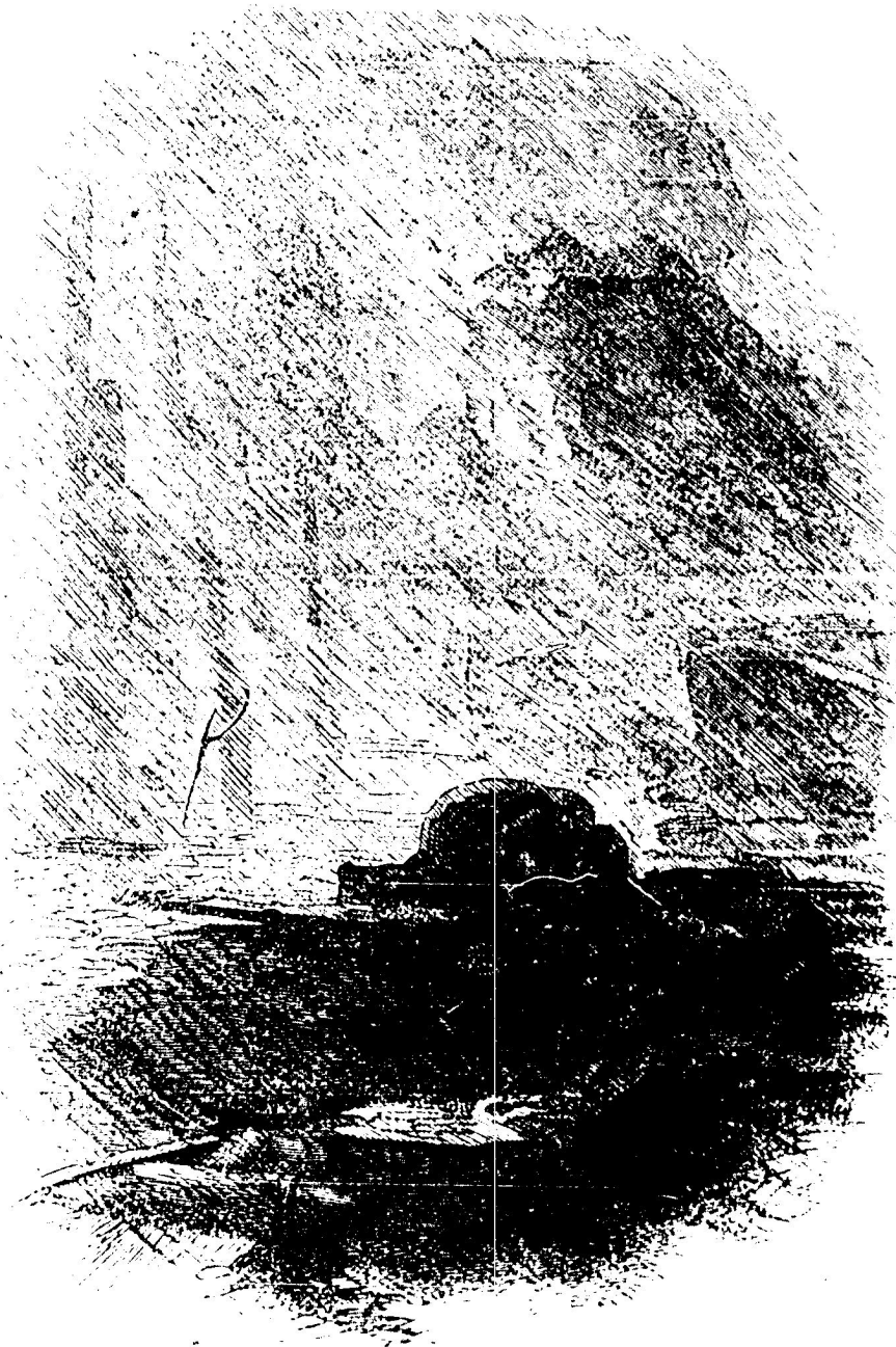
MORE DEAD THAN ALIVE.—[SEE FEBRUARY NUMBER, PAGE 382.]

to harmless, it was to last but a few hours or days, it was to involve in it only the girl so capriciously forced upon him, and upon whom he was so capriciously forced, and it was honestly meant well toward her. For if he had found her unhappy in the prospect of that marriage through her heart inclining to another man or for any other cause, he would seriously have said: "This is another of the old perverted uses of the misery-making money. I will let it go to my and my sister's only protectors and friends." When the snare into which he fell so outstripped his first intention as that he found himself placarded by the police authorities upon the London walls for dead, he confusedly accepted the aid that fell upon him, without considering how firmly it must seem to fix the Boffins in their accession to the fortune. When he saw them, and knew them, and even from his vantage-