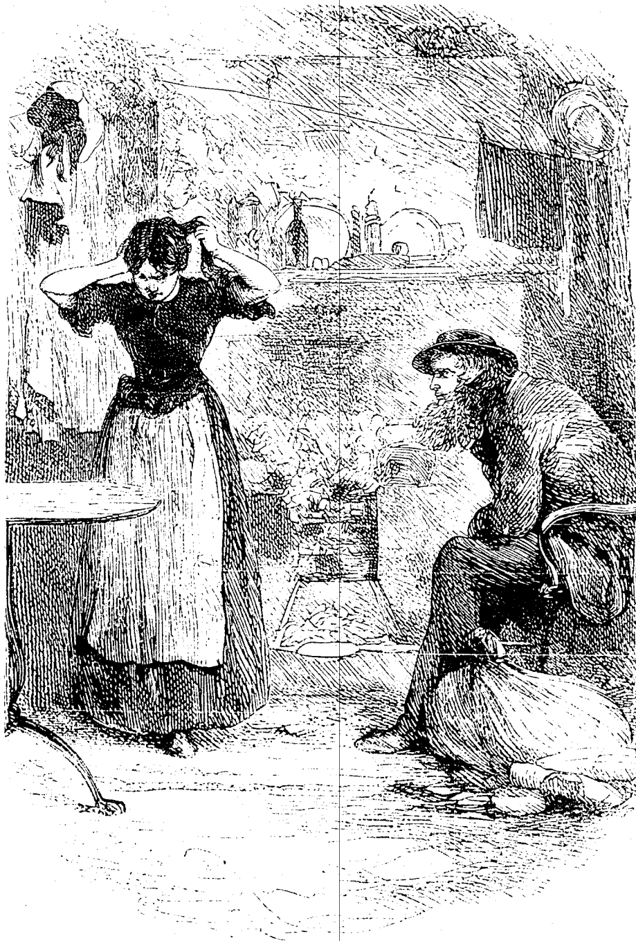
MISS RIDERHOOD AT HOME.—[SEE FEBRUARY NUMBER, PAGE 374.]