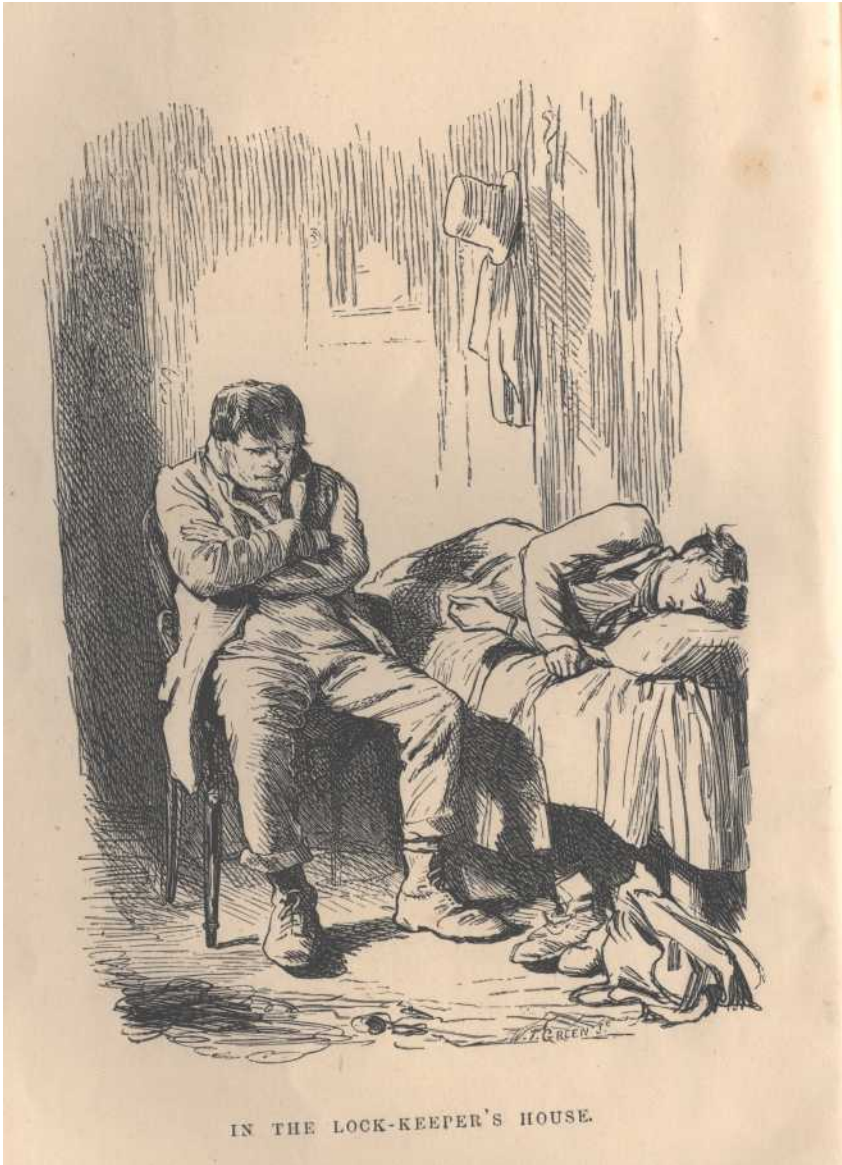
IN THE LOCK-KEEPER'S HOUSE.