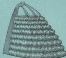
Puffed Horse-hair Jupón (Registered), 25/0, 30/0, and 33/0, in Grey White, 5/0 extra.