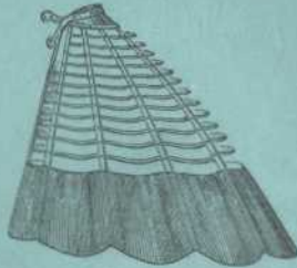
The Ondina, or Waved Jupón, 18/6 and 21/0; Muslin Covers, 3/6 each; French Llama, 5/11 each.

The Sansflectum Jupón is a most graceful Crinoline, admirably adapted for the promenade.— Court Journal . * The Patent Ondina, or Waved Jupón, does away with the unsightly results of the ordinary hoops; and so perfect are the wave-like bands, that a lady may ascend a steep stair, lean against a table, throw herself into an arm-chair, pass to her stall at the Opera, or occupy a fourth seat in a carriage, without inconvenience to herself or others, or provoking the rude remarks of the observers—thus modifying, in an important degree, all those peculiarities tending to destroy the modesty of Englishwomen; and, lastly, it allows the dress to fall into graceful folds.— Lady's Newspaper .