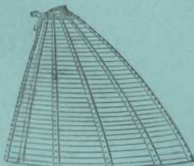
The Sansflectum Jupón, 10/6, 15/6, 18/6, and 21/0; Muslin Covers, 3/6; Llama or Alpaca, 5/11.