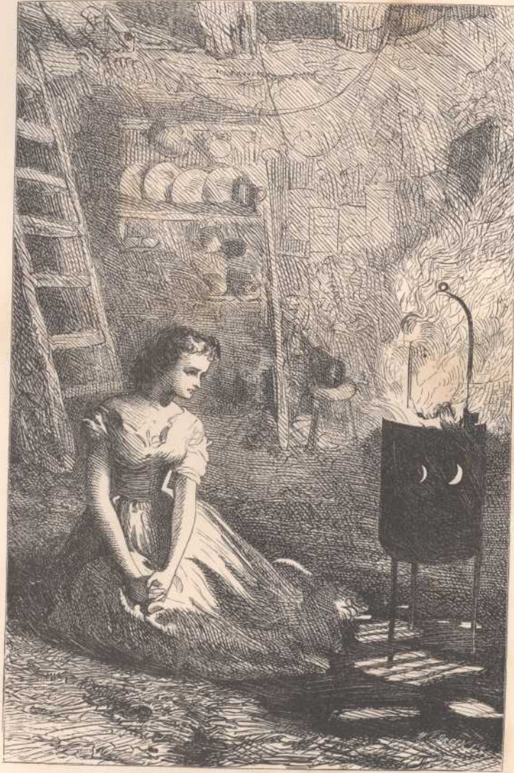
WAITING FOR FATHER.