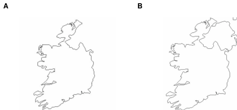
Figure 1: Ireland as state, Ireland as island

Yet at the same time, at all levels of southern Irish society, notions of territorial reunification have been consciously and more importantly unconsciously recycled. It is this unconscious recycling that is interesting. The hegemonic map-image used in the 26-county state serves to elide the political partition of the island. Map-image "A" in figure 2 is the map-image of the Ireland the state; it is hardly ever used and it jars the sensibilities of even the most ardent 26-county nationalists. This contrasts with the practice of Scottish, Welsh even Northern Irish nationalists of symbolising their "homeland" as disembodied from the territory of adjacent political entities.