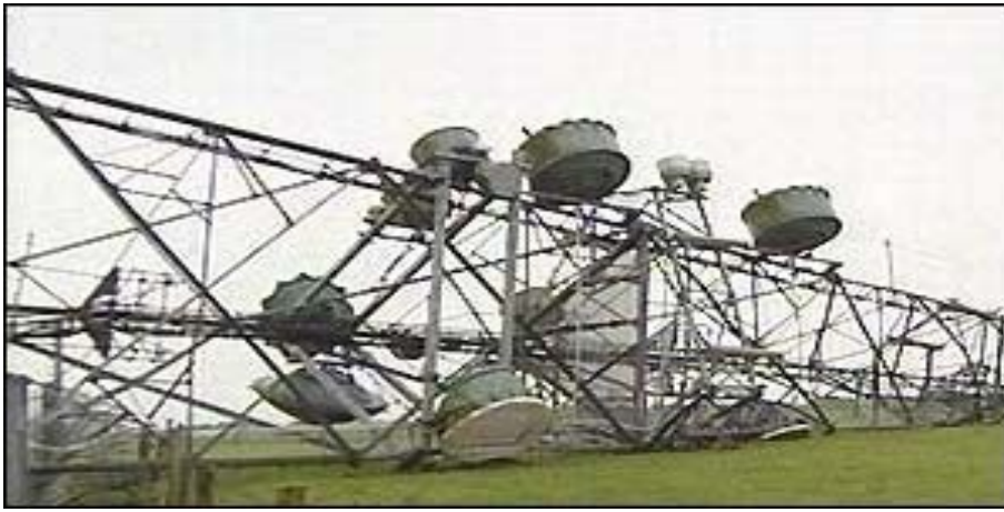
Cranlome Telecommunications Mast: felled in December 2002

In 1989, a 150 foot-high telecommunications mast was erected in the Upper Cranlome Road area of Ballygawley, County Tyrone, as part of a radiocommunications network for Northern Ireland Electricity engineers. Since then, the mast has hosted some thirty-five transmitters for operators including the Water Service and the Northern Ireland Ambulance Service, as well as several mobile phone companies. In December 2002, the structure was felled. The story was covered extensively by Northern Ireland media, making the front page of the Belfast Telegraph in late December, with reports appearing in many newspapers including the Daily Telegraph and the Newsletter, as well as in several local television broadcasts. People living near the telecommunications mast were reported (Belfast Telegraph 17/12/02, See Appendix 1) to believe it to be responsible for an alleged cluster of cancer cases in the area.