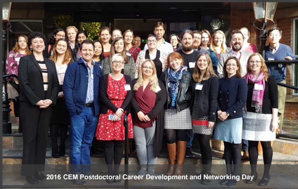
2016 CEM Postdoctoral Career Development and Networking Day