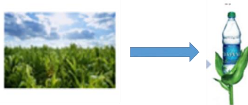
Figure 2: Container produced from waste food stock

This project will involve a collaboration with an international company who manufacture the resin and the successful candidate will be expected to travel to the company and spend a short secondment as part of the research.