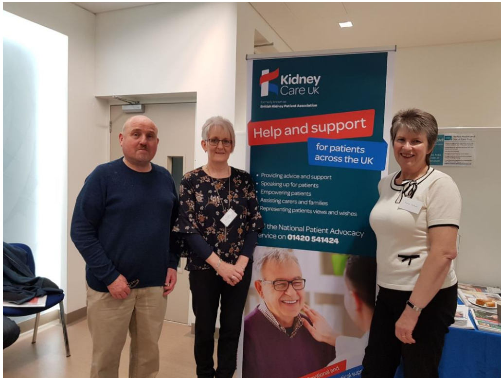
Members of the Northern Ireland Kidney Patient Association