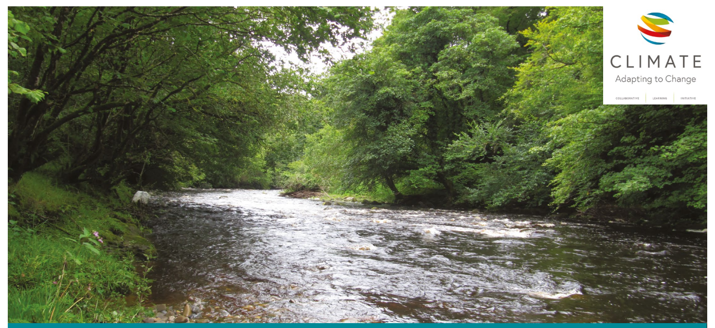
The River Faughan, in Derry-Londonderry is susceptible to intense flooding and the effects of climate change.