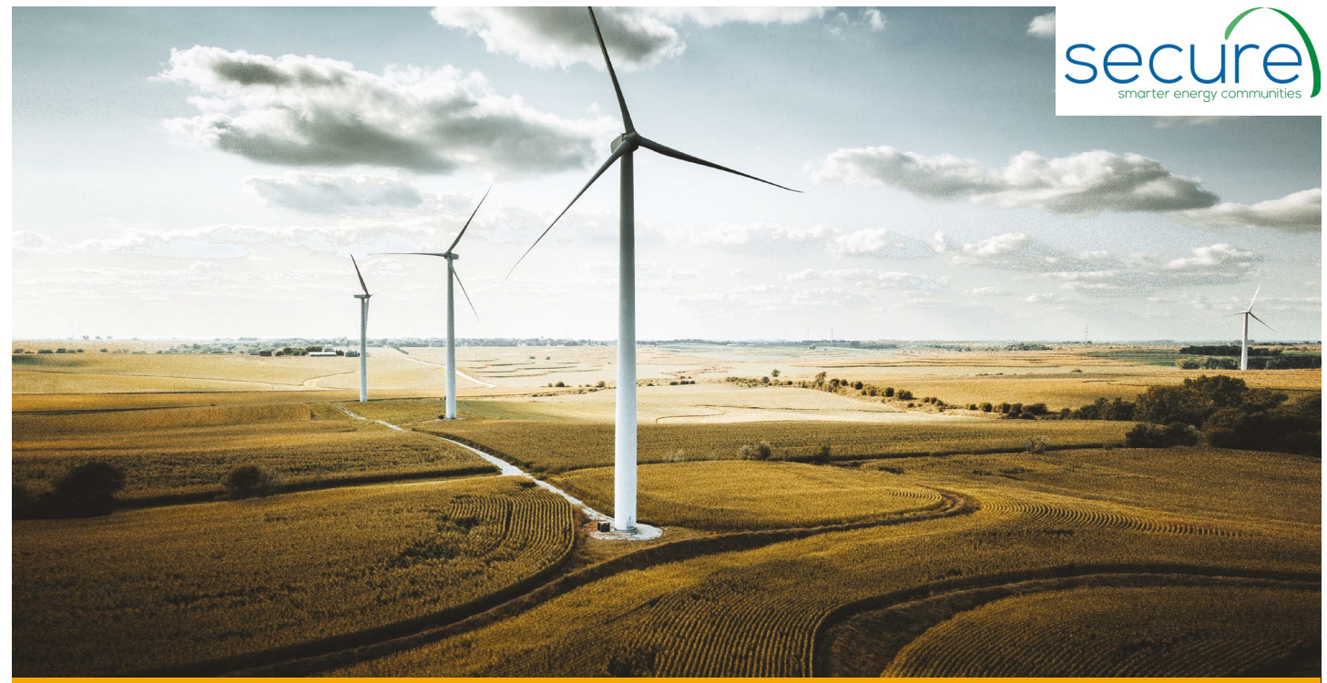
SECURE aims to foster energy-secure communities through the promotion of energy efficiency solutions.