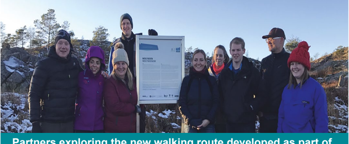
Partners exploring the new walking route developed as part of the Transnational Visitor Trail at GURSLI Mines, Magma UNESCO Global Geopark Norway.