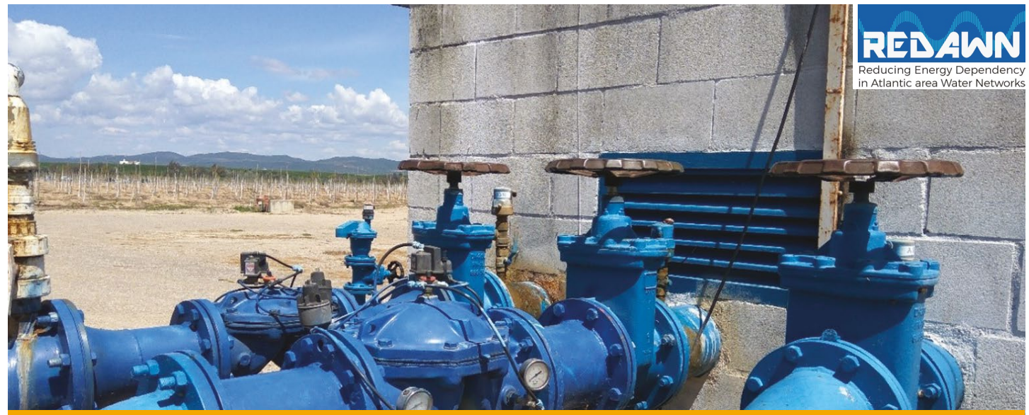
Site of demonstration micro-hydro power plant in the irrigation sector, Genil River irrigation district, located in the Guadalquivir river basin, Andalucia, Spain.