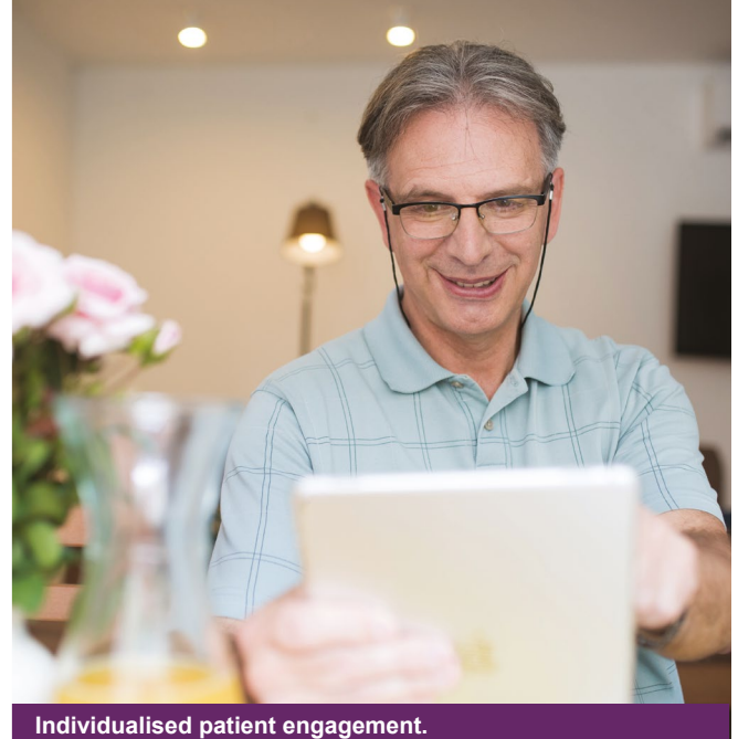
Example of the physician avatar. Individualised p