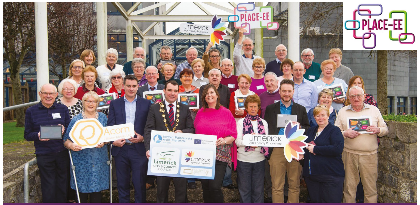
PLACE-EE participants in Limerick attending the launch of the Acorn tablet, which is part of an age friendly programme for local citizens.