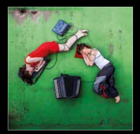
Ministerium für Familie, Kinder, Jugend, Kultur und Sport des Landes Nordrhein-Westfalen

Free, but tickets must be booked in advance via Eventbrite. This concert is co-promoted by Moving On Music. Tickets are available via their website at www.movingonmusic.com