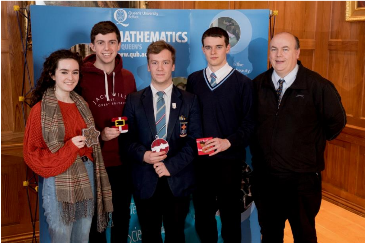
St Patrick's Academy