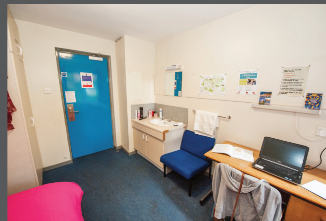
Standard Room Elms Village