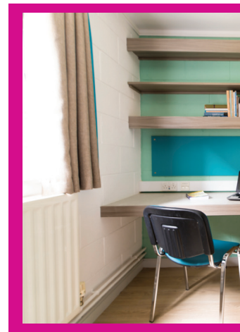
Premium En Suite Elms Village