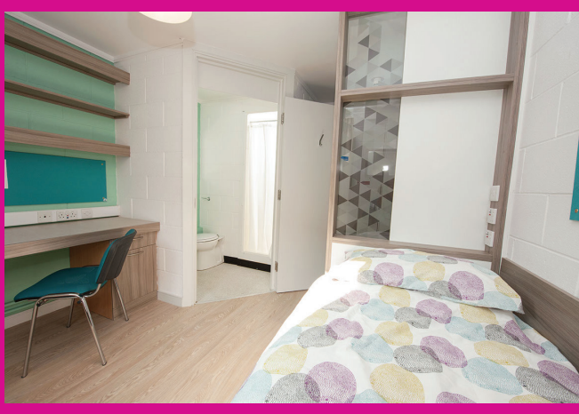
En Suite Standard Elms Village