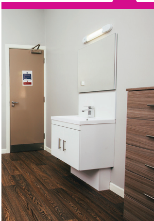
Premium Standard Queen's House