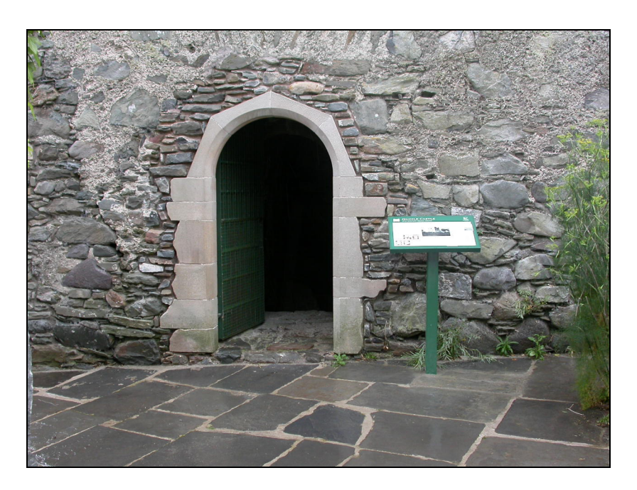
Plate 1: Newly installed information board beside castle door.