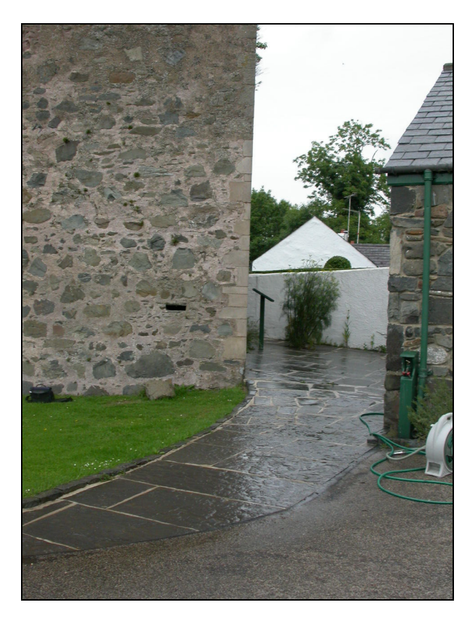
Plate 2: Flag-stone path leading to front of castle.