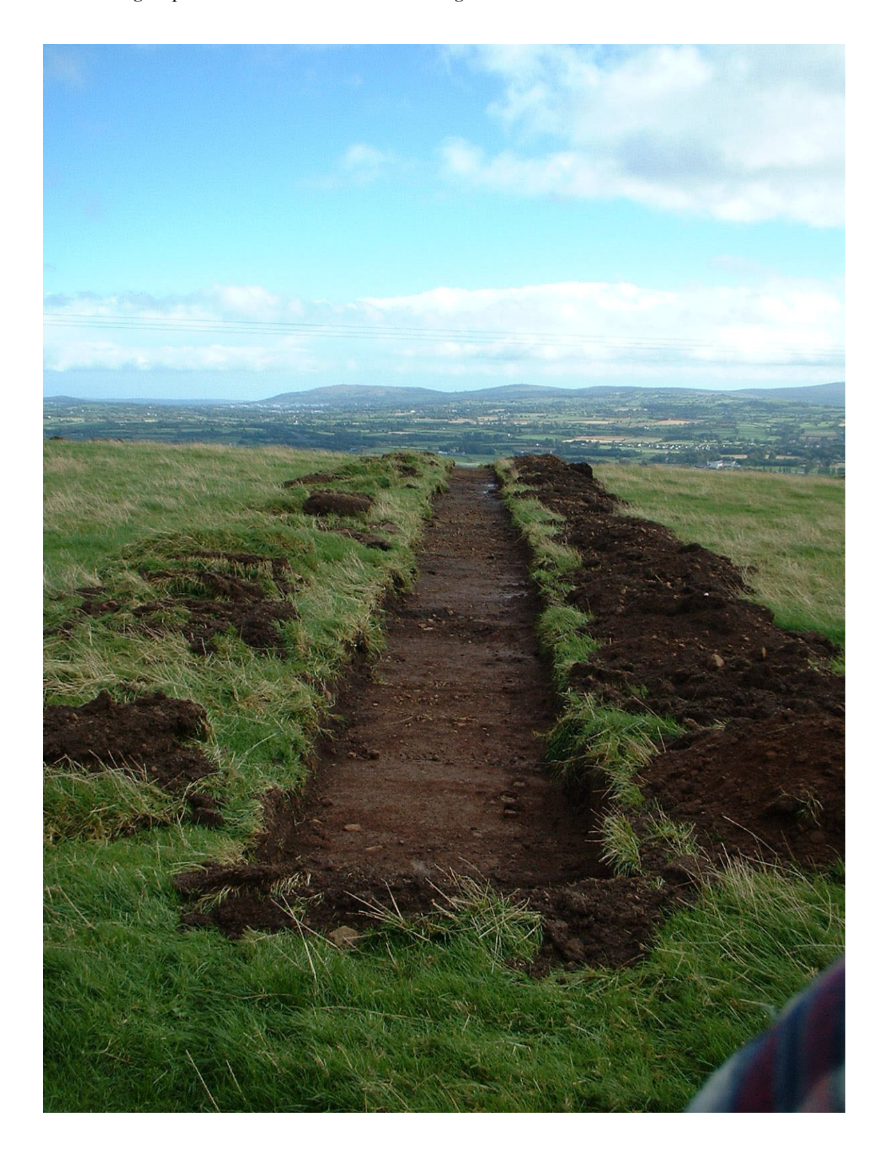
Photo3: Trench 3 after excavation