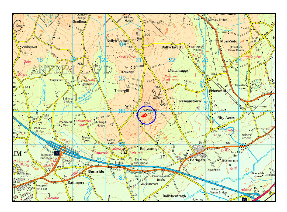
Figure 1: Location of site showing proximity to Donegore Hill