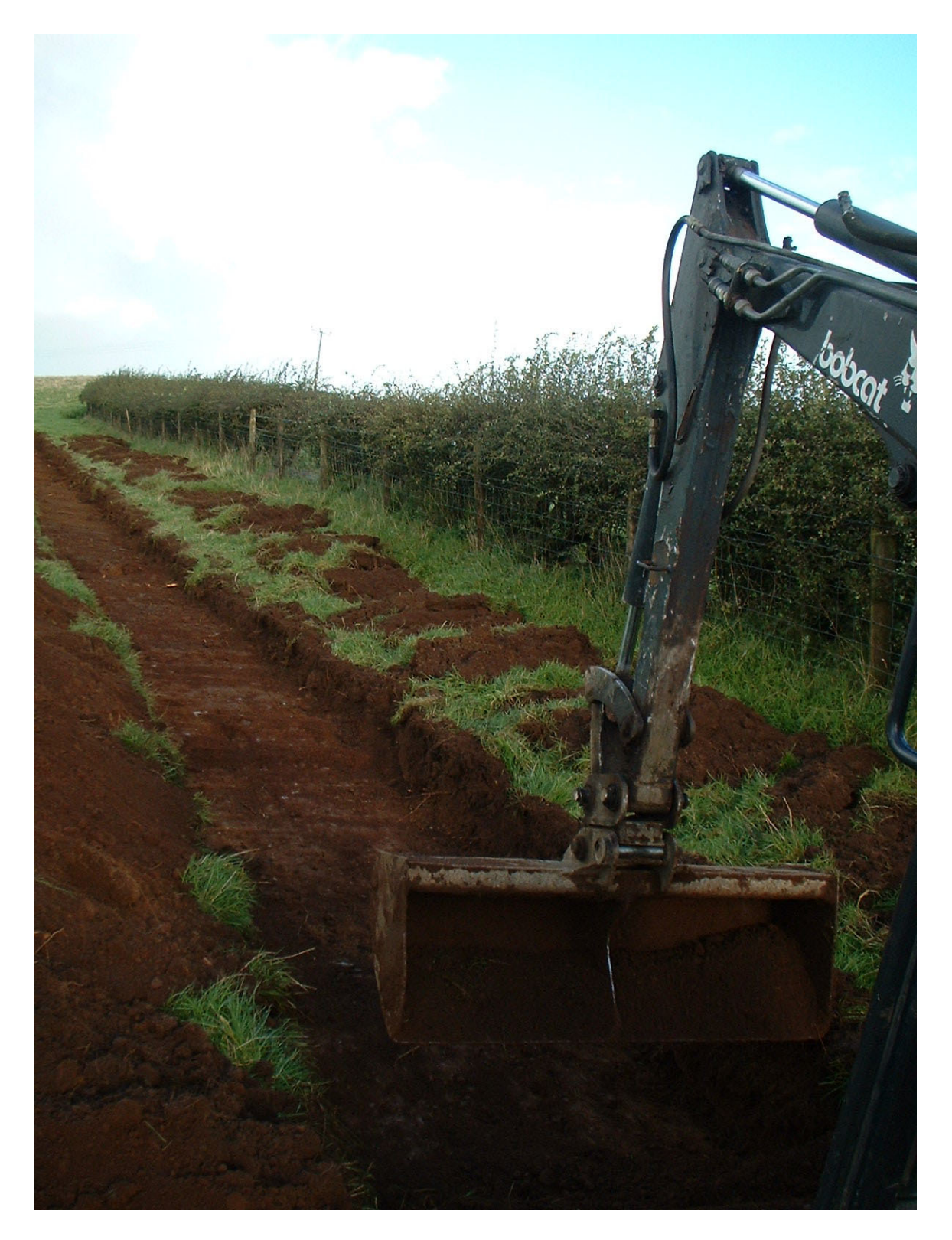
Photo 6: Excavation of Trench 5 showing utilization of toothless "sheugh" bucket