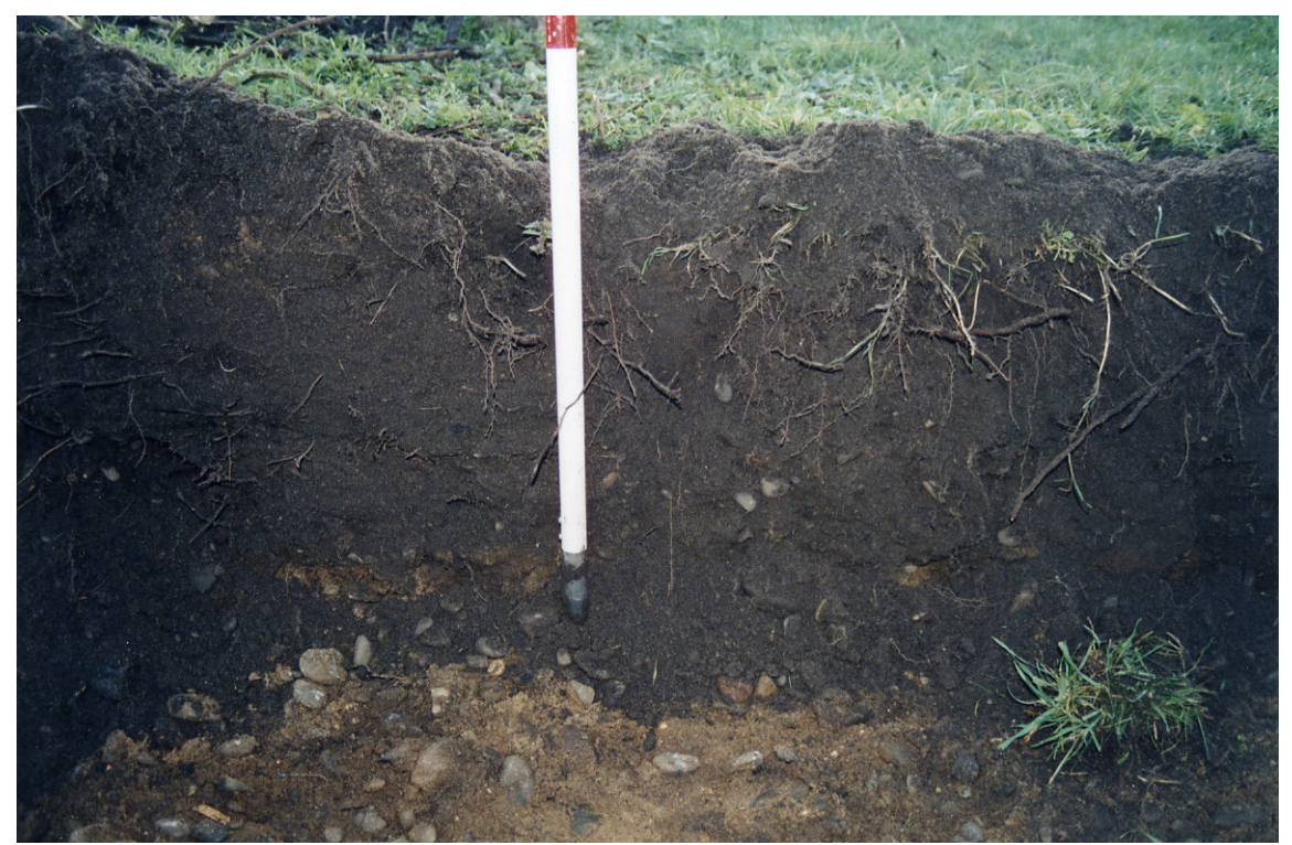
Plate 3 Trench 1 section