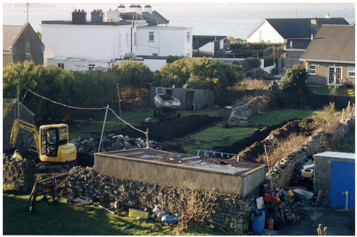
Plate 1: General view of site from top of motte (DOW 057:001)