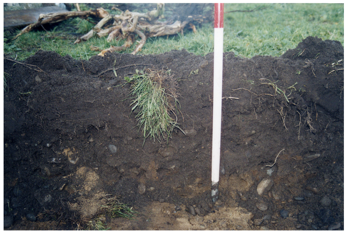
Plate 5: Trench 2 section