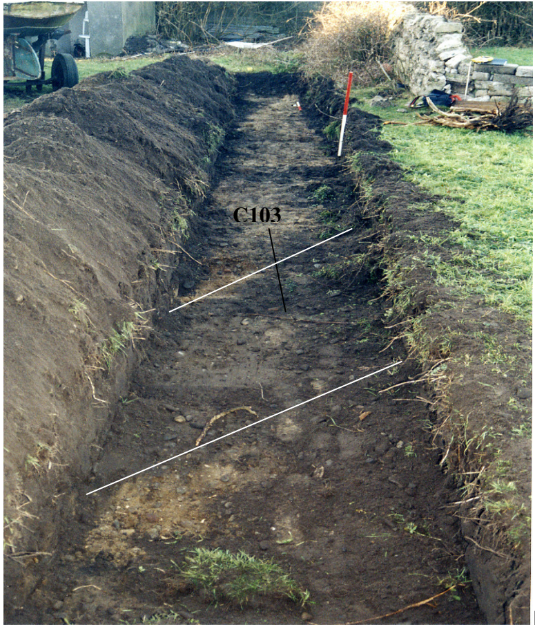
with linear feature C103 in the foreground.