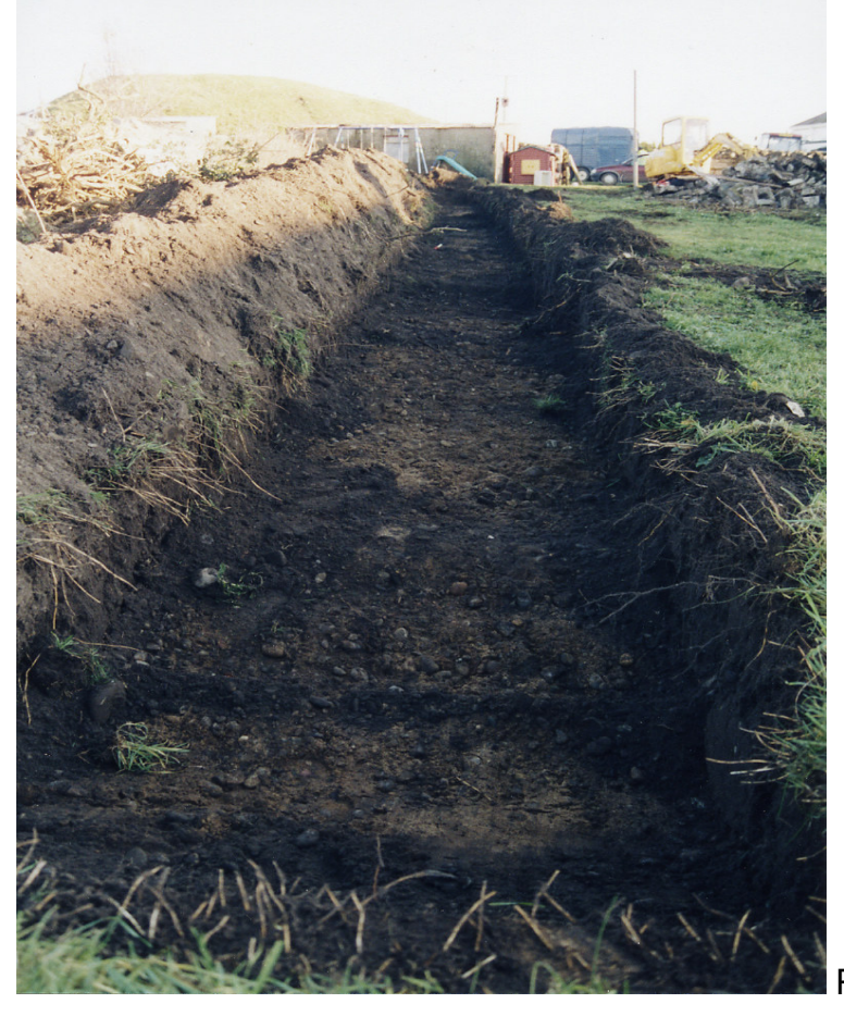
Plate 2: Trench 1 from west