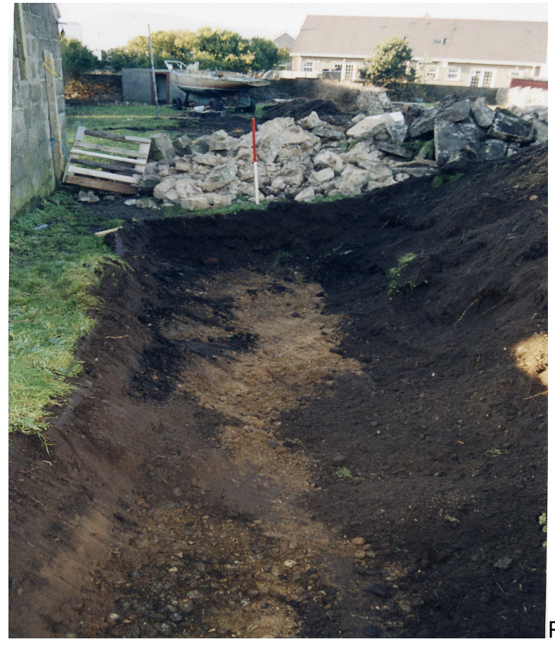
Plate 6: Trench 3 from east