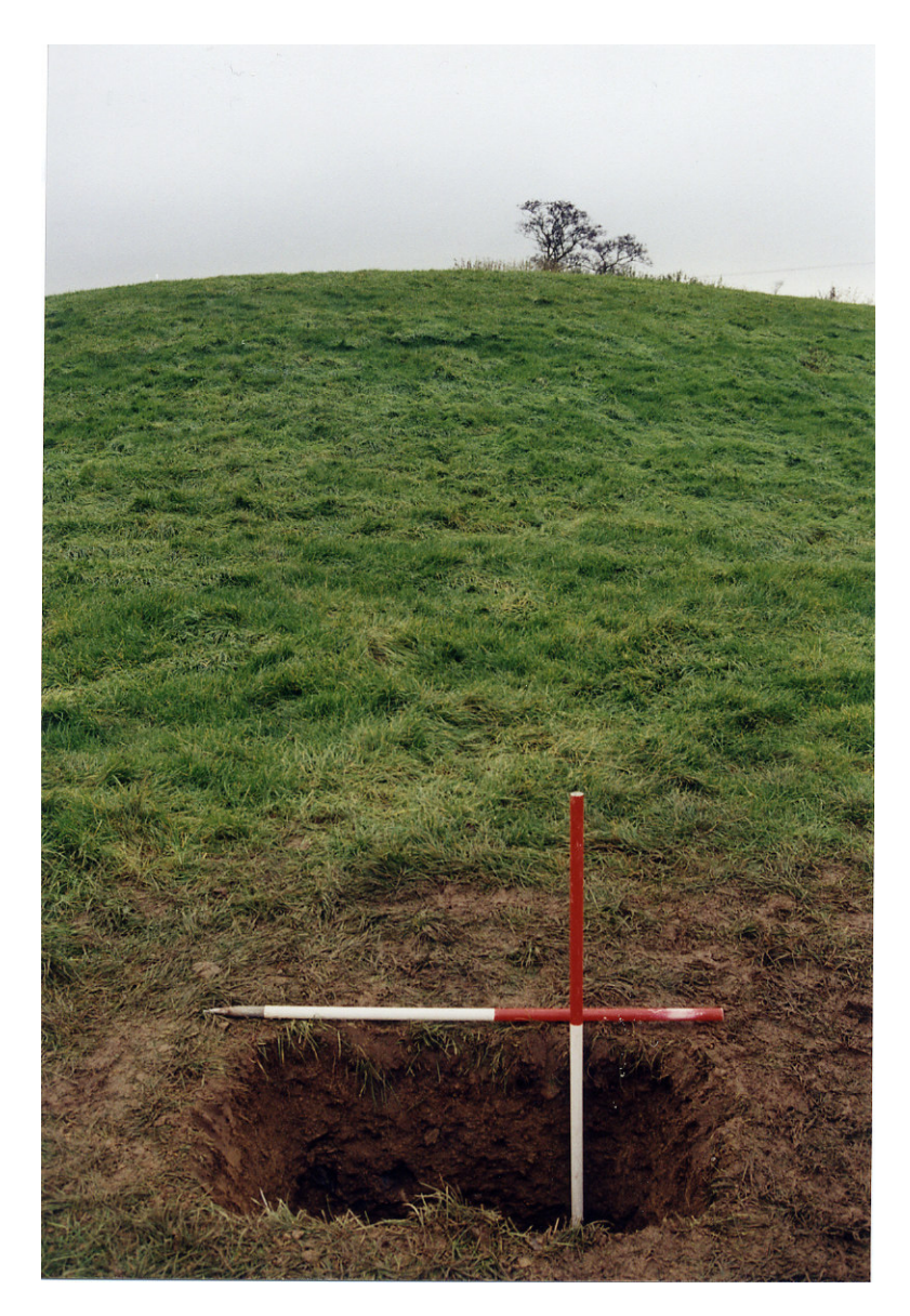
Plate 3: Post-excavation view of Trench A from the southwest, with Phil's Fort in the background.