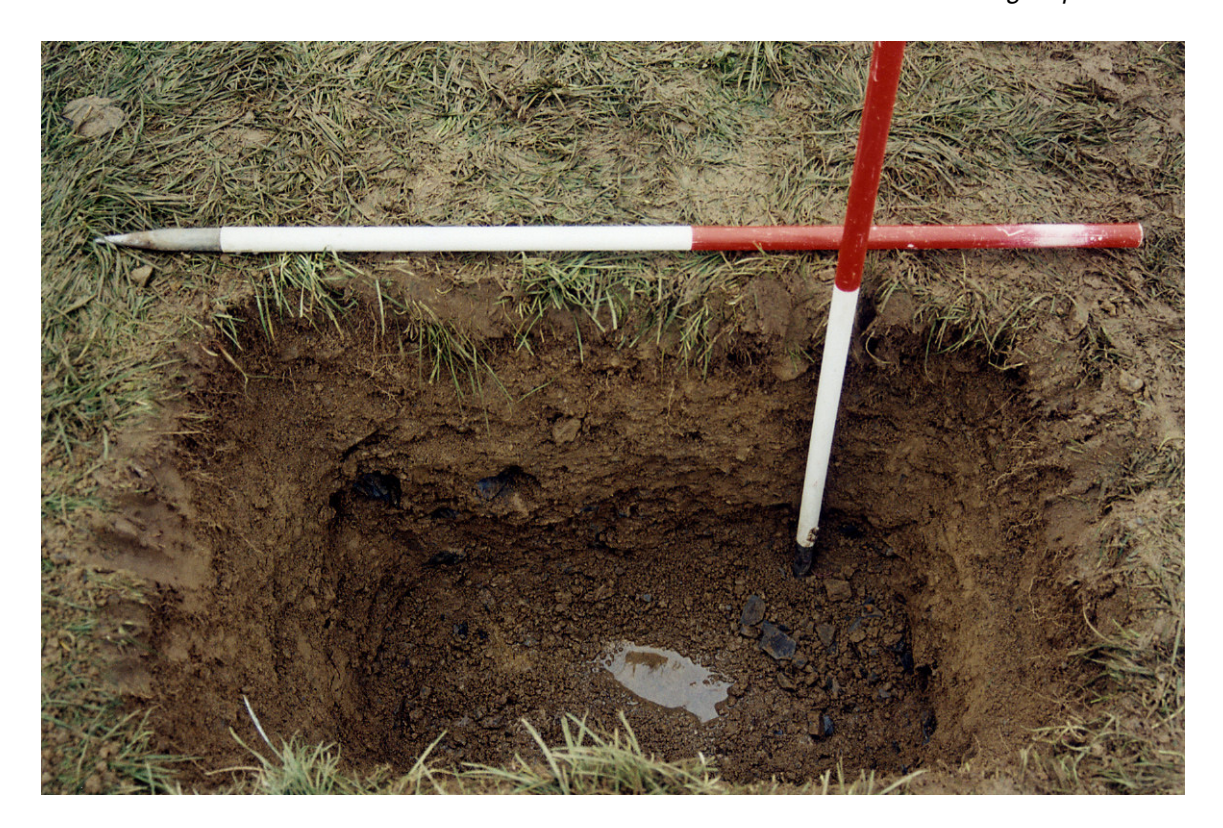
Plate 5: Post-excavation view of Trench A.