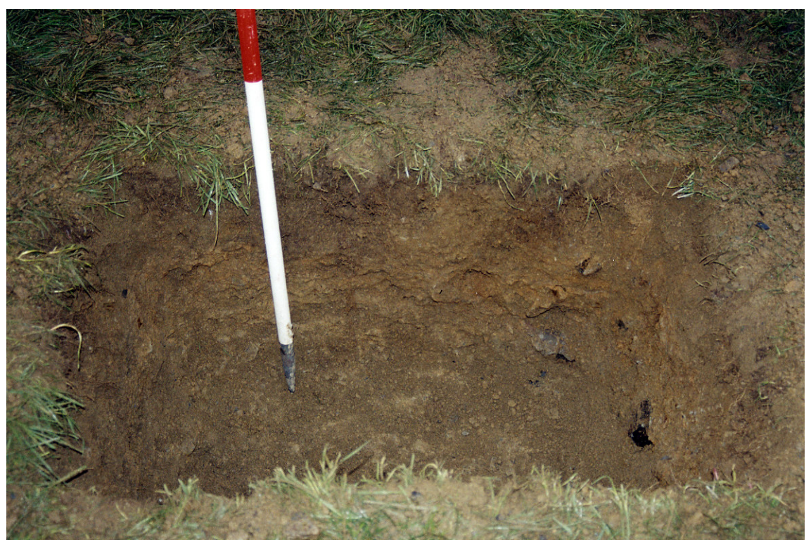
Plate 6: Post-excavation view of Trench B.