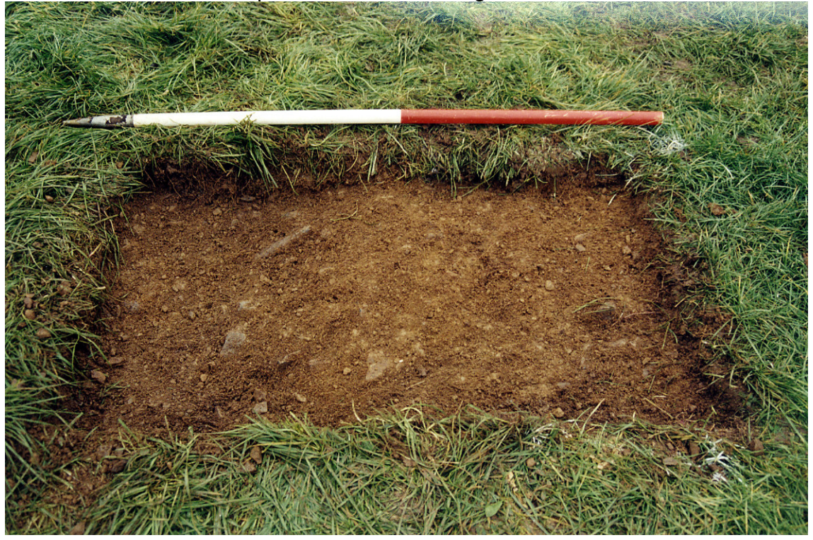
Plate 2: Trench B after topsoil removal, showing surface of C102.