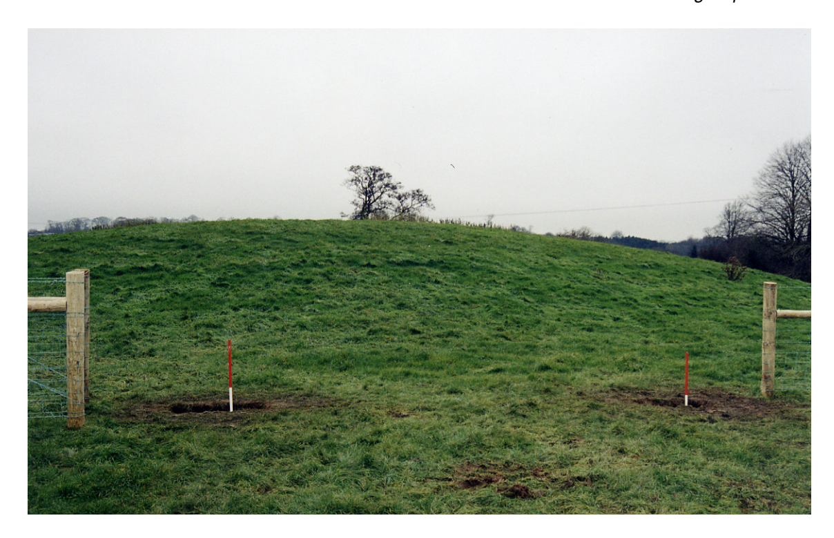
Plate 7: Post-excavation view of Trenches A and B from the southwest, with Phil's Fort in the background.