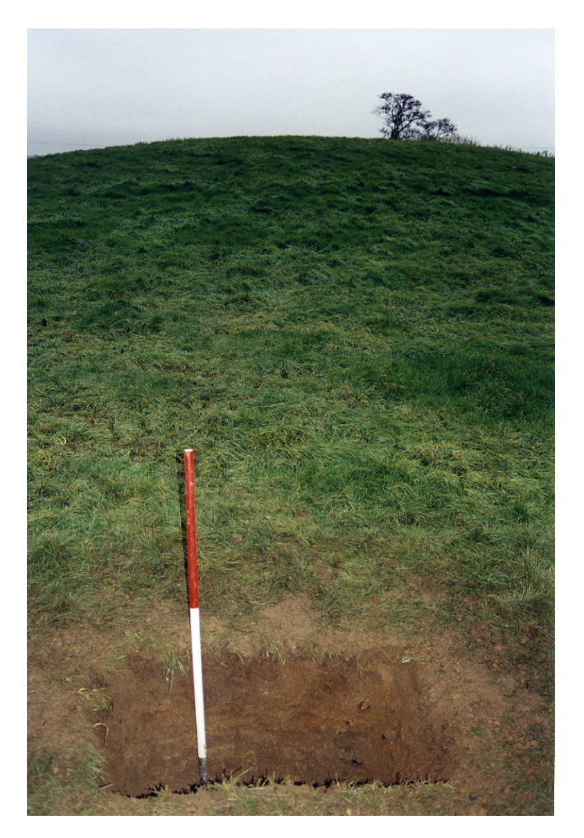
Plate 4: Post-excavation view of Trench B from the southwest, with Phil's Fort in the background.