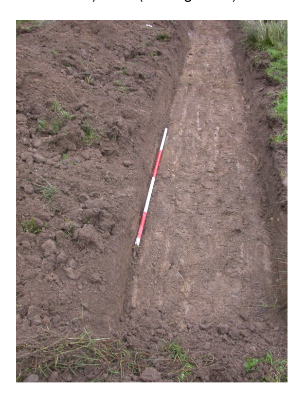
Plate Four: General view of Trench Three, following excavation to subsoil (Context No. 303) level (looking north)