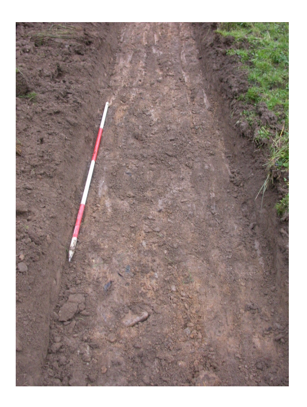
Plate Three: General view of Trench Two following excavation to subsoil (Context No. 203) level (looking north)