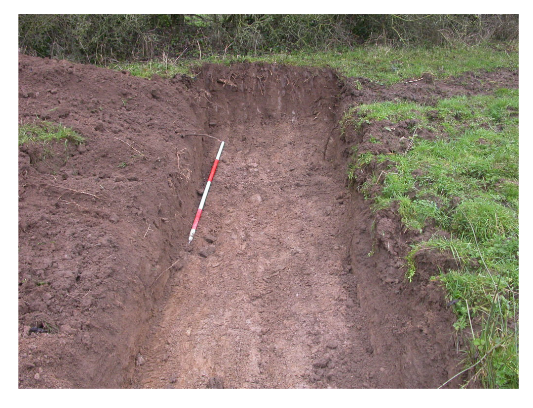
Plate Two: General shot of Trench One, following excavation to subsoil (Context No. 104) level (looking north)