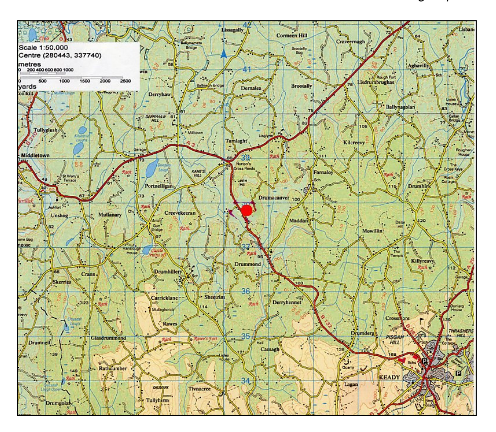
Figure One: Map showing location of site (red dot)