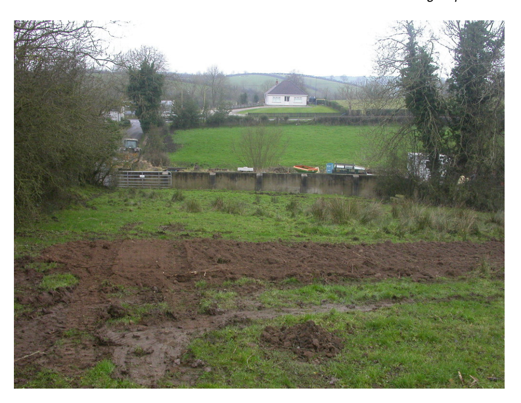
Plate One: General view of site (looking south-west)