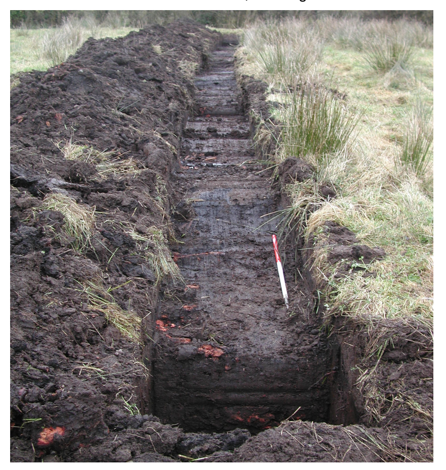
Plate 6: View of Trench C from west after excavation.