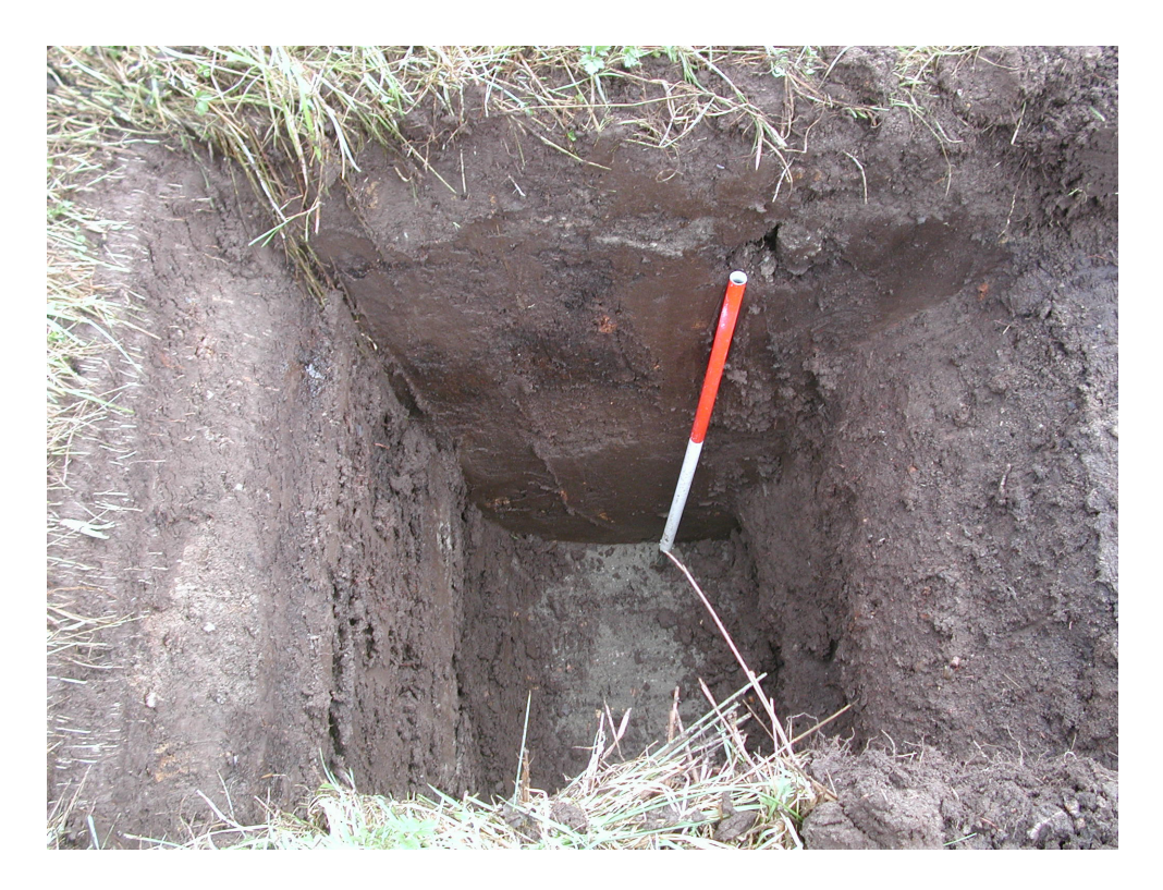
Plate 7: View of section in Trench C, showing C103 and surface of subsoil (C104).