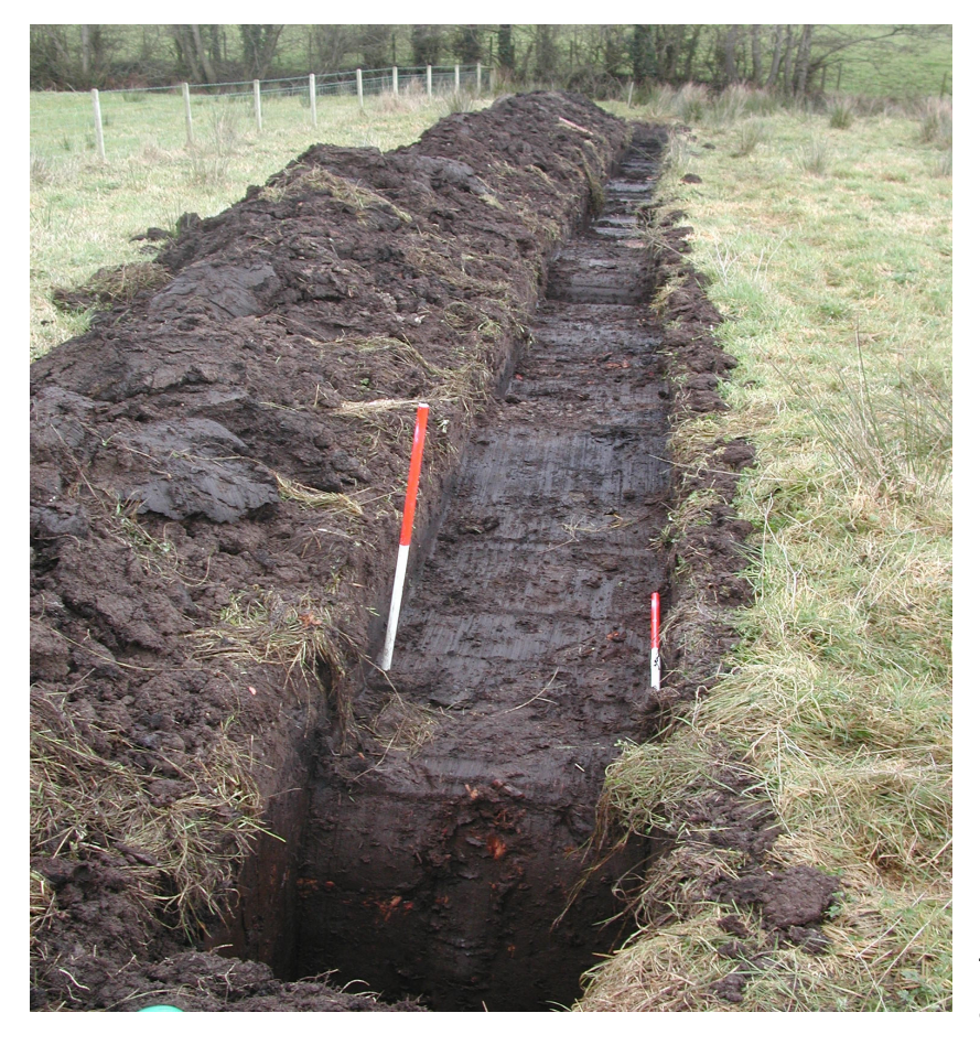
Plate 2: View of Trench A from east, after excavation.