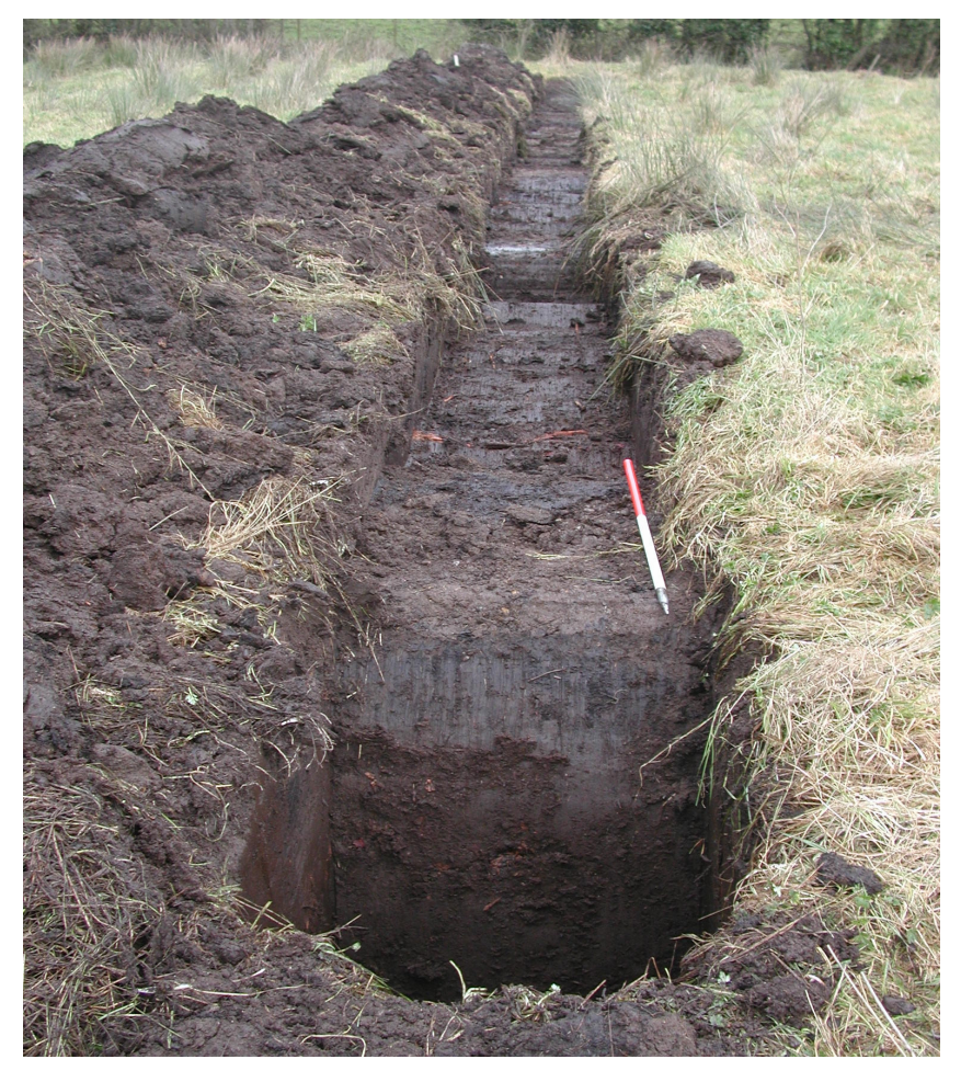
Plate 4: View of Trench B from east, after excavation.