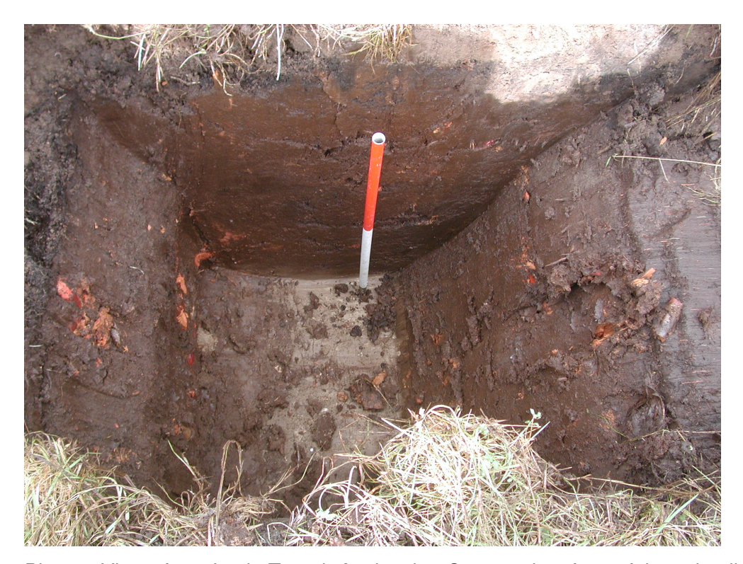
Plate 3: View of section in Trench A, showing C103 and surface of the subsoil (C104).