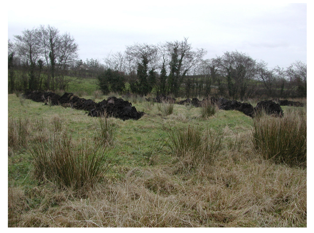
Plate 1: Overall view of site from north-west.