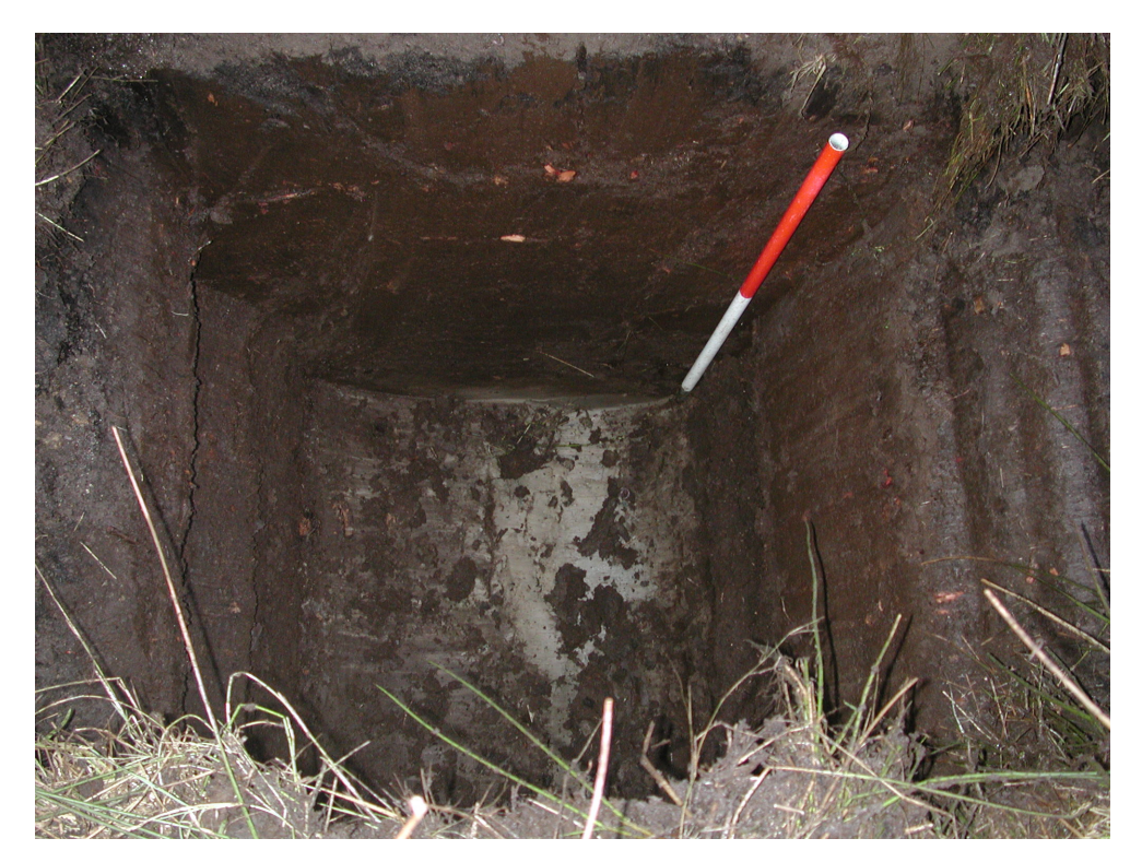
Plate 5: View of section in Trench B, showing C103 and surface of subsoil (C104).