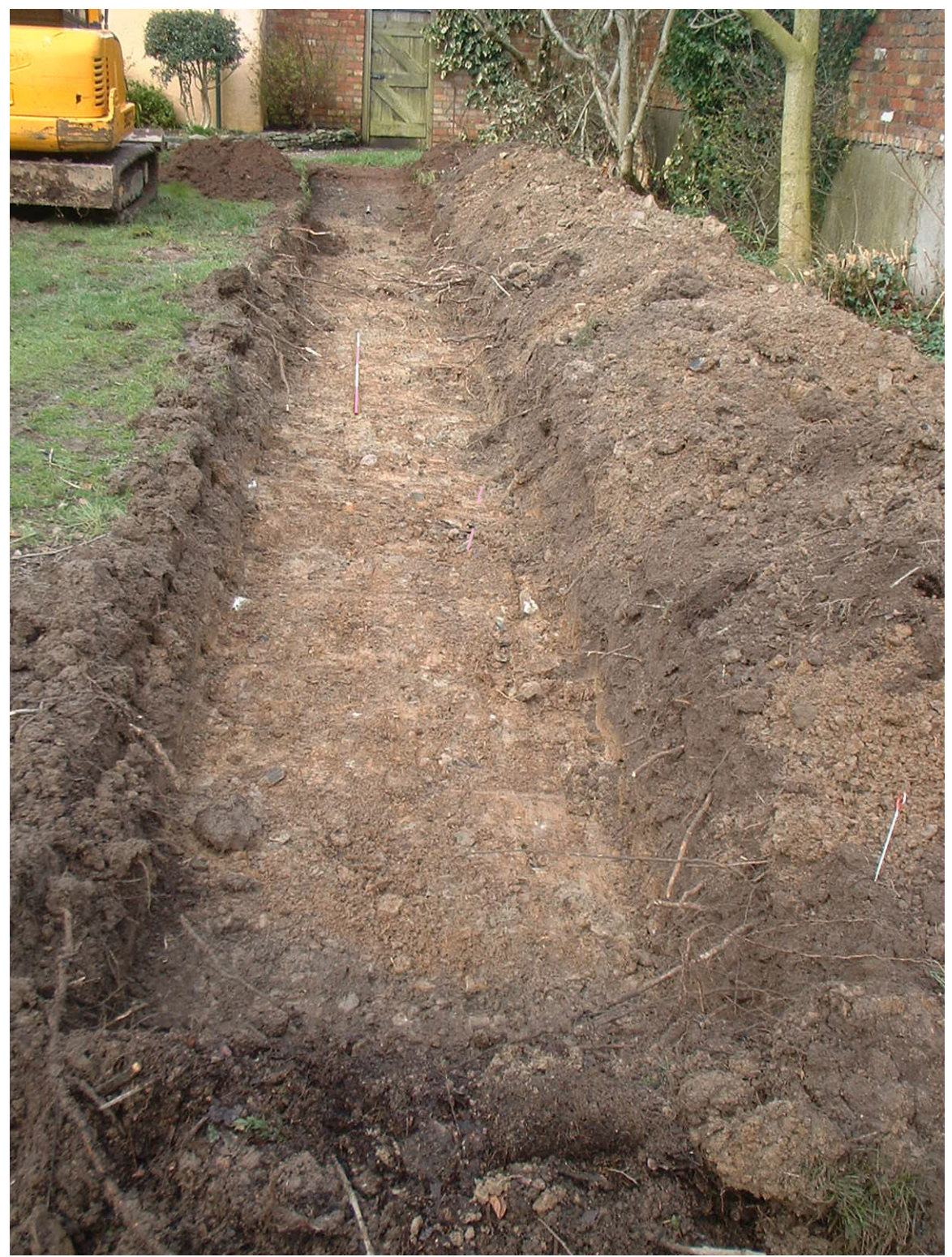
Photo 2: Trench 1 after excavation showing surface of subsoil (102).