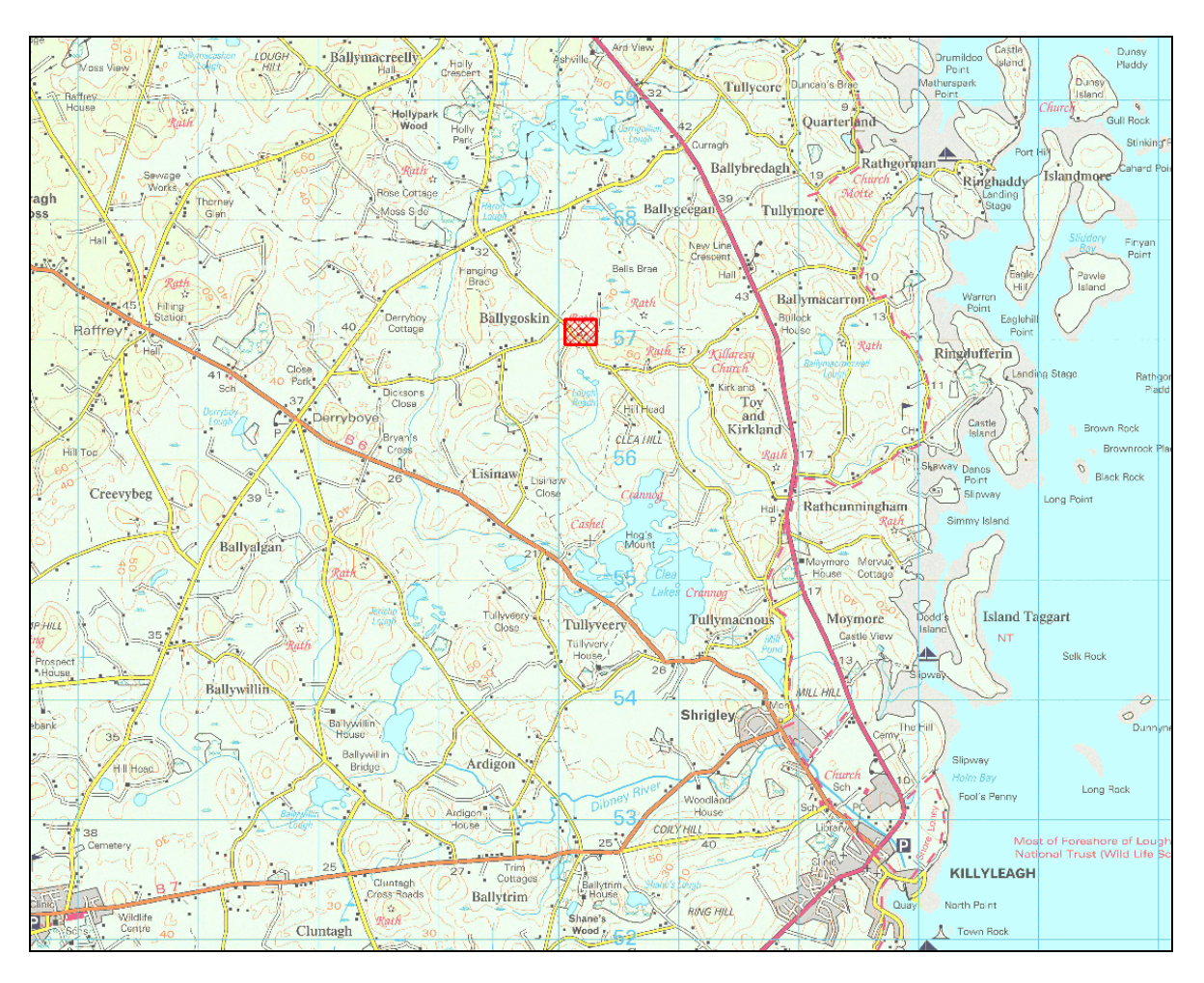
Figure 1: Location of site.