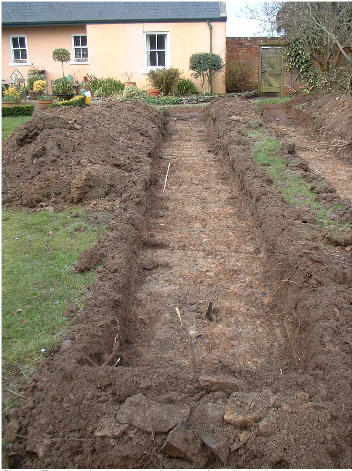
Photo 3: Trench 2 after excavation showing surface of subsoil (202).