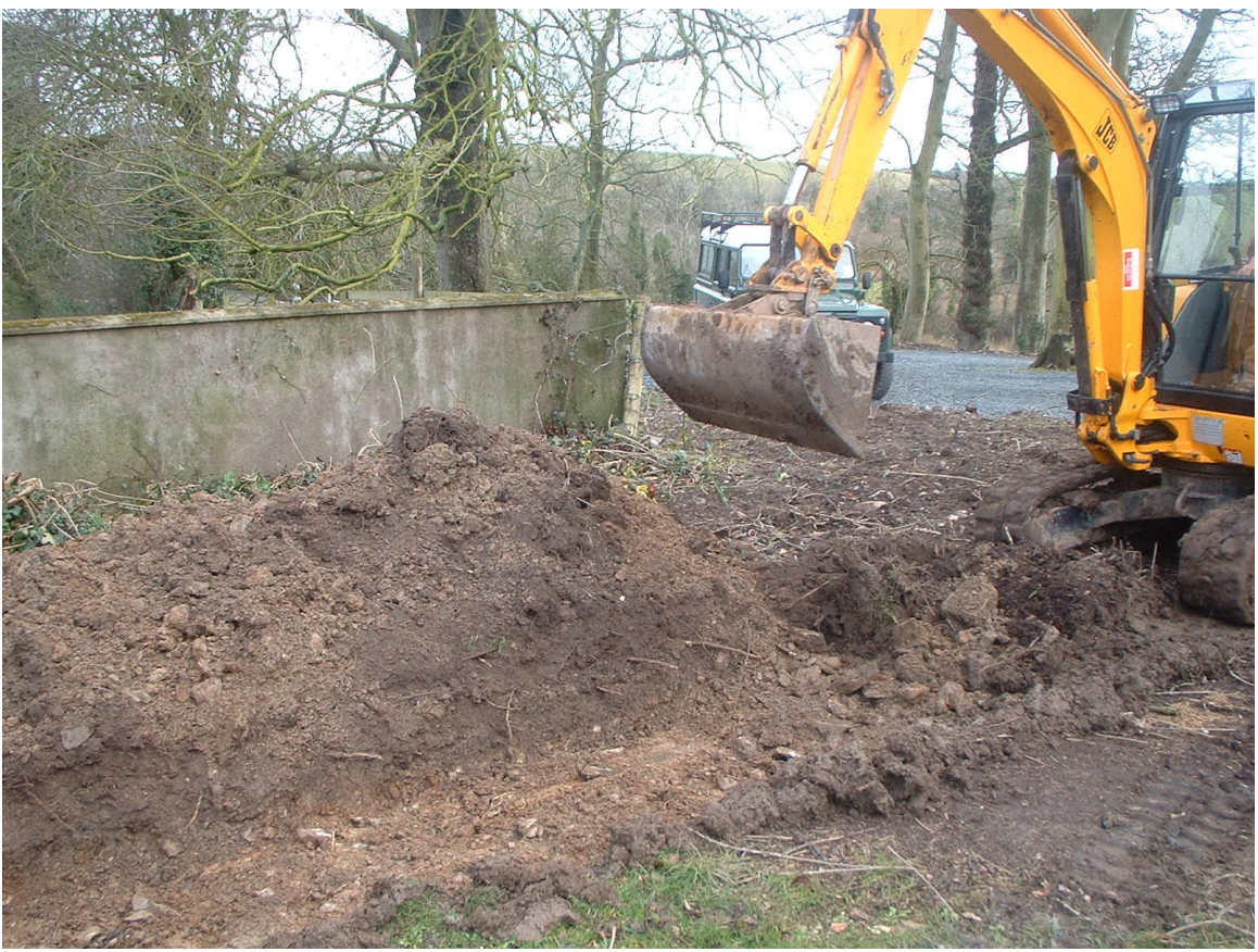
Photo 1: Excavation of Tr. 1 showing utilization of toothless "sheugh" bucket.