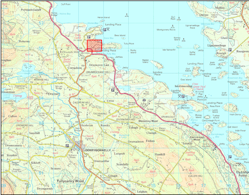
Figure 1: Location of site