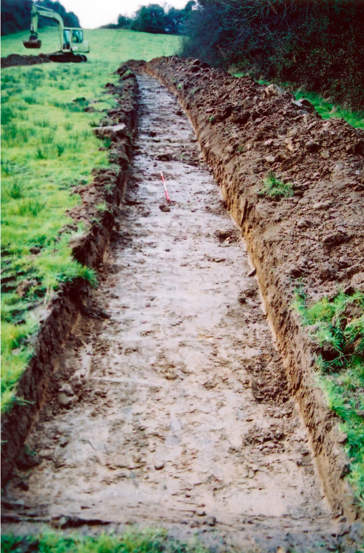
Photo 3: Trench 2 after excavation showing surface of subsoil (Context 202).