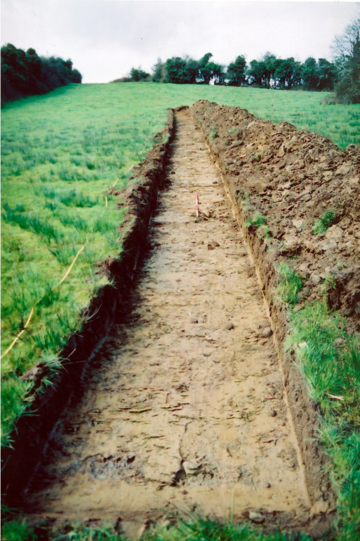
Photo 2: Trench 1 after excavation showing surface of subsoil (Context 102).