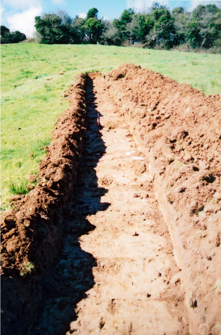
Photo 4: Trench 3 after excavation showing surface of subsoil (Context 302).