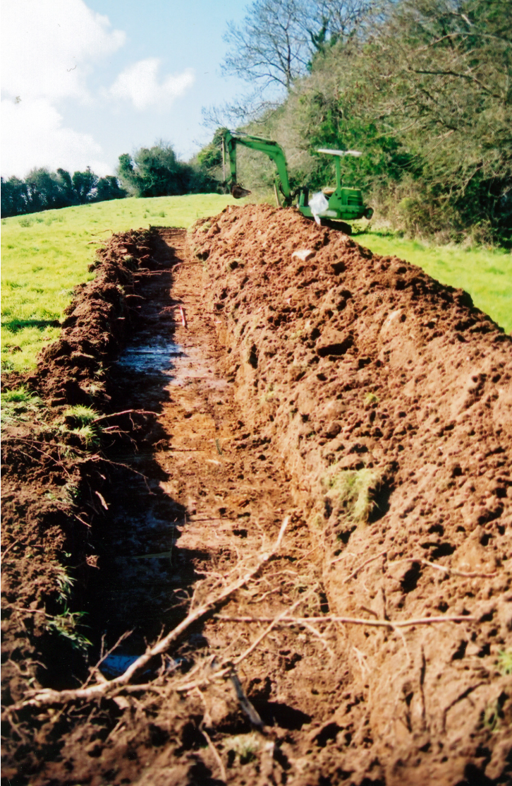
Photo 6: Trench 5 after excavation showing surface of subsoil (Context 502).