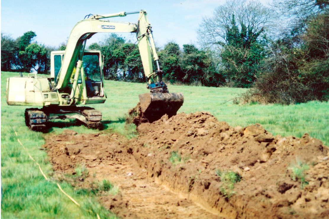
Photo 1: Excavation of Tr. 1 showing utilization of toothless "sheugh" bucket.