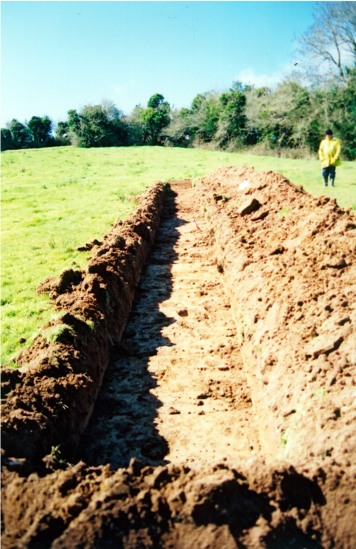
Photo 5: Trench 4 after excavation showing surface of subsoil (Context 402).