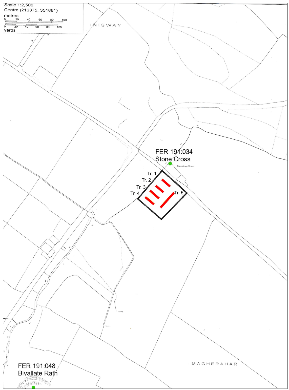
Figure 3: Plan of development site showing location of excavated evaluation trenches and recorded location of SMR FER 191:034