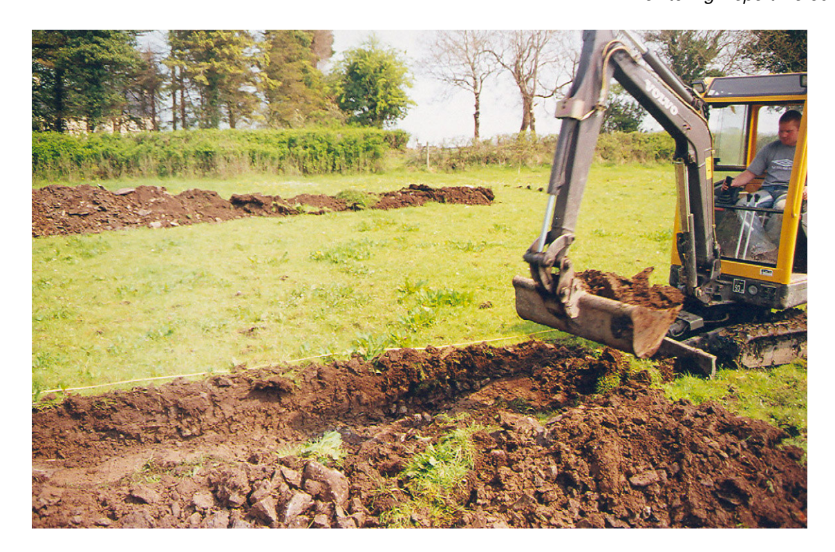
Photo 1: Excavation of trench showing utilization of toothless "sheugh" bucket.