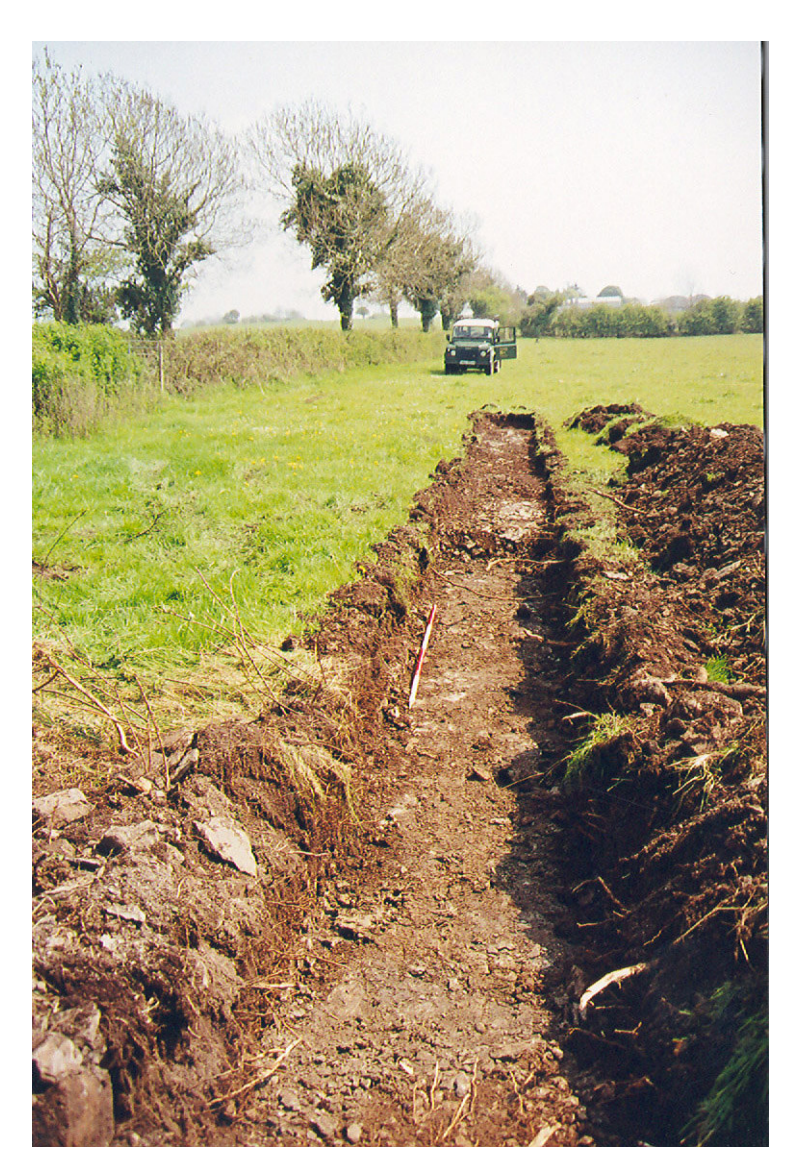
Photo 2: Trench 1 looking southeast after excavation showing surface of bedrock (Context 102).