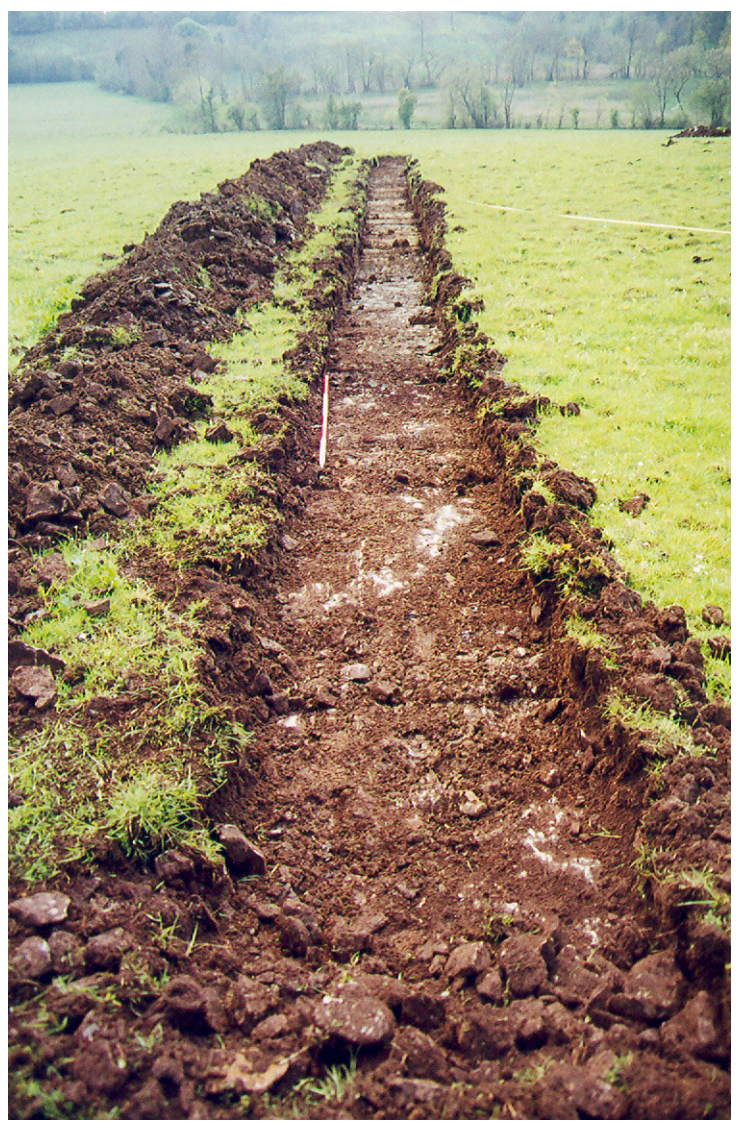
Photo 6: Trench 5 looking southwest after excavation showing surface of bedrock (Context 502).