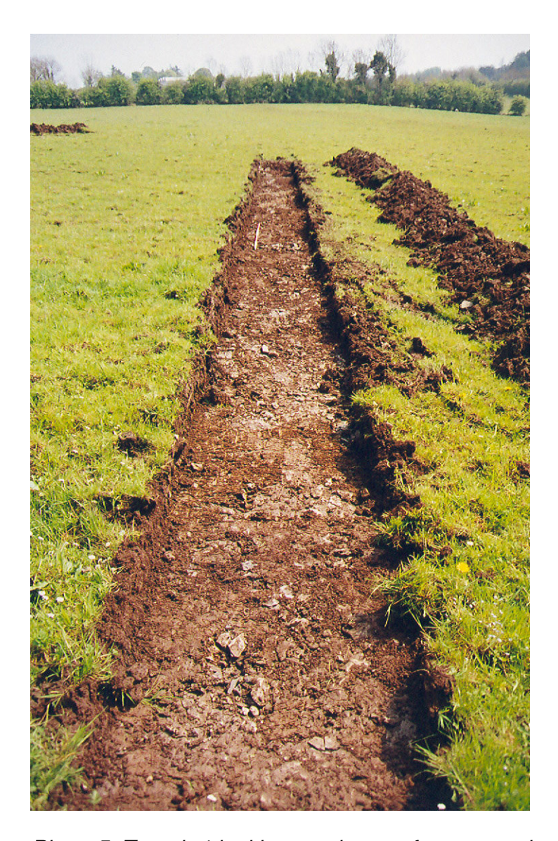
Photo 5: Trench 4 looking southeast after excavation showing surface of bedrock (Context 402).