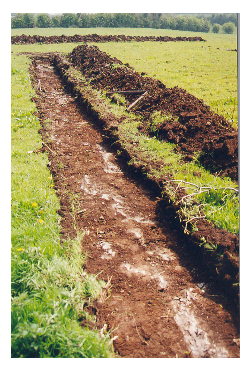
Photo 3: Trench 2 looking southeast after excavation showing surface of bedrock (Context 202).