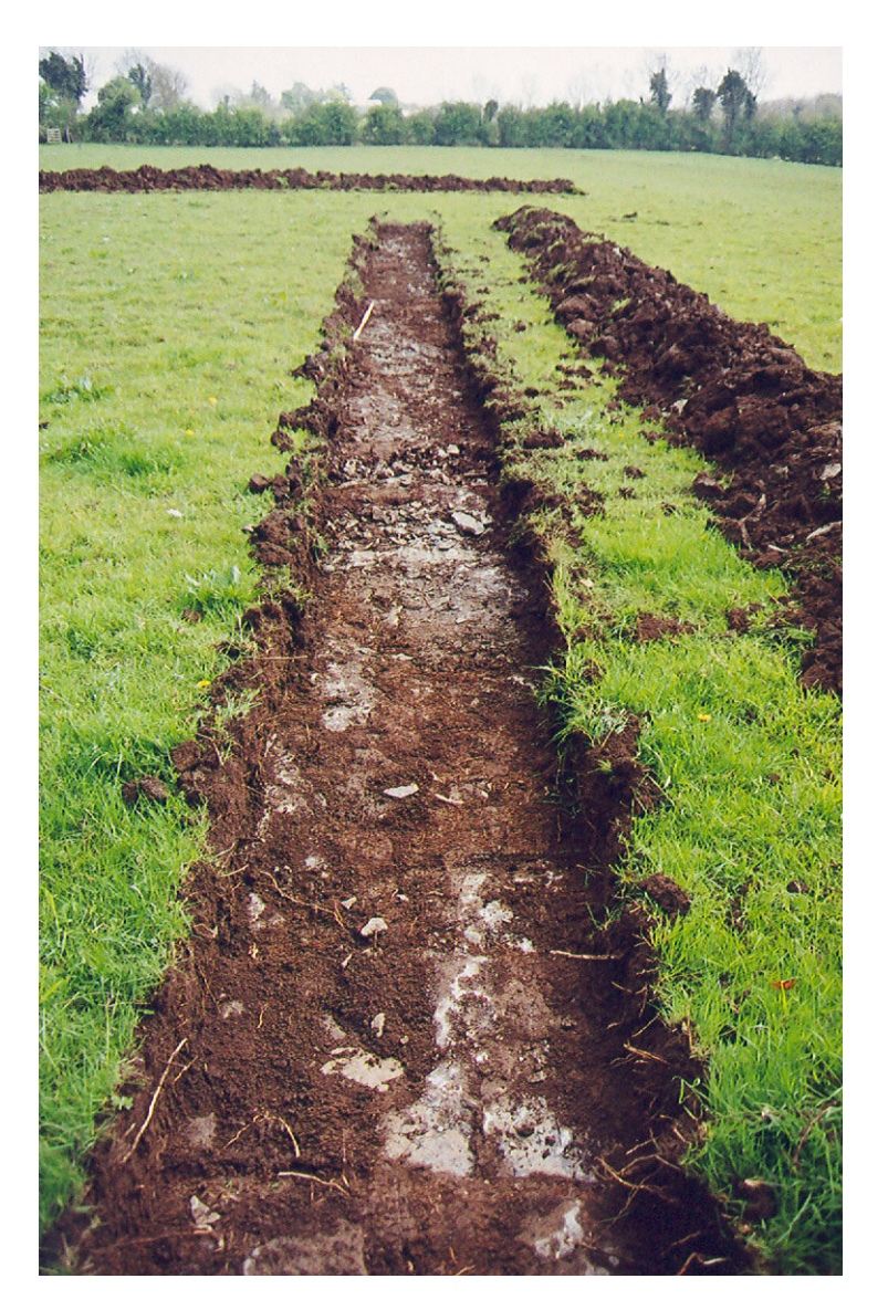
Photo 4: Trench 3 looking southeast after excavation showing surface of bedrock (Context 302).