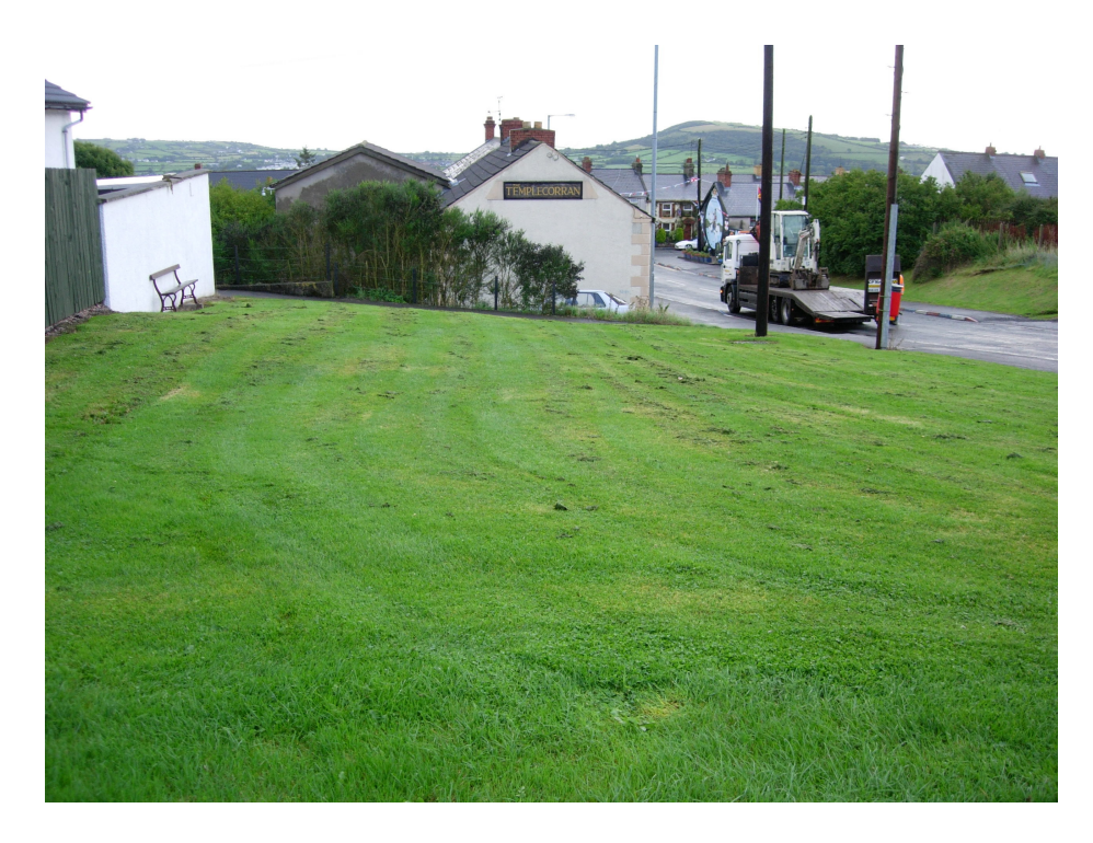
Plate One: General view of site prior to excavation, looking east