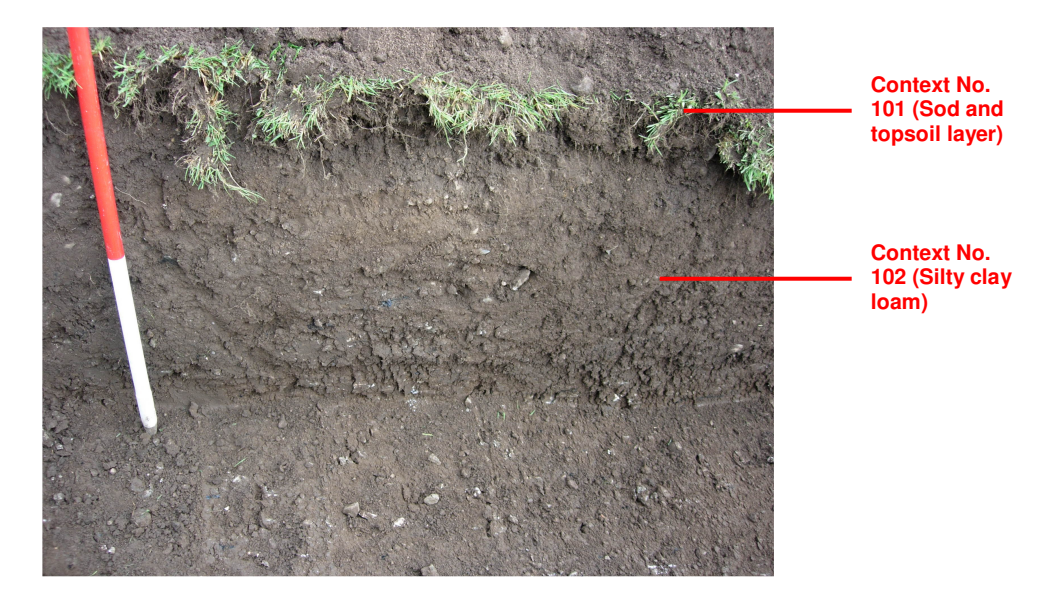
Plate Four: South facing section of Trench One, looking north