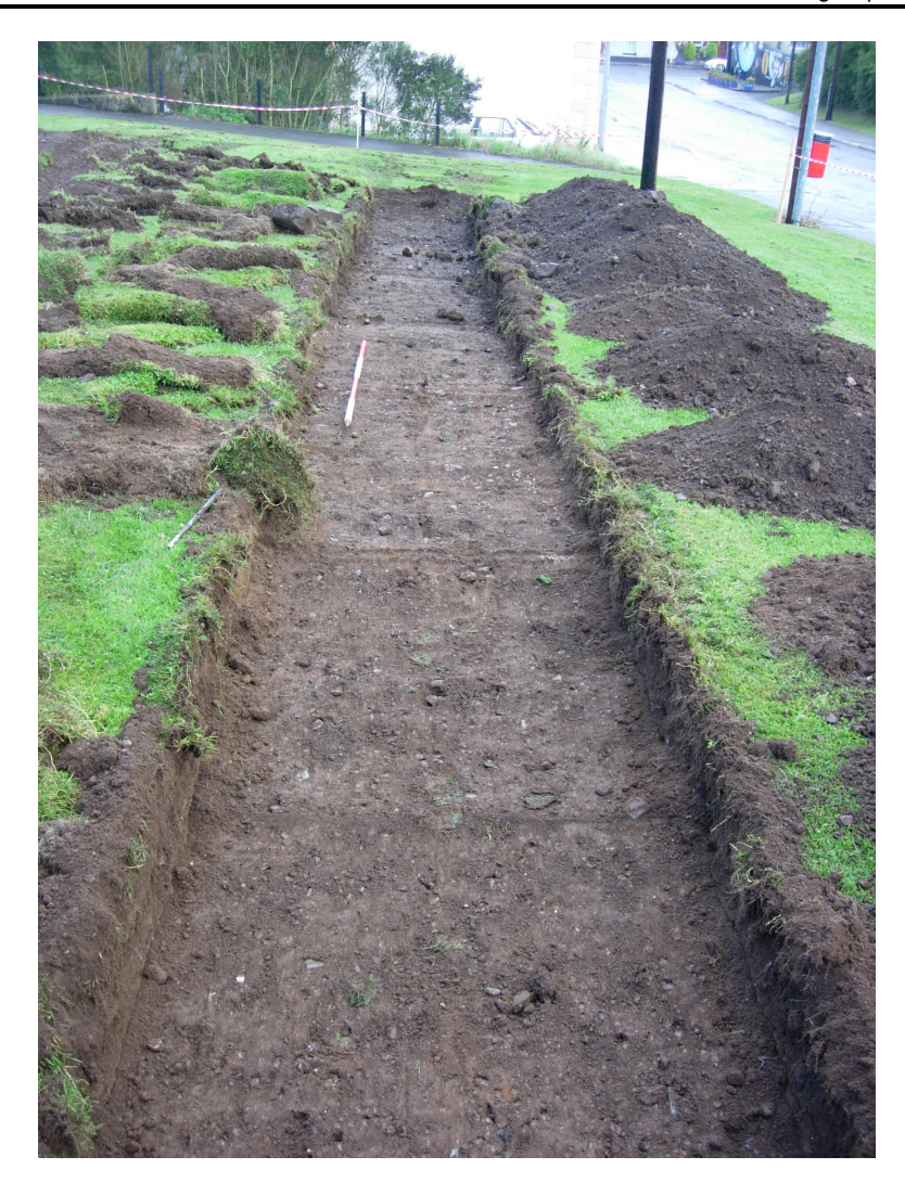
Plate Five: Trench Two following excavation to subsoil (Context No. 203), looking east