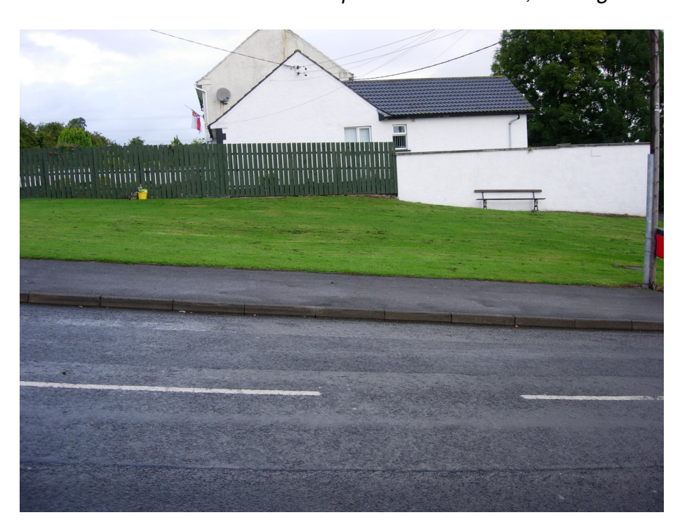
Plate Two: General view of site prior to excavation, looking north