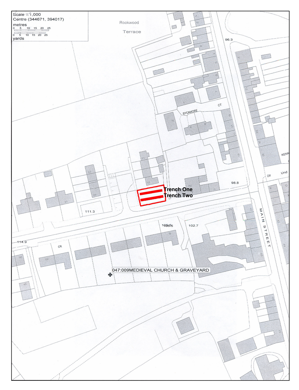
Figure Three: Site plan showing location of test trenches (in red)