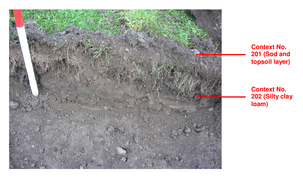
Plate Six: South facing section of Trench Two, looking north