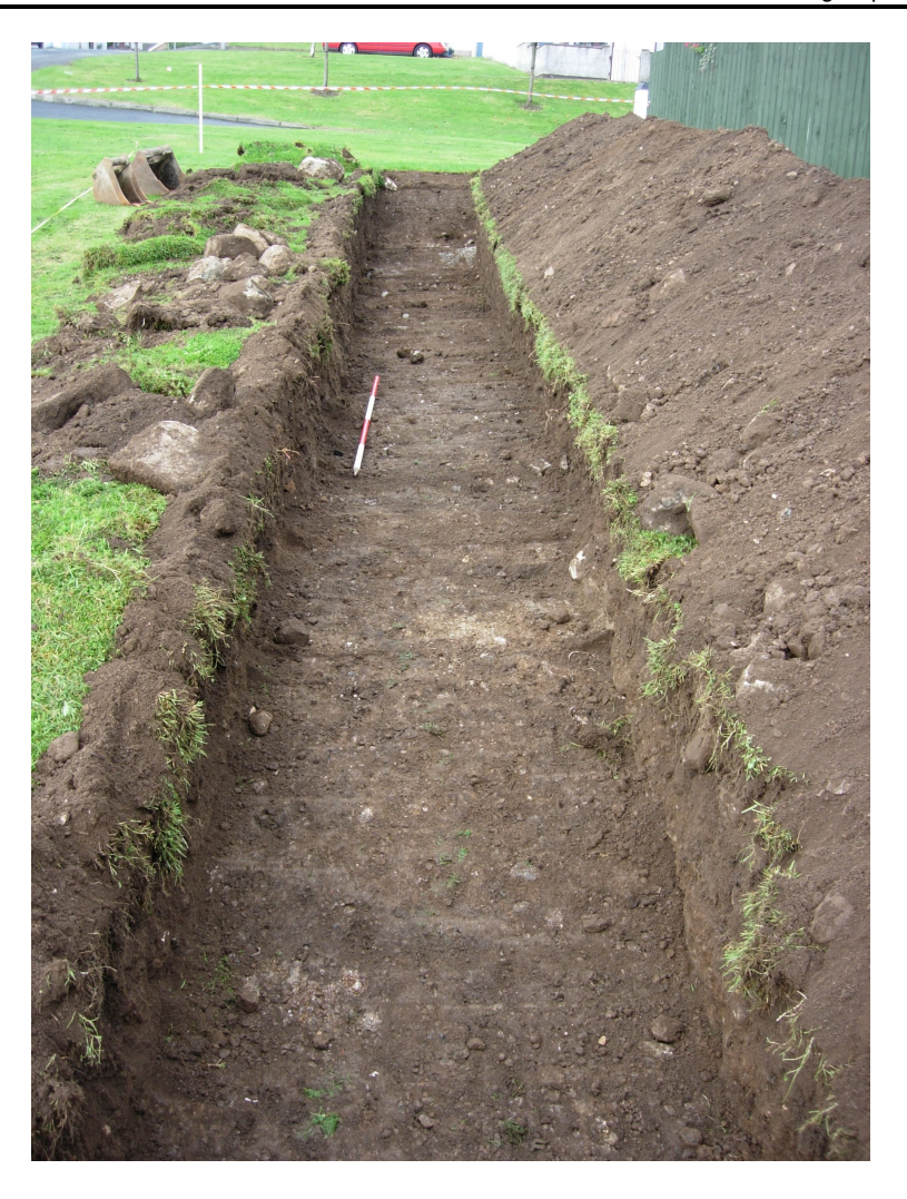
Plate Three: Trench One following excavation to subsoil (Context No. 103), looking west