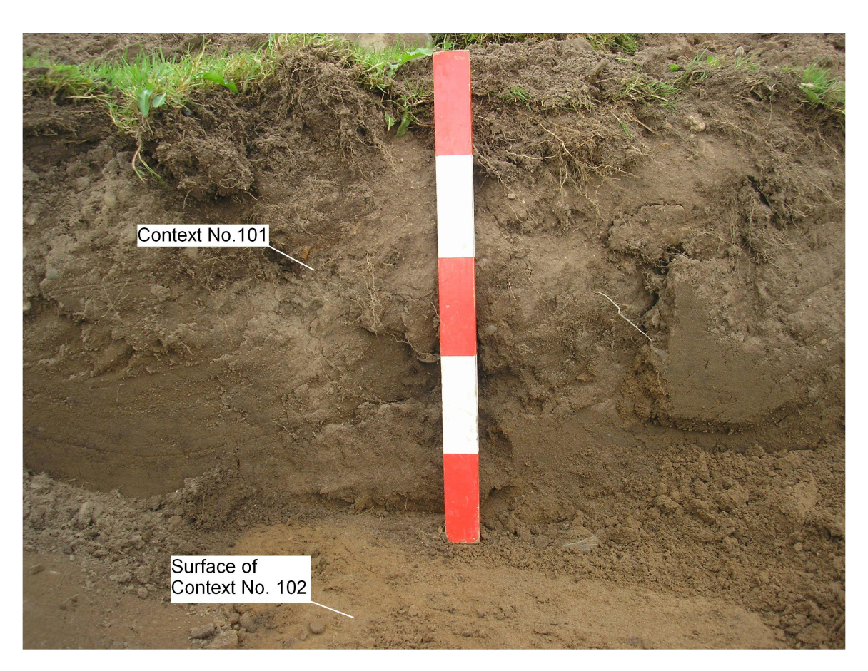
Plate 4: South facing section Trench 1