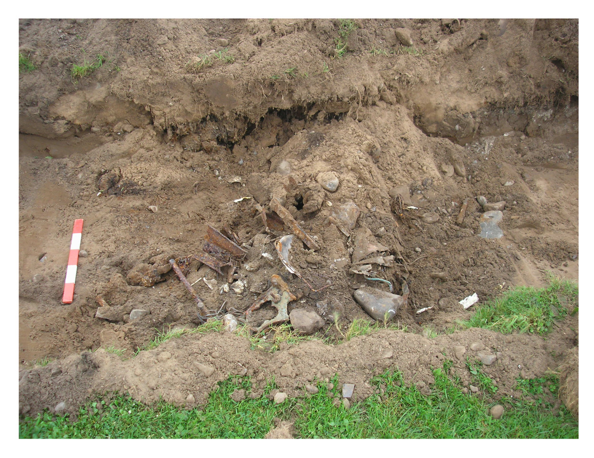
Plate 6: Detail of fill (Context No.206) of pit, looking west.