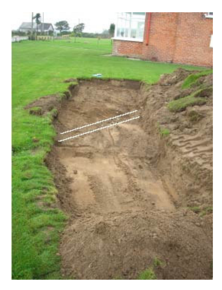
Plate 2: Trench 1 looking west, after excavation to surface of subsoil (Context No.102), showing cut (Context No. 103) for electric cable (white dashed line).