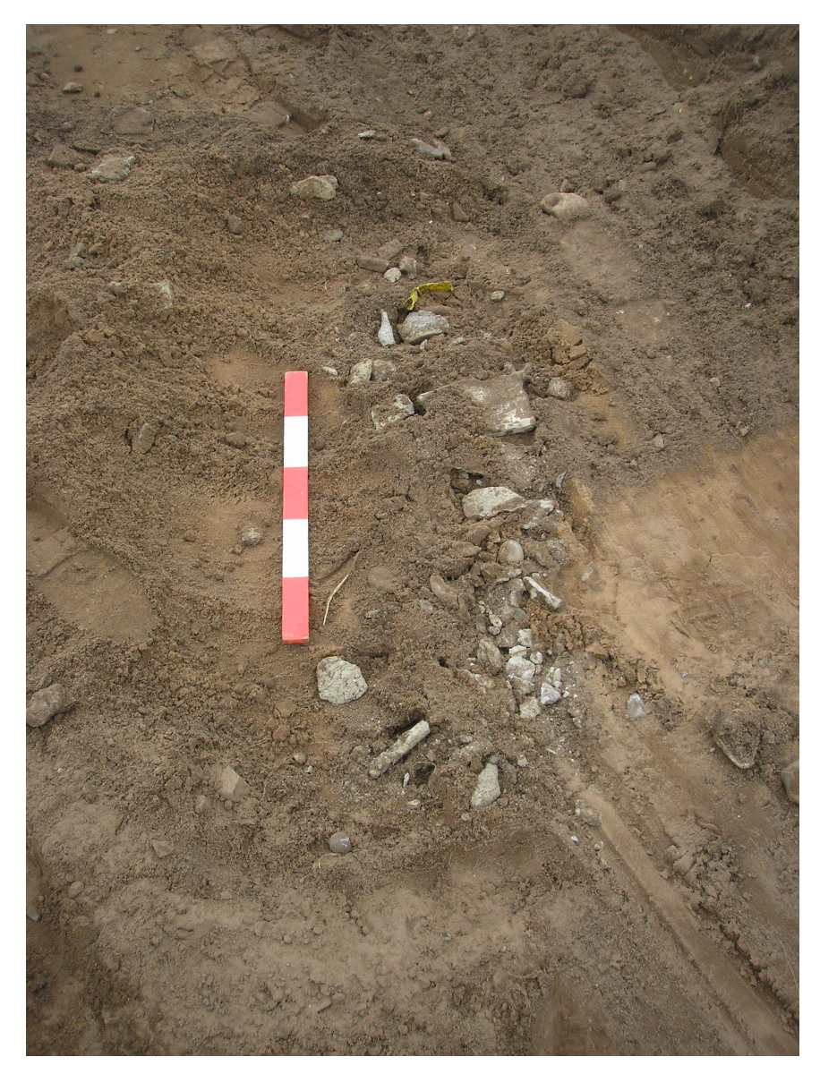
Plate 3: Detail of stone fill (Context No.104) of the cut (Context No. 103) for the electric cable.