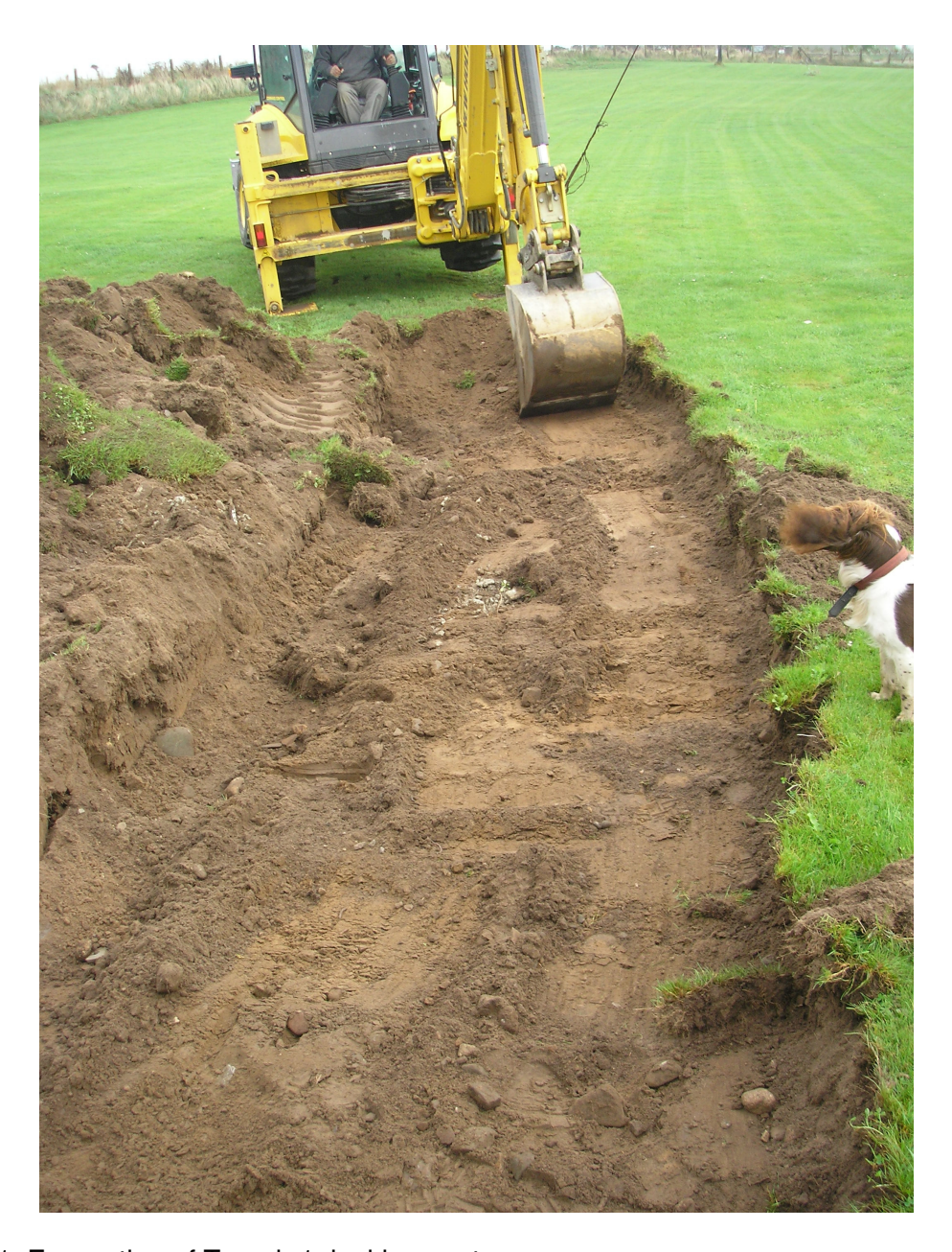
Plate 1: Excavation of Trench 1, looking east.