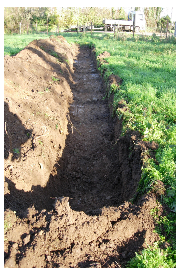
Plate 3: Trench 3 looking north-east.