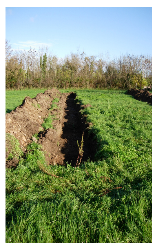
Plate 1: Trench 1 looking north-east.

(The position of the sun on the day of the evaluation caused problems with shadow in the photographs).