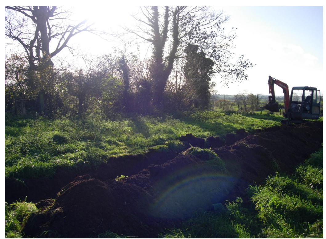
Plate 5: Trench 1 and curving lane boundary, looking south-south-west.