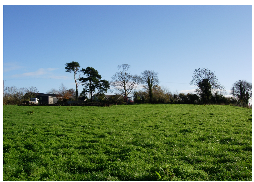
Plate 4: View of site and curving lane boundary, looking east.