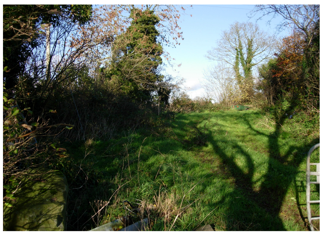
Plate 6: Curving lane boundary from the interior of the lane, looking north.