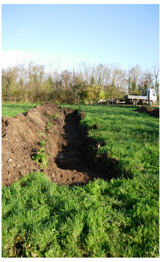
Plate 2: Trench 2 looking north-east.