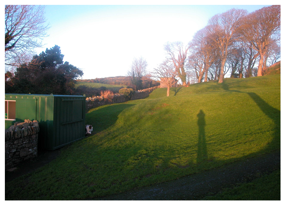
Plate 1: Photo showing new portacabin, boundary wall and toilet block, looking north-west.