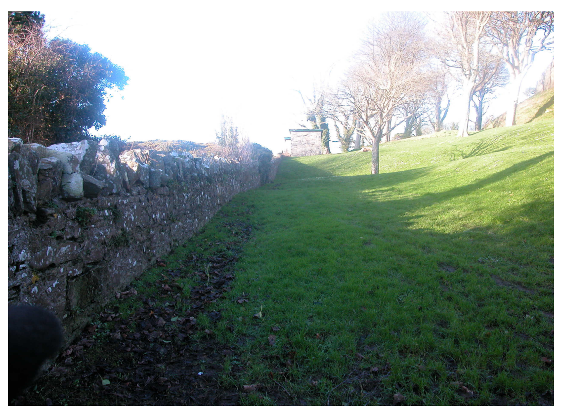
Plate 3: Boundary wall looking north-west towards toilet block.