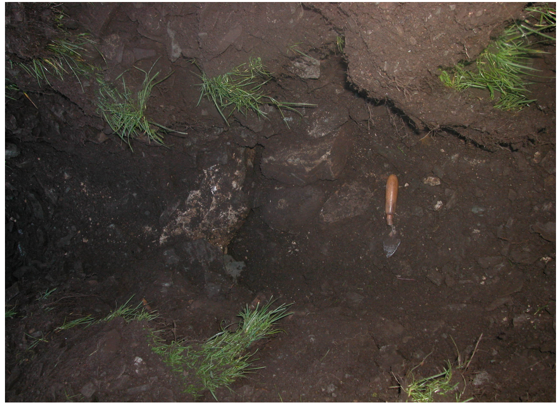
Plate 4: Mortared stones (Context 202) in Trench 2.