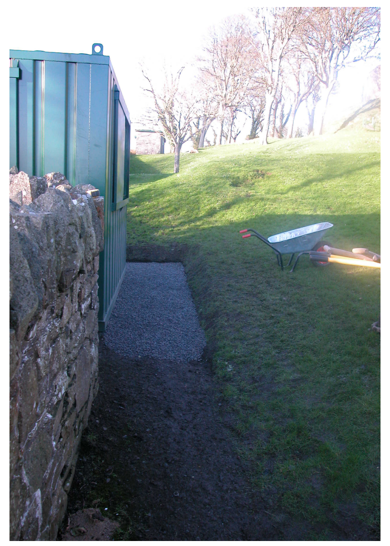
Plate 2: Trench 1 on north-east side of portacabin after excavation and laying of gravel.