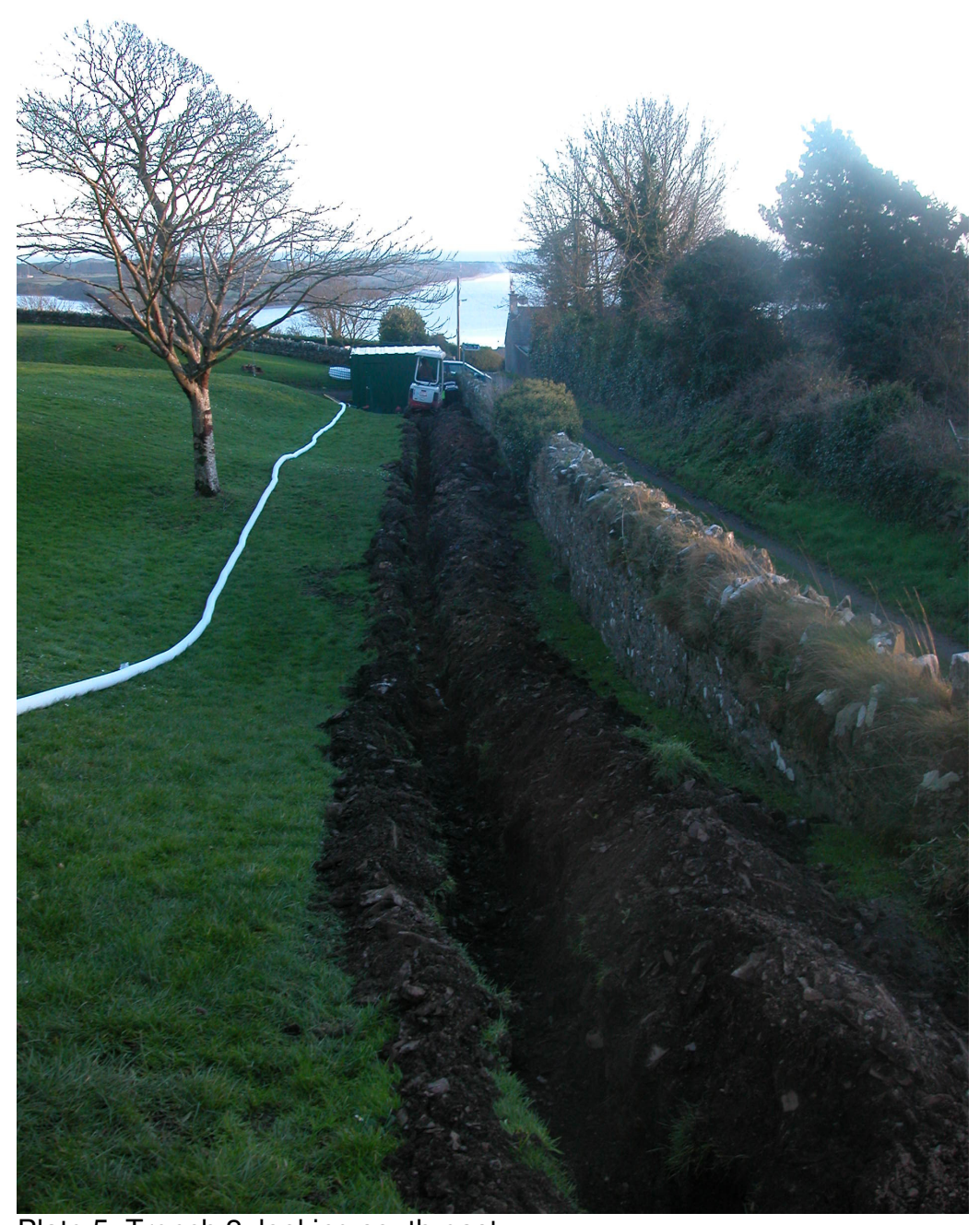
Plate 5: Trench 2, looking south-east.