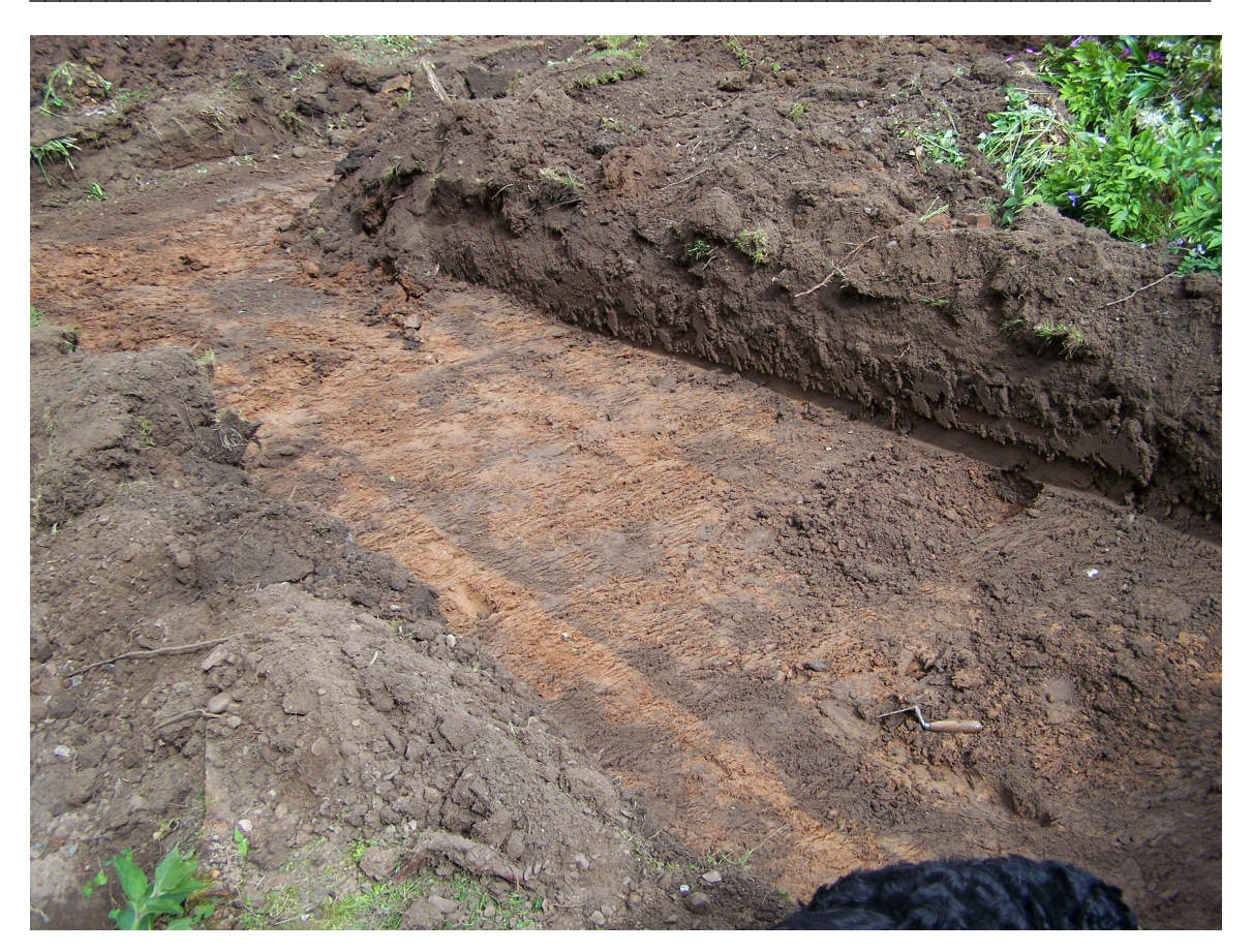
Plate 2 General shot showing the reddish orange glacial subsoil (Context No. 103)