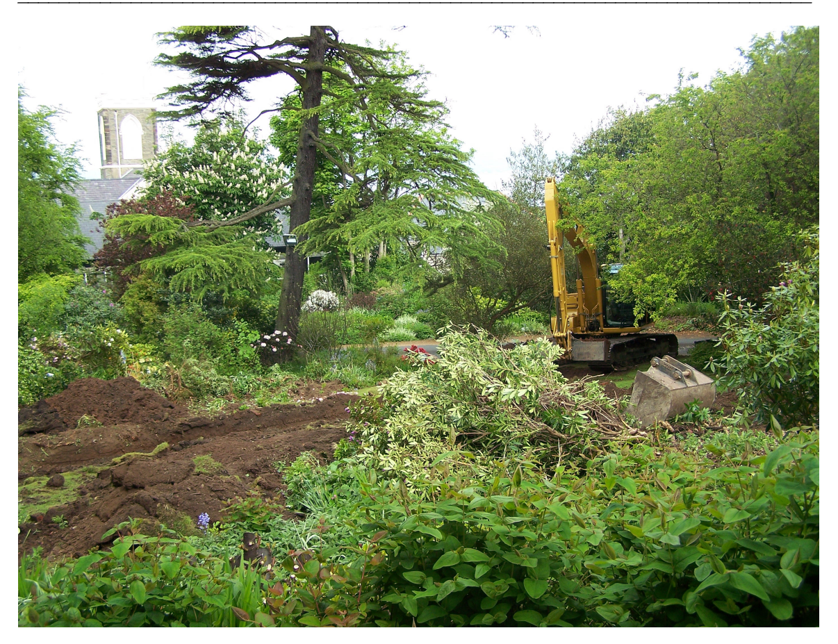
Plate 1 General shot showing scale of the mature planting. Looking NW.