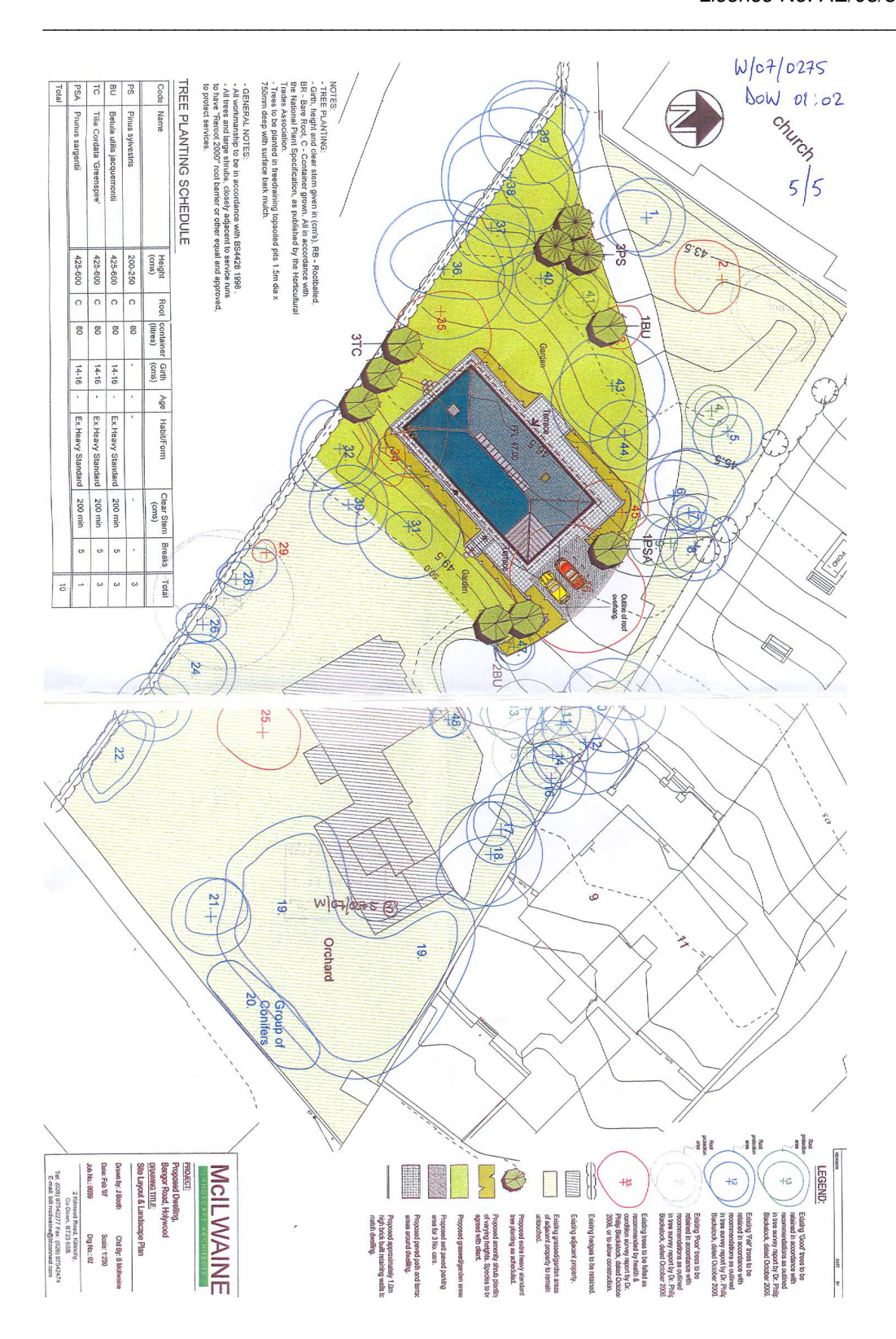
Fig. 2 Architects plan of the proposed development indicating the heavy planting on site and areas to be preserved