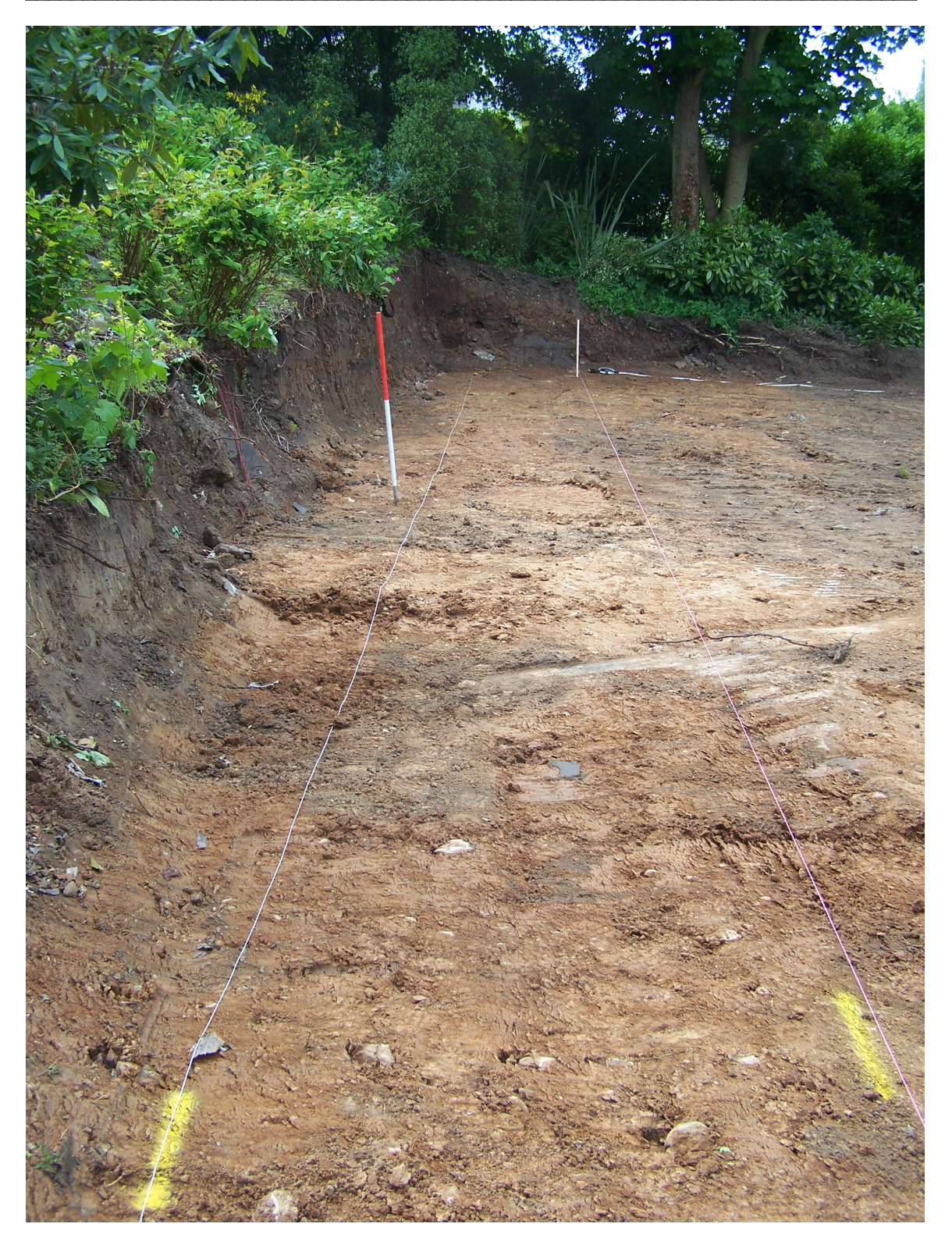
Plate 4 General shot looking SW showing the proposed development site after topsoil stripping.