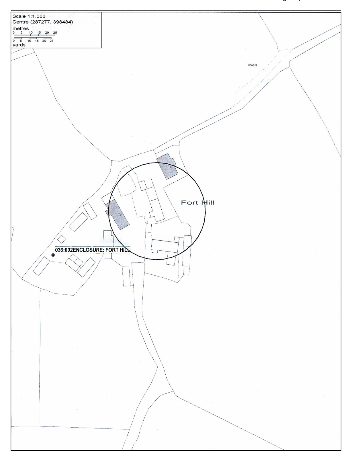
Fig 3: Map showing application site