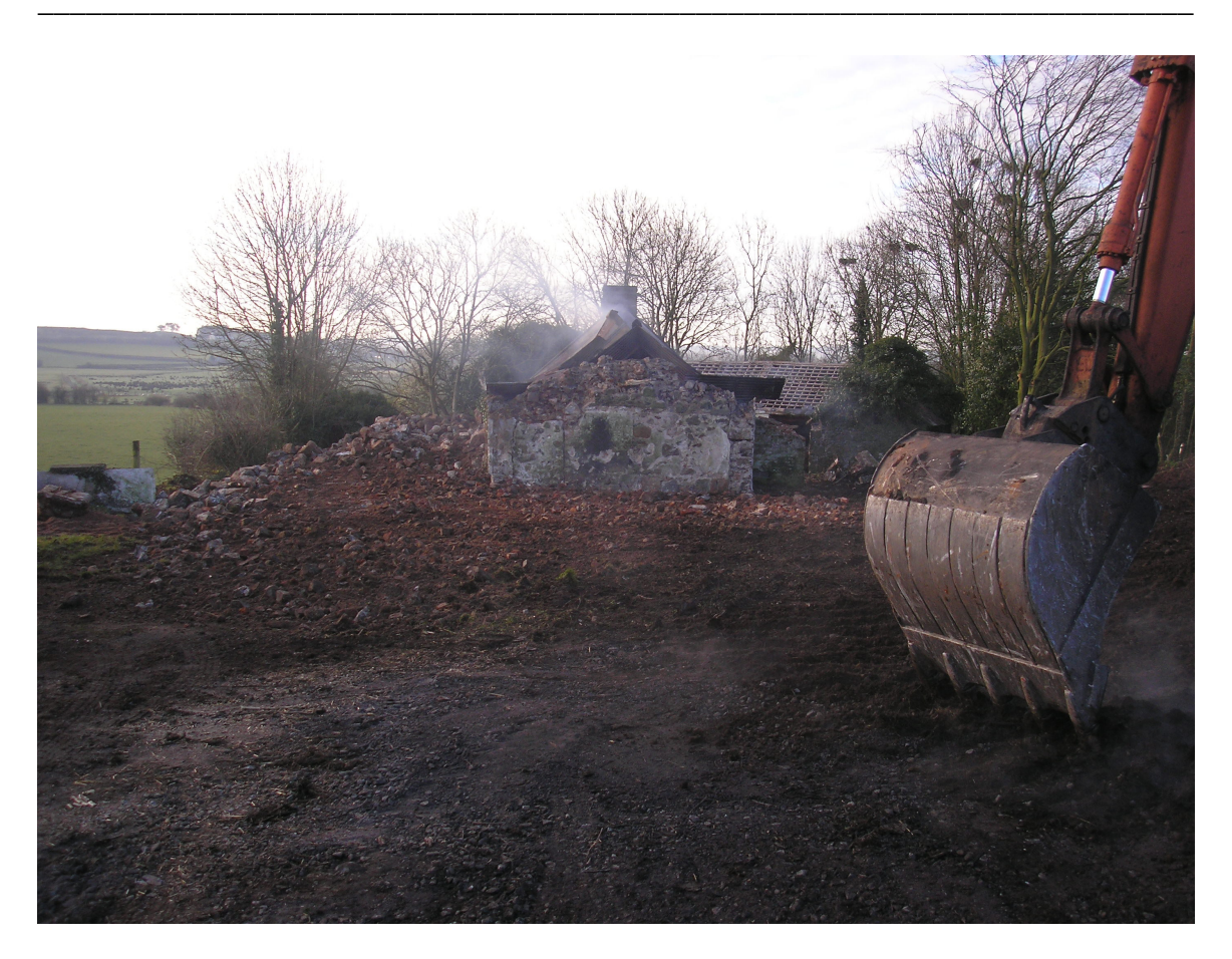
Plate 1: Application site prior to the excavation, looking south.