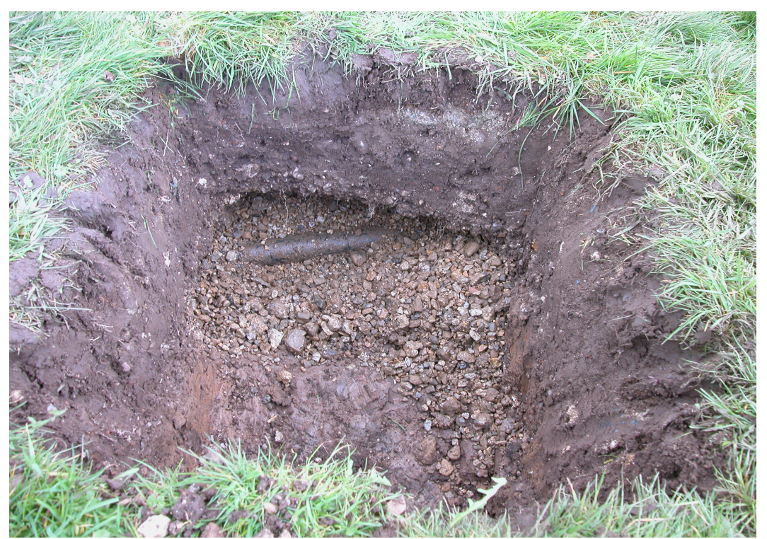
Plate 2: Trench showing plastic pipe in gravel (Context 103), looking east.