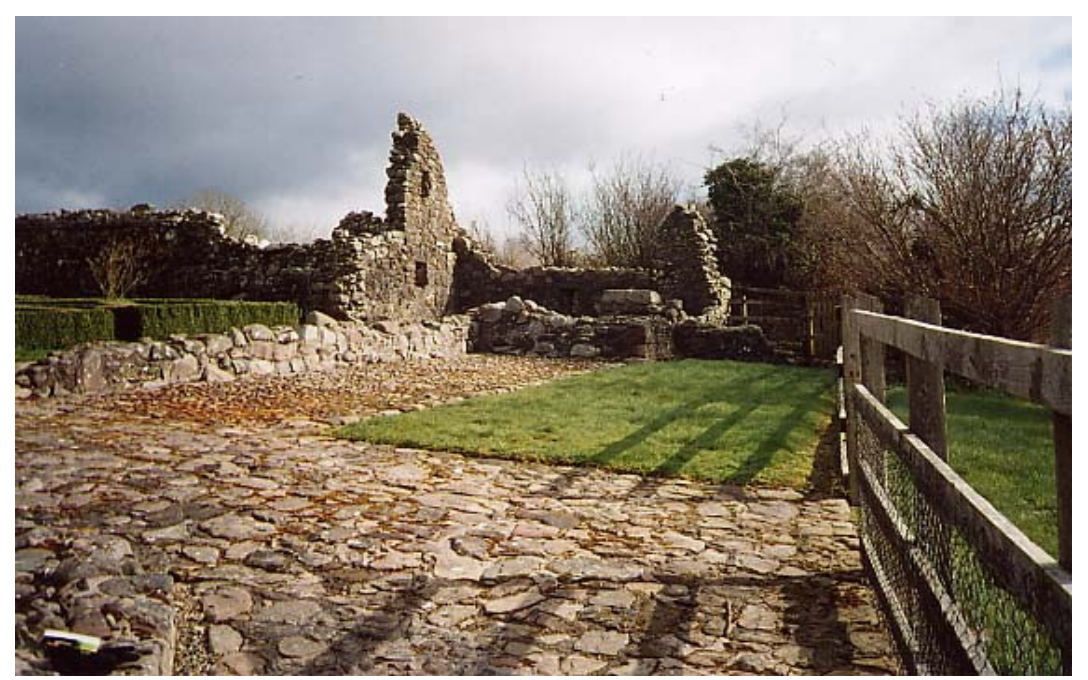
Plate 1: Location of trench pre-excavation, looking north-east towards south-east flanker.