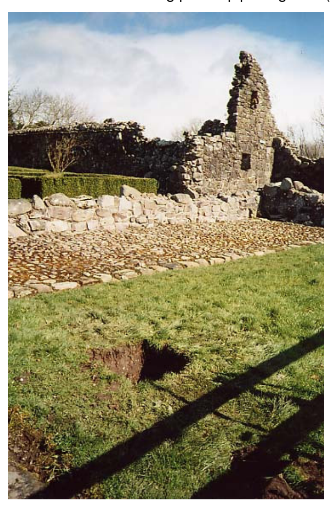
Plate 3: Trench post-excavation, looking north-east.