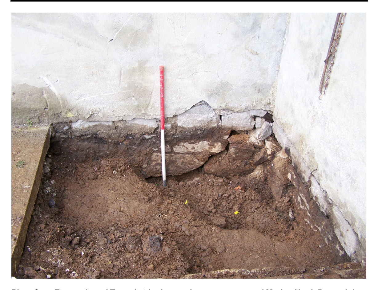
Plate One: Excavation of Test pit 1 in the southwestern corner of Market Yard. Base of the foundations are visible, looking south.