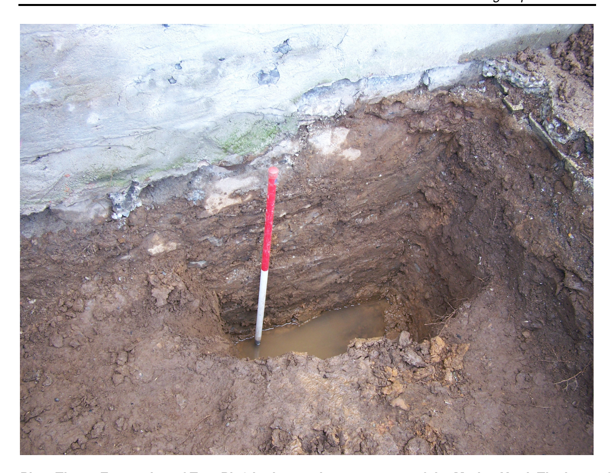
Plate Three: Excavation of Test Pit 3 in the south-eastern area of the Market Yard. The base of the foundations are visible, looking east.