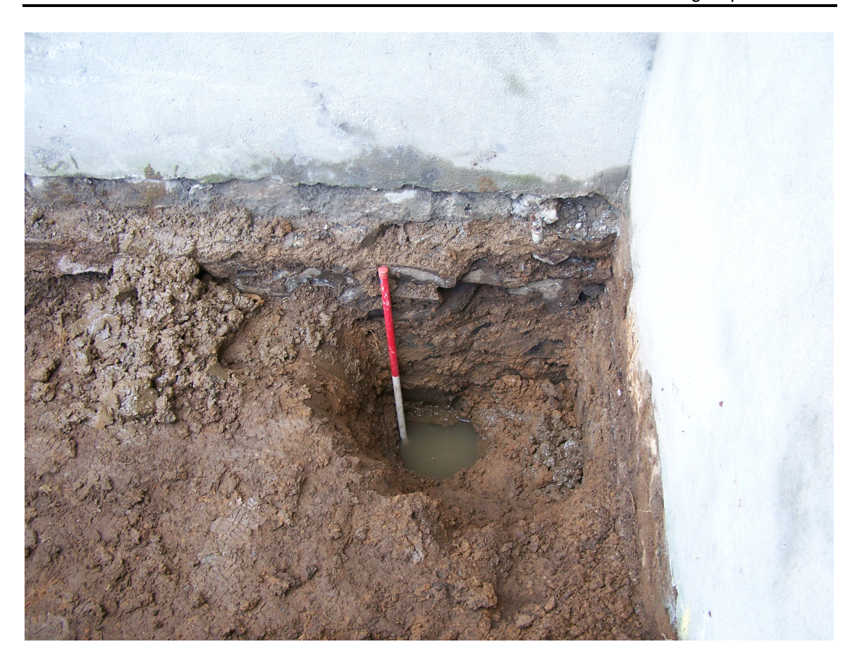
Plate Four: Excavation of Test Pit 4 in the north-eastern corner of the Market Yard. The base of the foundations of the wall can be seen.