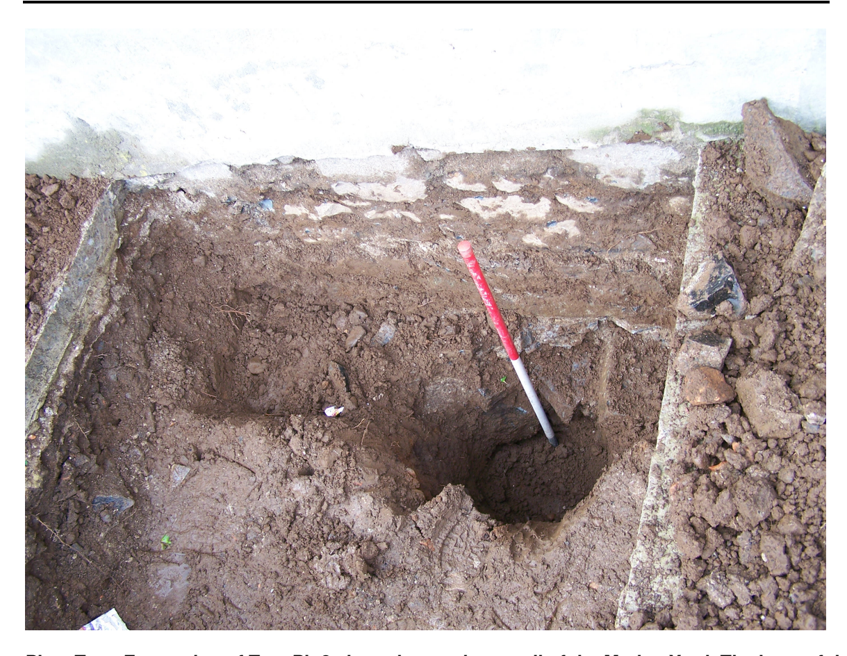
Plate Two: Excavation of Test Pit 2 along the southern wall of the Market Yard. The base of the foundations are visible, looking south.