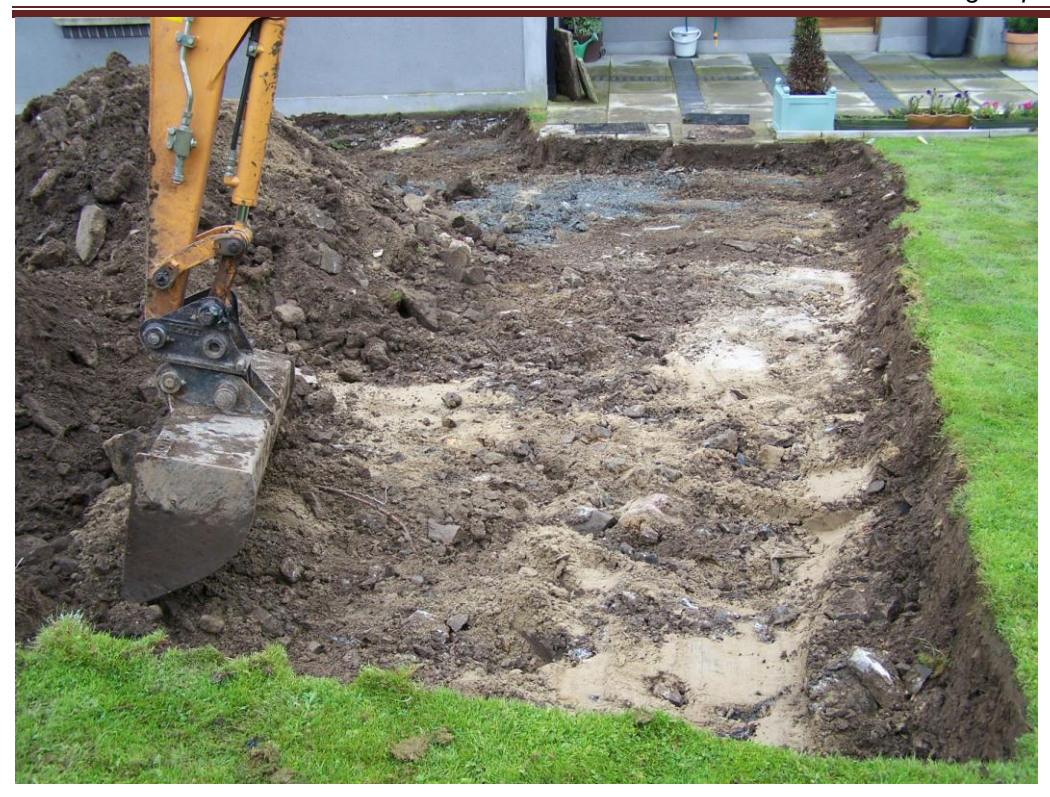
Plate 3. Horizon 3 being exposed in the northern half of the site. From the east.