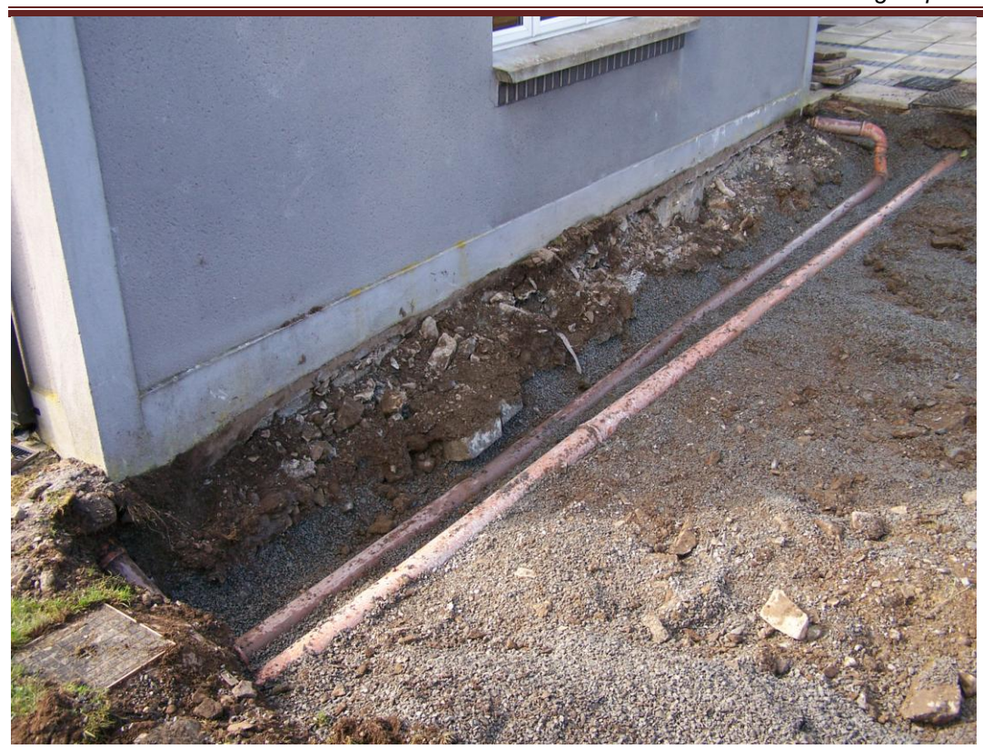
Plate 5. Modern service pipes in the west of site and Horizon 3. From the south-east.