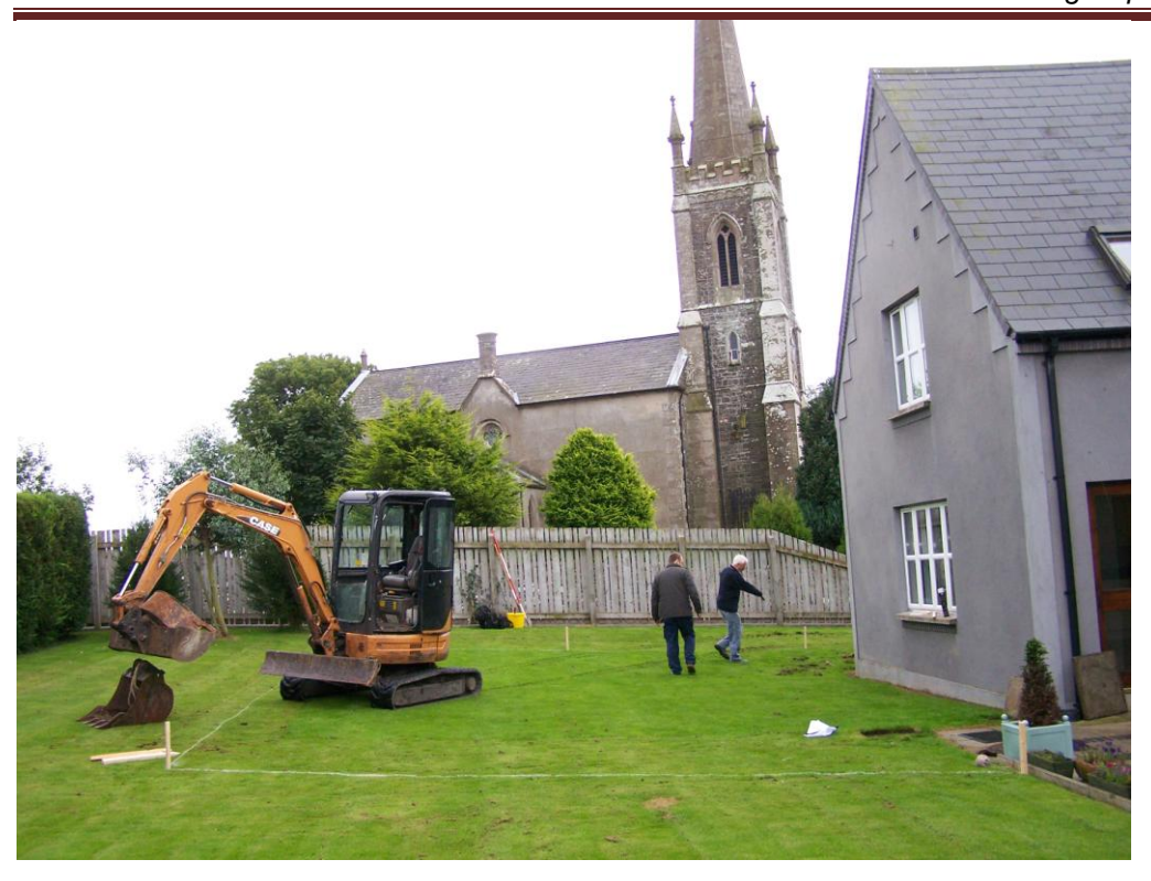
Plate 1. The outline of the extension to No. 25 Kilmood Church Road before ground works commenced. 13/09/10. From the north.