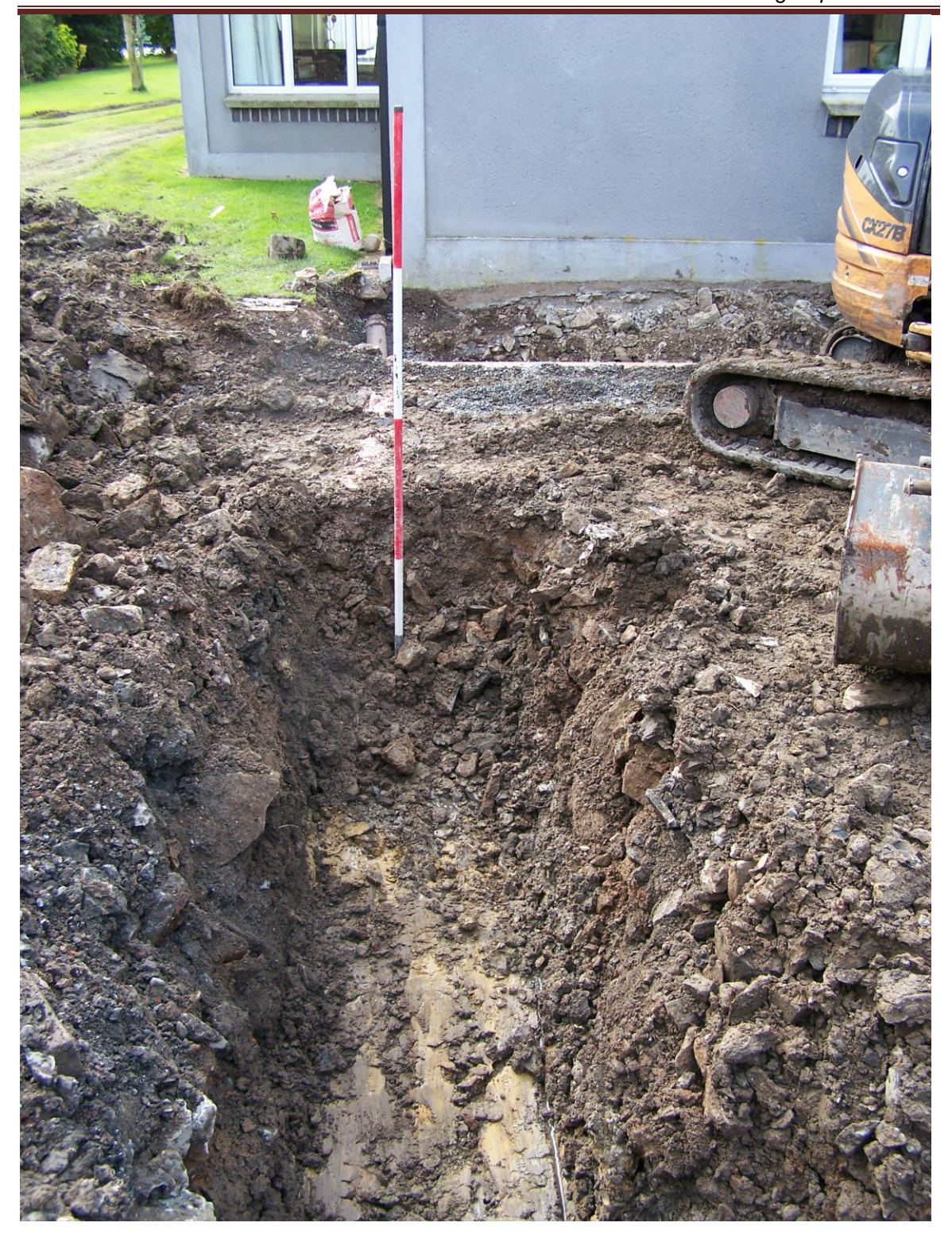
Plate 7. Subsoil clay (Horizon 6) exposed below Horizon 5, in the base of the southern foundation trench for the walls of the extension to No. 25 Kilmood Church Road. From the east.