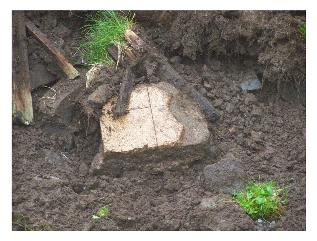
Plate 2. Modern tiles and wood in Horizon 2, in the northern half of the site.