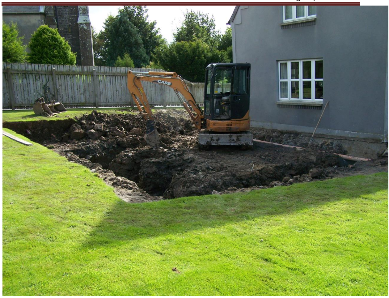
Plate 8. Completed ground works at the extension to No. 25 Kilmood Church Road- ground reduction and wall foundation trenches. 15/09/10. From the northeast.