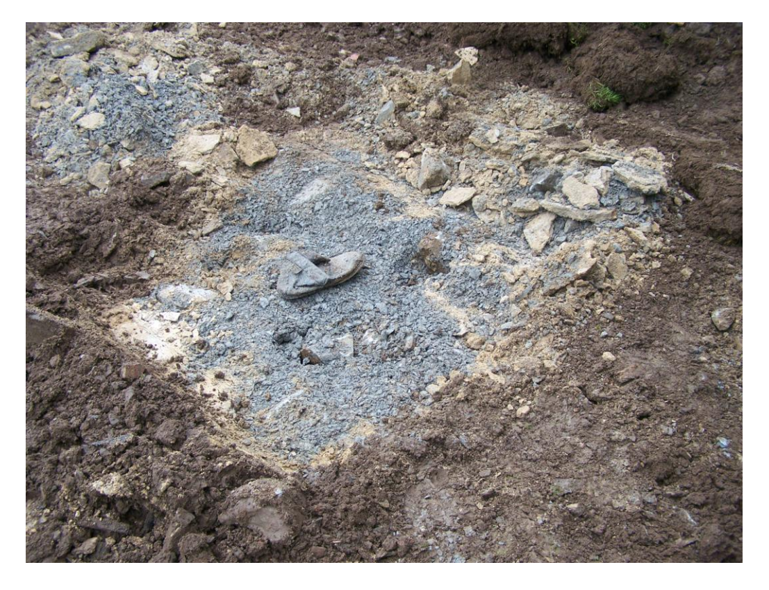
Plate 4. Modern workman's boot in Horizon 3, in west of site. From north.