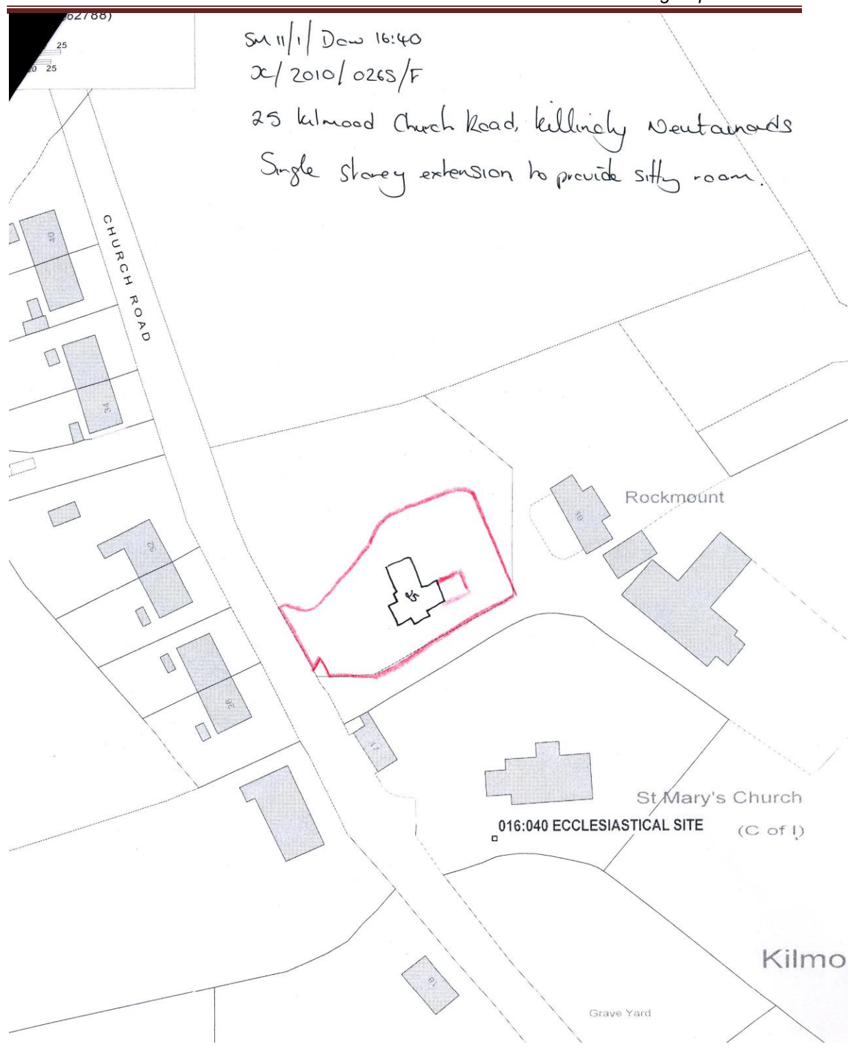
Fig 2. 25 Kilmood Church Road, Killinchy, Newtownards, County Down. Detail of proposed development.