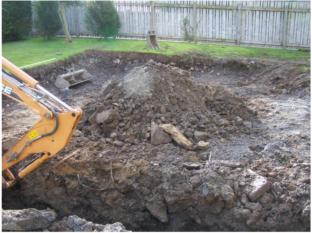
Plate 6. Spoil from Horizon 5, containing many large stones, in the west of site. From the north-west.